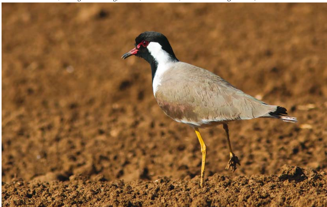
139 Red-wattled Lapwing / Indische Kievit Vanellus indicus , Kfar Blum, Hula valley, Israel, 15 November 2017 (Shai Agmon/Birding, Nature, Environment) cf Dutch Birding 39: 398, 2017