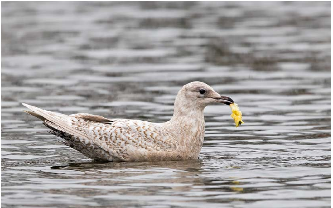
173 Kleine Burgemeester / Iceland Gull Larus glaucoides , eerste-winter, Zwolle, Overijssel, 23 januari 2018