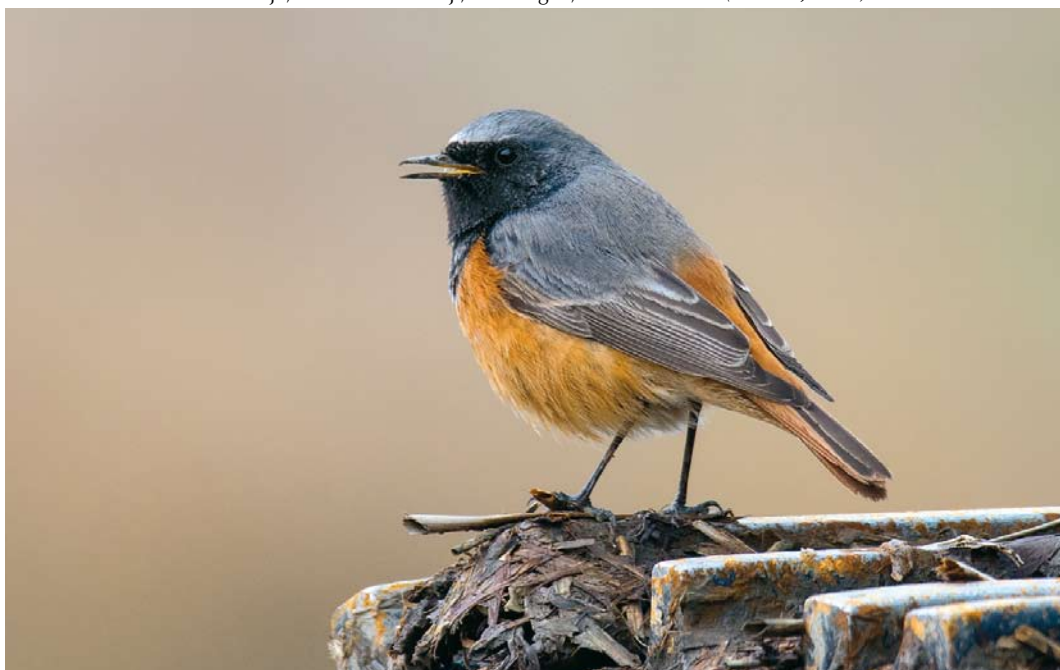
185 Oosterse Zwarte Roodstaart / Eastern Black Redstart Phoenicurus ochruros phoenicuroides , eerste-winter mannetje, Nieuwe Statenzijl, Groningen, 10 maart 2018 (Marnix Jonker)