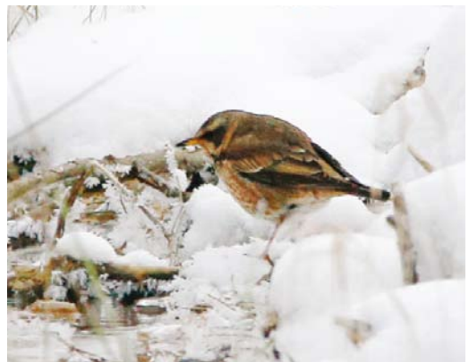
154 Long-toed Stint / Taigastrandloper Calidris subminuta , Eilat, Israel, 25 February 2018 155 Northern Harrier / Amerikaanse Blauwe Kiekendief Circus hudsonius , second-winter male, Murtoosa, Aveiro, Portugal, 5 February 2018 156 Mesopotamian Crow / Mesopotamische Kraai Corvus capellanus , adult, Sulaibiya, Kuwait, 17 February 2018 157 Oriental White-eye / Indische Brillvogel Zosterops palpebrosa , adult, Mahawat Island, Filim, Al Wusta, Oman, 25 January 2018 158 Oriental Skylark / Kleine Veldleeuwerik Alauda gulgula , Milleyha, Hatay, Turkey, 11 March 2018 159 Naumann's Thrush / Naumanns Lijster Turdus naumanni , first-winter, Savka, Peipsiääre, Estonia, 15 February 2018