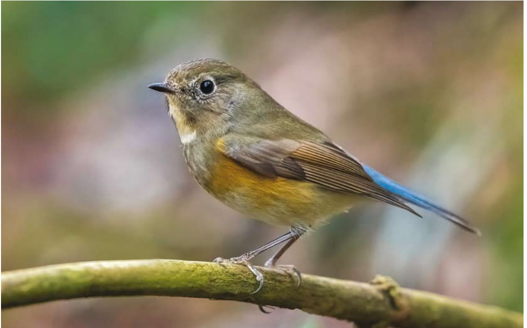
166 Red-flanked Bluetail / Blauwstaart Tarsiger cyanurus , first-winter, Montzen, Liège, Belgium, 7 January 2018 (Vincent Legrand)