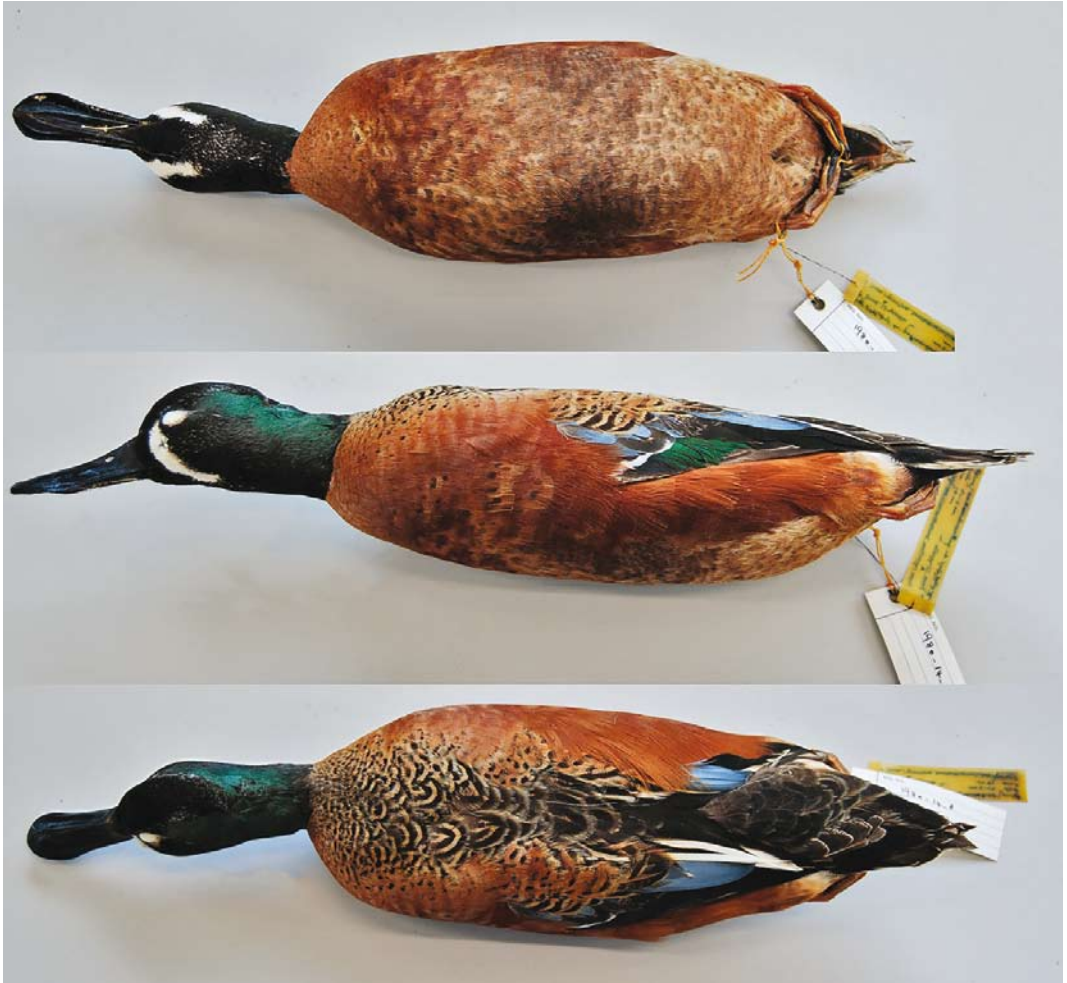
FIGURE 1 Hybrid Northern Shoveler x Cinnamon Teal / hybride Slobeend x Kaneeltaling Anas clypeata x cyanoptera , male, National History Museum, Tring, Hertfordshire, England, 2 September 2011. Bird of captive origin, died in April 1967. Note entirely cinnamon underparts, including breast, and absence of fine dark markings on flank.

in several birds rather broad, in others narrow. Moreover, the facial crescent is usually white but sometimes partly or wholly cinnamon coloured. The breast and flank are rusty reddish, similar in darkness to the rusty red colour of Cinnamon Teal body and Northern flank. In some cases, the breast is slightly paler rusty red than the flank but never (creamy) white. Breast and flank are uniformly coloured and unpatterned in most birds. In some individuals, some spotting can be seen on the breast and sometimes these hybrids show a hint of dark stripes on the upper flank. A creamy to pale reddish brown, unmarked patch is present on the rear