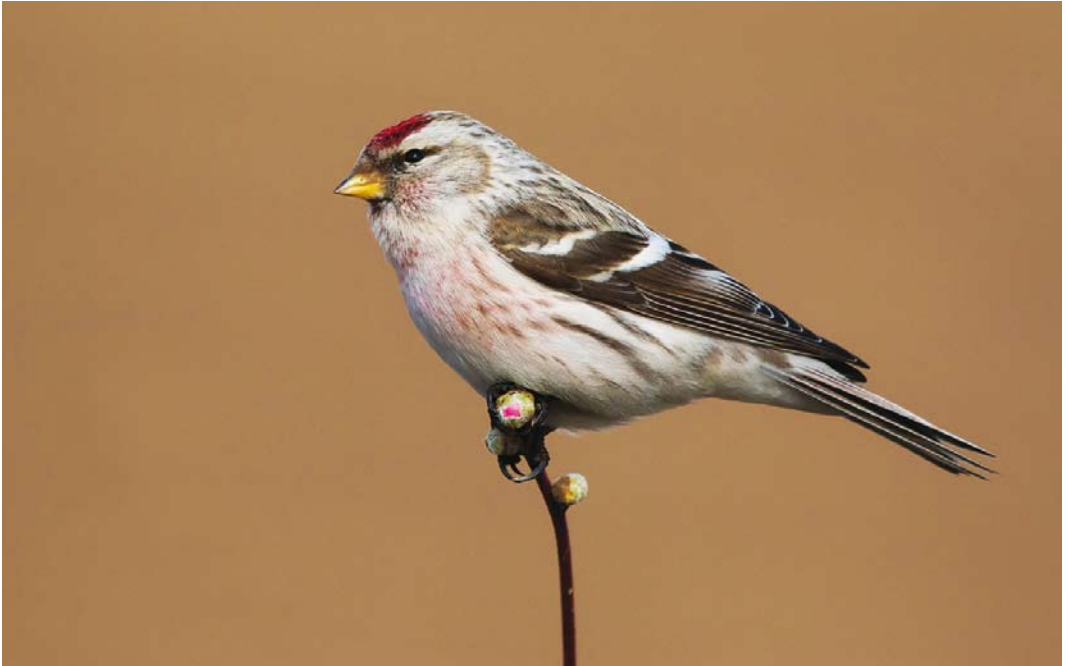
190 Witsluitbarmsijs / Coues's Redpoll Acanthis hornemanni exilipes , adult mannetje, Arnhem, Gelderland, 16 februari 2018 (Peter Soer)