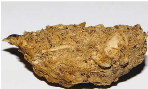
107 Pellet of Desert Owl / Palestijnse Bosuil Strix hadorami (Mohamed I Habib)

after sunset), called to the female loudly. Once the female accepted the prey, she gave a special call: a rapid hooting hu hu hu hu hu hu and bending her head forward which was the sign for the male to copulate. They copulated three times during a 15 min period for two successive nights. After that, eggs were laid at the nest site.