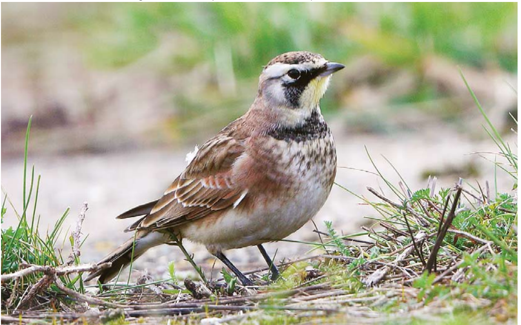
167 American Horned Lark / Amerikaanse Strandleeuwerik Eremophila alpestris , first-year, Staines Reservoir, Surrey, England, 29 January 2018