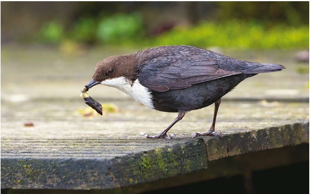
187 Zwartbuikwaterspreeuw / Black-bellied Dipper Cinclus cinclus cinclus , eerste-winter, Papendrecht, Zuid-Holland, 23 januari 2018 (Co van der Wardt)