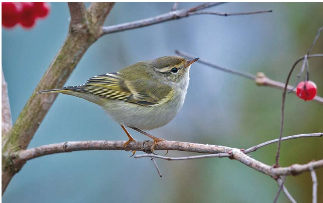
184 Bladkoning / Yellow-browed Warbler Phylloscopus inornatus , Leidsche Rijn, Utrecht, Utrecht, 5 januari 2018 (Toy Janssen)