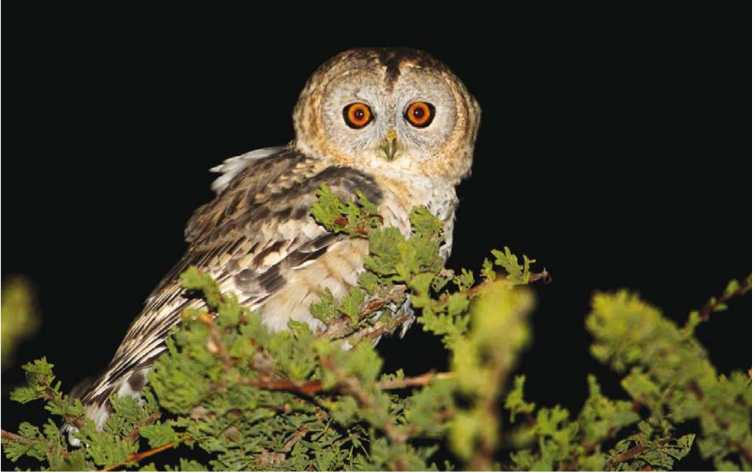
110 Desert Owl / Palestijnse Bosuil Strix hadorami , Wadi el Gemal, Egypt, 10 February 2017. Roosting in acacia.

chick pellets only contain parts of voles and scorpions that often protrude through the surface. Adult pellets consist mainly of vole remains with some invertebrate and bird material (table 2).