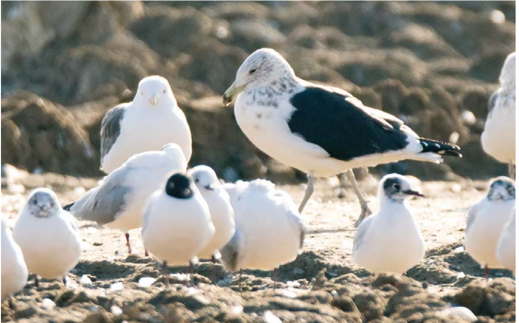
146 Cape Gull / Kelpmeeuw Larus dominicanus vetula , third-winter, Bouqueval, Val-d'Oise, France, 22 February 2018 ( Thibaut Chansac )