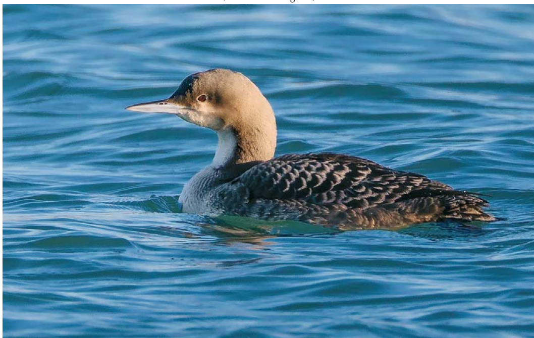
141 Pacific Loon / Pacifische Parelduiker Gavia pacifica , first-winter, Caspe, Aragon, Spain, 12 January 2018 ( Ricardo Rodríguez )