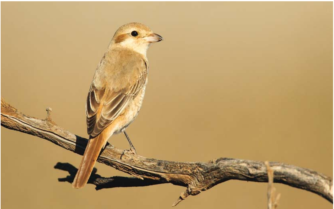
136 Daurian Shrike / Daurische Klauwier Lanius isabellinus , first-winter, Montaña de Taco, Buenavista del Norte, Tenerife, Canary Islands, 22 November 2017 (Beneharo Rodríguez)

Based on the photographs, the Tenerife bird concerned a first-year Daurian Shrike (cf Kiat & Perlman 2016). The general appearance was nearly uniform pale sandy-brown, almost lacking contrast between the grey-brown mantle and buff-white underparts (colder grey-brown upperparts and whiter underparts in phoenicuroides ). The supercilium was not distinctive and uniformly buff-white (whiter and more contrasting in phoe-