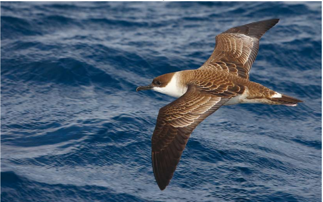
113 Great Shearwater / Grote Pijlstormvogel Puffinus gravis , Malpica, A Coruña, Spain, 29 August 2011 (Juan Sagardía)