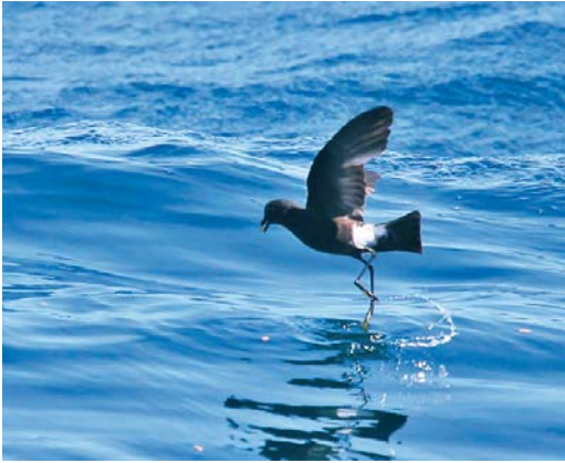
114 Wilson's Storm Petrel / Wilsons Stormvogeltje Oceanites oceanicus with floating pond pellet in its bill, Bay of Biscay, 80 km off Arcachon, Gironde, France, 6 August 2017