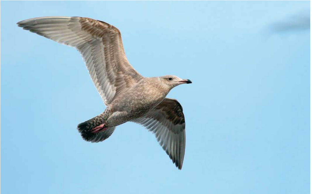
144 Presumed American Herring Gull / vermoedelijke Amerikaanse Zilvermeeuw Larus smithsonianus , first-winter, Puławy, Lubelskie, Poland, 25 January 2018 ( Lukasz Bednarz )