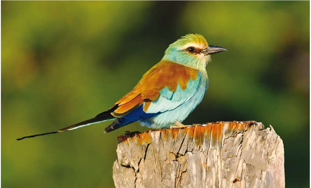
135 Abyssinian Roller / Sahelscharrelaar Coracias abyssinicus , adult, Nouadhibou, Mauritania, 31 October 2017 (Wim van Zwieten)