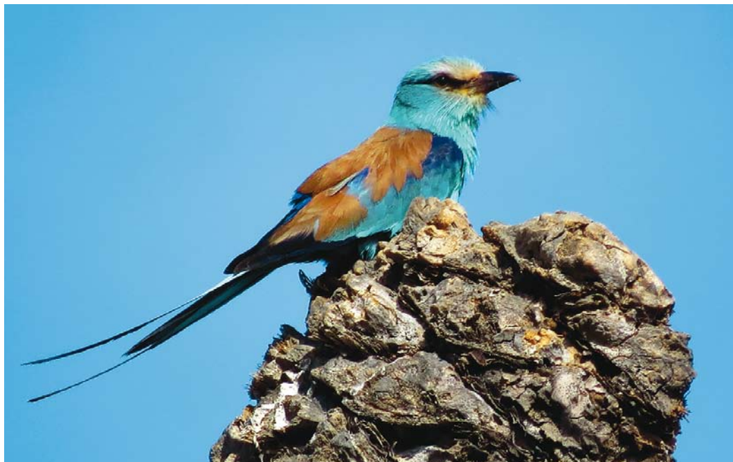
127 Abyssinian Roller / Sahelscharrelaar Coracias abyssinicus , adult, Barranco de la Torre, Antigua, Fuerteventura, Canary Islands, 13 June 2014 (Francisco Javier García Vargas)

between Africa and the Arabian Peninsula (Jennings 2010).