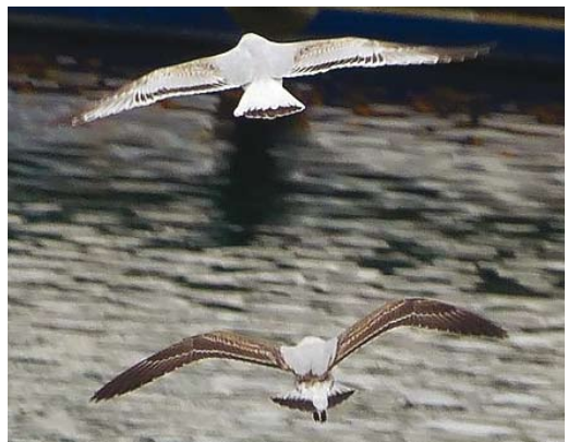
121-123 Mediterranean Gull / Zwartkopmeeuw Larus melanocephalus , first-winter, L'Ametlla de Mar, Tarragona, Spain, 28 January 2015 (Pere Josa) 124 Mediterranean Gull / Zwartkopmeeuw Larus melanocephalus , first-winter, L'Ametlla de Mar, Tarragona, Spain, 6 February 2015 (Pere Josa) 125 Mediterranean Gull / Zwartkopmeeuw Larus melanocephalus , first-winter, L'Ametlla de Mar, Tarragona, Spain, 17 February 2015 (Pere Josa) 126 Mediterranean Gulls / Zwartkopmeeuwen Larus melanocephalus , first-winter, L'Ametlla de Mar, Tarragona, Spain, 17 February 2015 (Pere Josa). Individual with atypical dark upperwings (below) and normal individual. Plate 121-126 all depict the same individual with atypical dark upperwings.