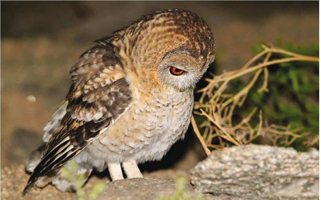
102-103 Desert Owl / Palestijnse Bosuil Strix hadorami , Wadi el Gemal, Egypt, 10 February 2017. During calling, throat badge of conspicuously pale feathers appears.