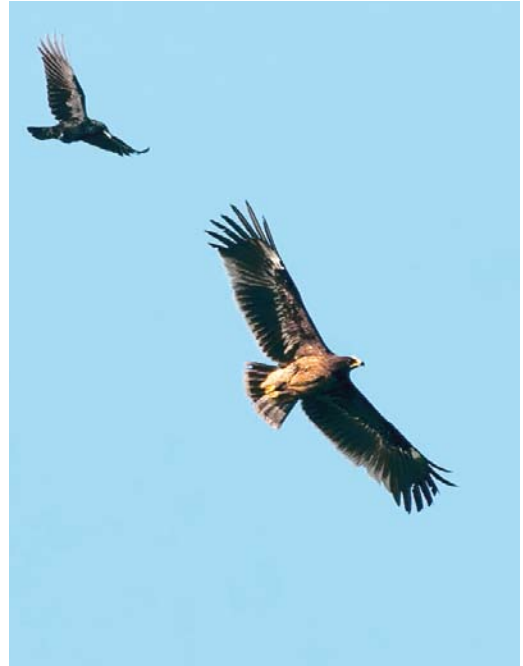
176 Bastaardarend / Greater Spotted Eagle Aquila clanga , eerstejaars, Bergambacht, Zuid-Holland, 20 februari 2018 177 Bastaardarend / Greater Spotted Eagle Aquila clanga , eerstejaars, Polsbroekerdam, Utrecht, 18 februari 2018 178 Bastaardarend / Greater Spotted Eagle Aquila clanga , eerstejaars, Bergambacht, Zuid-Holland, 21 februari 2018