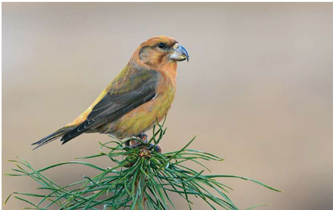
188 Grote Kruisbek / Parrot Crossbill Loxia pytyopsittacus , onvolwassen mannetje, Heidestein, Zeist, Utrecht, 27 februari 2018 (John van der Graaf)