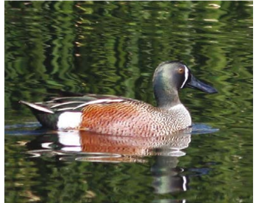
98 Hybrid Northern Shoveler x Blue-winged Teal / hybride Slobeend x Blauwvleugeltaling Anas clypeata x discors , male, Schwabhausen gravel pits, Gotha, Thüringen, Germany, 25 March 2014. Individual showing rather bold markings on breast and flank. Still, breast markings forming marbled pattern rather than scalloped pattern of Australasian Shoveler A. rhynchotis . Note dark eye, cream-white ground colour to breast, fairly slender spatulate bill and well-defined white facial crescent. 99 Hybrid Northern Shoveler x Blue-winged Teal / hybride Slobeend x Blauwvleugeltaling Anas clypeata x discors , male, Sweetwater Wetlands, Tucson, Arizona, USA, 22 February 2012

grey head with only very slight green iridescence in some light conditions. The facial crescent is pure white and thin but well defined and extends (almost) onto the chin. Northern Shoveler showing this crescent in the early stages of moult back to breeding plumage do often look more untidy with the crescent less clearly defined and also with some dark spotting. Also, the scaling on flank and breast appears more irregular than in Australasian. In late moult, very few Northern show a thin white crescent while already having a white breast and dark unmarked reddish flank. An important character to distinguish this species from the hybrids discussed above are the bold dark spots and scaling on the breast and at least the upper flank (cf Madge & Burn 1988). In most cases, the lower flank in Australasian is distinctly spotted. The white patch at the rear flank is generally similar to Northern but in some individuals a few dark markings occur in the white patch. Moreover, Australasian has a fairly straight transition between the culmen and forehead, giving a remarkably heavy-headed appearance. The legs are slightly more yellowish orange than in Northern, which has deeper orange legs. Scapulars and tertials are similar to those of Northern.