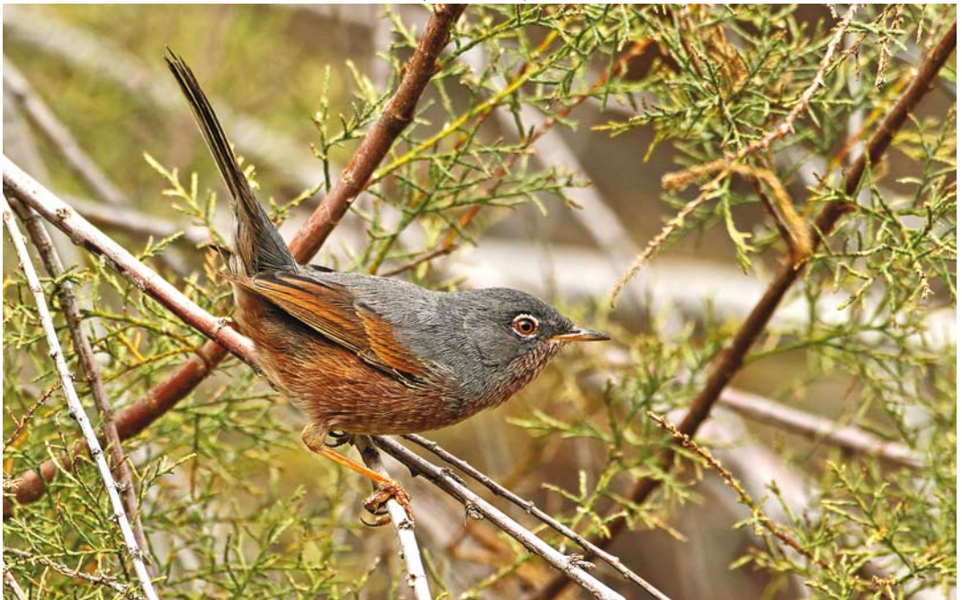
165 Tristram's Warbler / Atlasgrasmus Sylvia deserticola , male, Barranco de la Torre, Fuerteventura, Canary Islands, 4 February 2018 (Gary Thoburn)