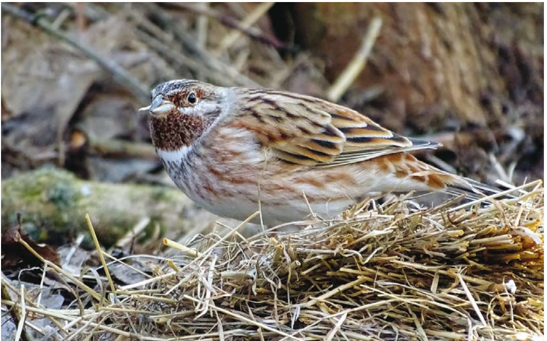
191 Witkopgors / Pine Bunting Emberiza leucocephalos , mannetje, Havenhoofd, Zuid-Holland, 28 februari 2018 (Enno B Ebels)