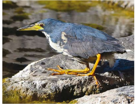
118 Dwarf Bittern / Afrikaanse Woudaap Ixobrychus sturmii , first-winter, Barranco de Río Cabras, Fuerteventura, Canary Islands, 18 December 2017

size and the small buff patch on the bend of the folded wing. He was able to take just one photograph before it flew off (plate 116). Unable to re-find the bird, and only having the Collins bird guide (Svensson et al 2009) at hand, VL decided to check the identification later at home. Back home, VL browsed his African bird guides. Unlikely as it seemed, only a Dwarf Bittern ticked all the boxes. VL sent the photograph to his friend Chris Bradshaw, who confirmed his suspicions. Elated and excited, VL published the photograph on Facebook and was pleased to receive an acknowledgement from Eduardo García-del-Rey. VL had not been able to see this species on any of his 11 visits to Africa, so it became a life-tick for him.