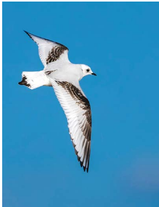
169 Ross' Meeuw / Ross's Gull Rhodostethia rosea , eerste-winter, Vlissingen, Zeeland, 28 januari 2018 ( René van Rossum ) 170-171 Ross' Meeuw / Ross's Gull Rhodostethia rosea , eerste-winter, Vlissingen, Zeeland, 5 februari 2018 ( Vincent Legrand )