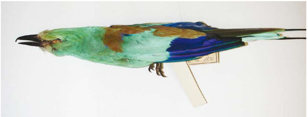
128 Abyssinian Roller / Sahelscharrelaar Coracias abyssinicus , adult, Barranco de la Torre, Antigua, Fuerteventura, Canary Islands, 13 June 2014 129 Abyssinian Roller / Sahelscharrelaar Coracias abyssinicus , Abu Simbel, Egypt, 29 September 1995 130 Abyssinian Roller / Sahelscharrelaar Coracias abyssinicus , adult (collected at unknown location, Egypt, 1874), Field Museum of Natural History, Chicago, USA

Meininger 1989; plate 130). On 22 November 1968, Misonne (1974) found a wing and a tail of this species at Karkur Ibrahim, Gebel Uweinat, near the border with Libya (Goodman & Meininger 1989). Other individuals were photographed at Abu Simbel on 29 September 1995 and on 4-5 May 1997 (Pfützke & Halley 1995; plate 129, 131-132). We have omitted a bird allegedly collected at Abu Simbel on 14 February 1928 by Richard Meinertzhagen (Meinertzhagen 1930, Goodman & Meininger 1989). Since it became known that Meinertzhagen altered the labels of many specimens in museums to make it appear that he had collected them (cf Knox 1993), this record should be considered invalid.