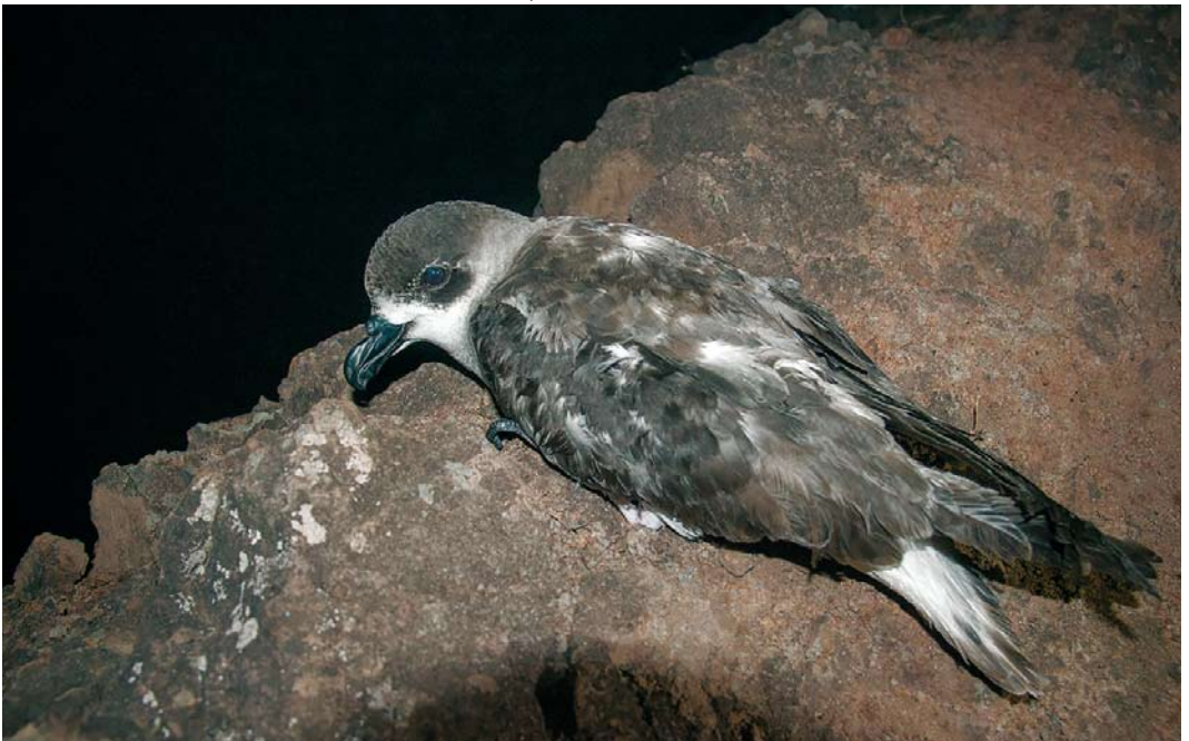
147 Black-capped Petrel / Zwartkapstormvogel Pterodroma hasitata , Santo Antão, Cape Verde Islands, 13 February 2018