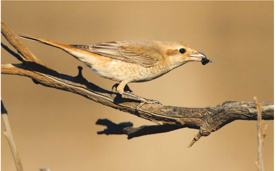
137 Daurian Shrike / Daurische Klauwier Lanius isabellinus , first-winter, Montaña de Taco, Buenavista del Norte, Tenerife, Canary Islands, 22 November 2017 (Beneharo Rodríguez)

nicuroides ) and the ear-covert patches were pale brown (darker grey-brown in phoenicuroides ). On the photographs, fine barring on the flanks is clearly visible, and being less prominent on the breast-sides. There are no photographs showing open wings but I did not notice a white or pale primary patch. The rump and the tail were completely rufous, with the central tail-feathers probably being a little darker. The bill was pale pinkish-brown and only the bill-tip was darker; the eyes were apparently all-black. The bird did not utter any sound.