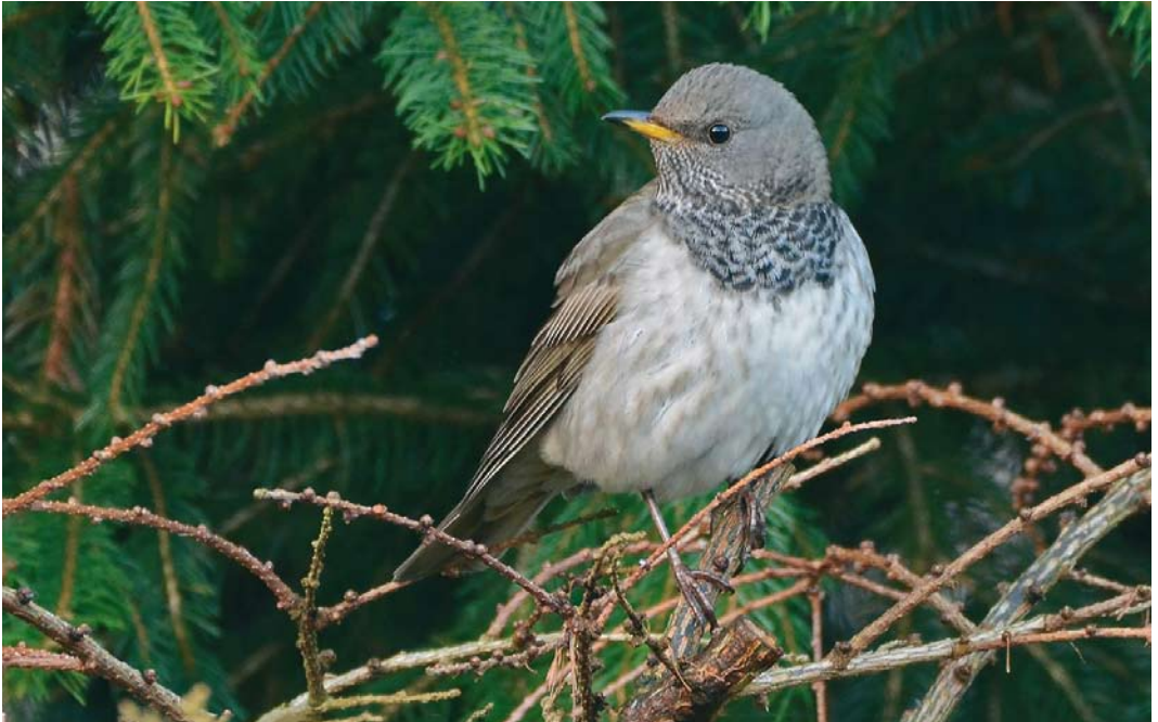
186 Zwartkeellijster / Black-throated Thrush Turdus atrogularis , adult mannetje, Scheemda, Groningen, 30 januari 2018 (John van der Graaf)