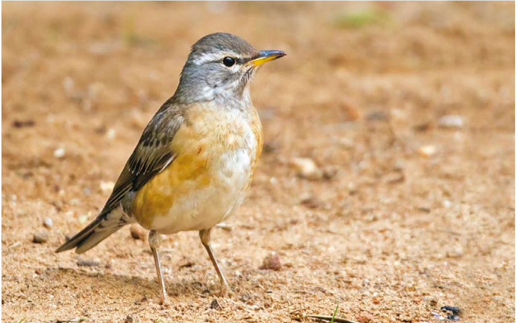
164 Eyebrowed Thrush / Vale Lijster Turdus obscurus , first-winter male, Cádiz, Andalusia, Spain, 24 February 2018 (Helen Commandeur)