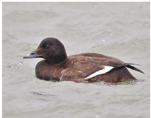
148 Cape Teal / Kaapse Taling Anas capensis , immature, Simar nature reserve, Malta, 28 January 2018 ( Raymond Galea ) 149 Yellow-billed Loon / Geelnavelduiker Gavia adamsii , first-winter, Olt, Ulmi, Romania, 19 January 2018 ( József Szabó ) cf Dutch Birding 40: 48, 2018 150 American White-winged Scoter / Amerikaanse Grote Zee-eend Melanitta deglandi deglandi , adult male, Kelfavík, Iceland, 20 February 2018 ( Marcin Solowiej ) 151 Asian White-winged Scoter / Aziatische Grote Zee-eend Melanitta deglandi stejnegeri , adult male, Vesterlyng, Sjælland, Denmark, 10 February 2018 ( Rasmus Strack ) 152 Black Scoter / Amerikaanse Zee-eend Melanitta americana , male, Schönberger Strand, Schleswig-Holstein, Germany, 5 February 2018 ( Ole Krome ) 153 American White-winged Scoter / Amerikaanse Grote Zee-eend Melanitta deglandi deglandi , first-winter male, Þorlákshöfn, Iceland, 25 February 2018 ( Alex Máni )