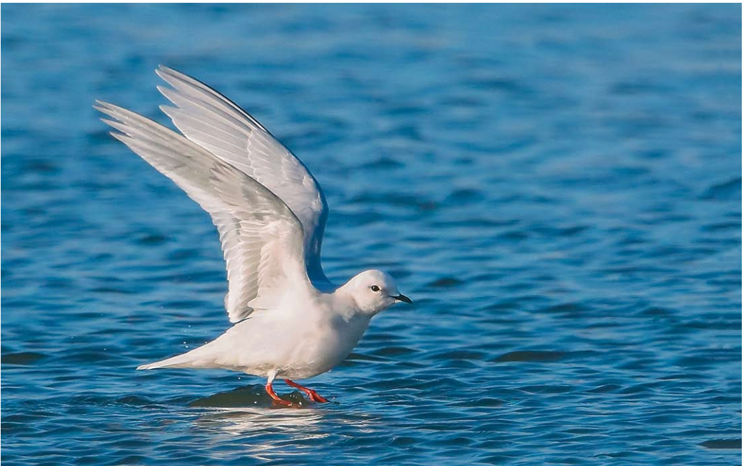
145 Ross's Gull / Ross' Meeuw Rhodostethia rosea , adult, Radipole Lake, Dorset, England, 25 February 2018 ( Tim White )