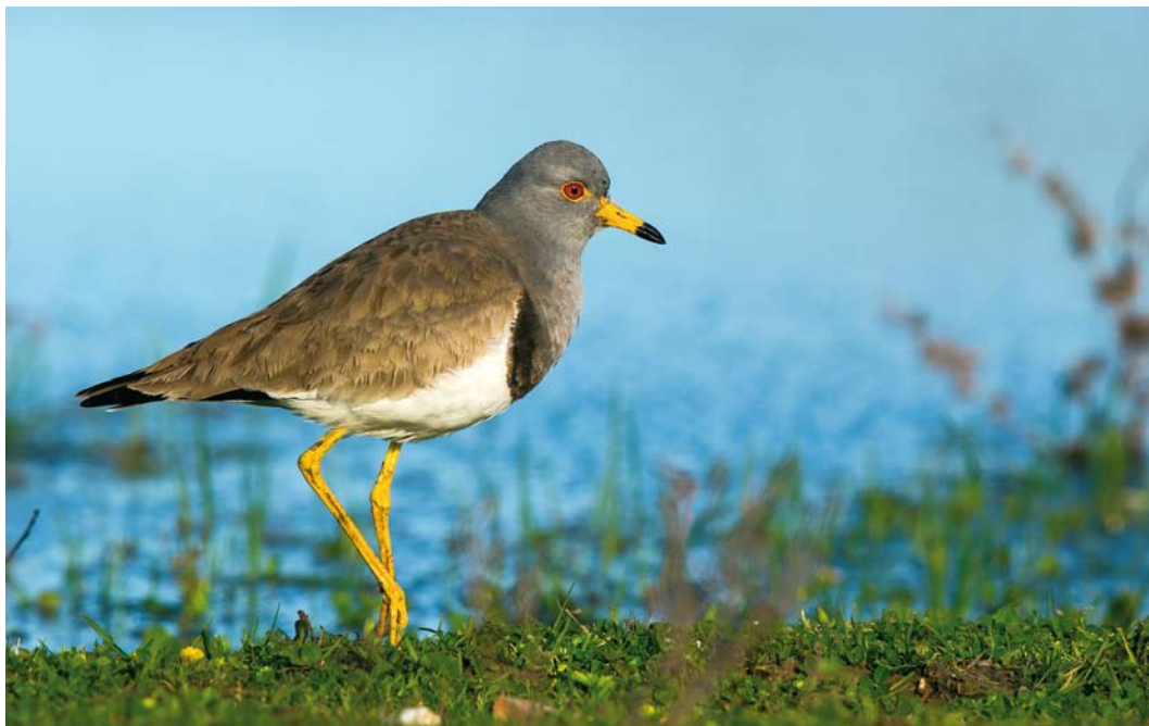
138 Grey-headed Lapwing / Grijskopkievit Vanellus cinereus , Kızılırmak delta, Turkey, 11 March 2018