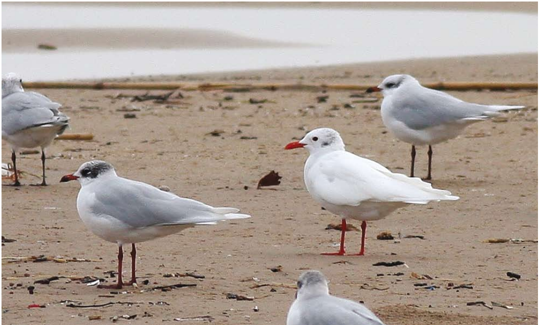
120 Mediterranean Gulls / Zwartkopmeeuwen Larus melanocephalus , Cambrils, Tarragona, Spain, 28 November 2014 (Joan Ferrer-Obiol). Possibly leucistic (or 'progressive grey') individual with normally coloured adults.

Several mixed pairs or cases of hybridization have been described for Mediterranean Gull, most often with Black-headed Gull Chroicocephalus ridibundus (Poprach et al 2006, Borghesi & Costa 2008). On the internet, photographs can be found of different hybrid individuals, in most cases adults, but also of a first-summer (second calendar-year) ( http://tinyurl.com/y7gr4sun ). The latter individual exhibited intermediate traits such as the shape of the hood and the wing pattern, with other traits more characteristic of either of the two species. For instance, the jet black head and contrasting white eye-crescents recalled Mediterranean but the fine bill resembled that of Black-headed more.