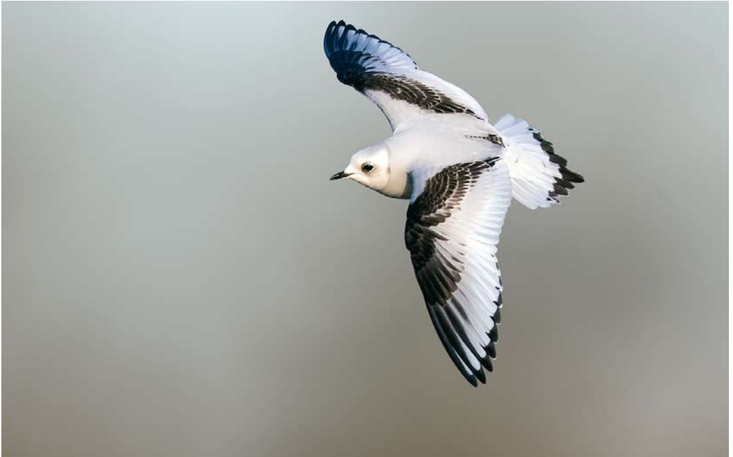
172 Ross' Meeuw / Ross's Gull Rhodostethia rosea , eerste-winter, Vlissingen, Zeeland, 30 januari 2018