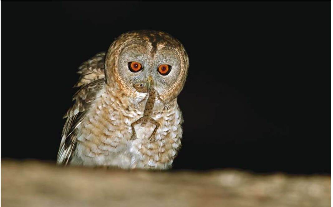
104 Desert Owl / Palestijnse Bosuil Strix hadorami , Wadi el Gemal, Egypt, 8 February 2017. Wedding gift presented by male.