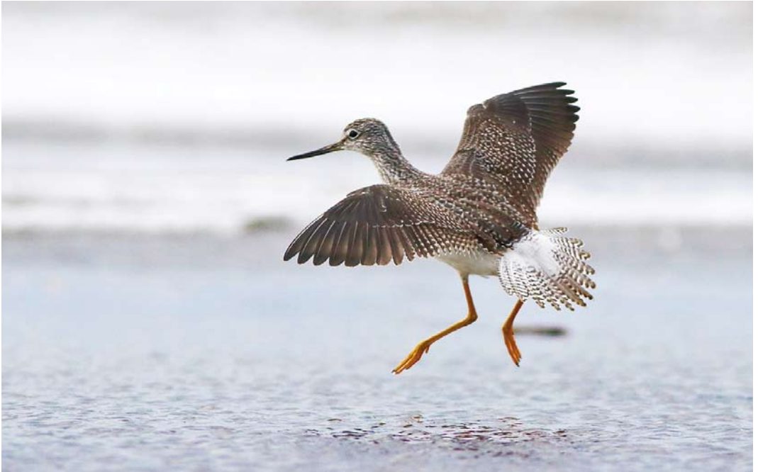
142 Greater Yellowlegs / Grote Geelpootruiter Tringa melanoleuca , first-winter, Björkäng, Halland, Sweden, 10 February 2018