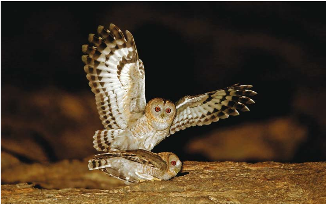
105 Desert Owls / Palestijnse Bosuilen Strix hadorami , Wadi el Gemal, Egypt, 10 February 2017 (Torsten Pröhl). Mating during night time.