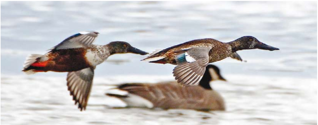
91 Northern Shoveler / Slobeend Anas clypeata , male in transitional plumage, South Platte river, Denver, Colorado, USA, 9 February 2013 (Steven G Mlodinow) 92 Northern Shoveler / Slobeend Anas clypeata , male, Noordwijkerhout, Zuid-Holland, Netherlands, 4 November 2015 (Maud H Mommers) 93 Northern Shovelers / Slobeenden Anas clypeata , males in transitional plumage, Frederick, Weld County, Colorado, USA, 23 December 2012 (Steven G Mlodinow). Northern Shovelers regularly show white facial feathering, often speckled and reaching onto chin, as in right bird.

only involve Northern Shoveler but also exotic shoveler species kept in captivity in Europe (Red Shoveler and Australasian Shoveler, perhaps also Cape Shoveler A smithii ). If escaped birds survive, they potentially mingle with their northern hemisphere relatives. Below, we focus on four shoveler hybrids that show a facial crescent: Australasian x Northern Shoveler, Red x Northern Shoveler, Northern Shoveler x Cinnamon Teal and Northern Shoveler x Blue-winged Teal.