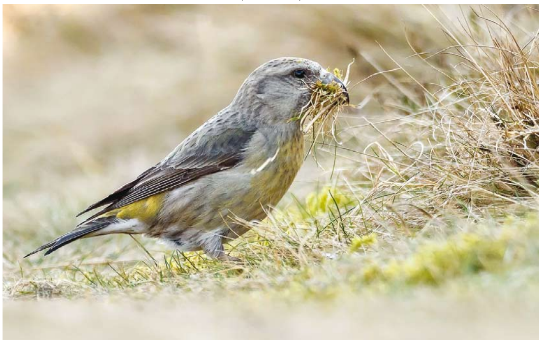
189 Grote Kruisbek / Parrot Crossbill Loxia pytyopsittacus , vrouwtje, Heidestein, Zeist, Utrecht, 24 februari 2018 (Michel Kars)