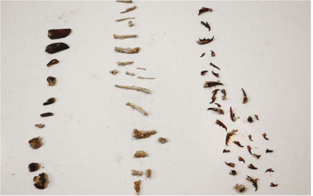
108-109 Prey remains in pellets of Desert Owl / Palestijnse Bosuil Strix hadorami (Mohamed I Habib)