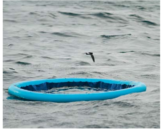
115 Wilson's Storm Petrel / Wilsons Stormvogeltje Oceanites oceanicus inspecting 'chum pool', Bay of Biscay, c 220 km off Saint-Gilles-Croix-de-Vie, Vendée, France, 7 August 2017

than cod liver). The third most important ingredient was probably DMS. This chemical compound is naturally produced by phytoplankton and is used by tubenoses as an olfactory clue to locate small animals feeding on the phytoplankton (Nevitt & Bonadonna 2005). DMS is both extremely smelly and volatile, and thus probably contributed to the long-range attraction of seabirds. Beware that DMS is highly flammable and irritating to eyes and skin and harmful when swallowed (and has an unpleasant odor at even extremely low concentrations).