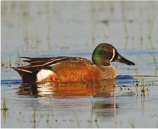
100 Hybrid Northern Shoveler x Blue-winged Teal / hybride Slobeend x Blauwvleugeltaling Anas clypeata discors , male, Montezuma National Wildlife Refuge, New York, USA, 9 May 2011 (Chris Wood). Individual showing rather dense patterning on breast and thin, pale neck-ring. Note also orange leg.

January 2018), there are 39 records of this hybrid type (compared with 17 of Northern Shoveler x Cinnamon Teal and well over 300 of Cinnamon x Blue-winged Teal); many of these have been photographically documented. Five of the North American Northern Shoveler x Blue-winged Teal records are from August-November and 28 are from March-May.