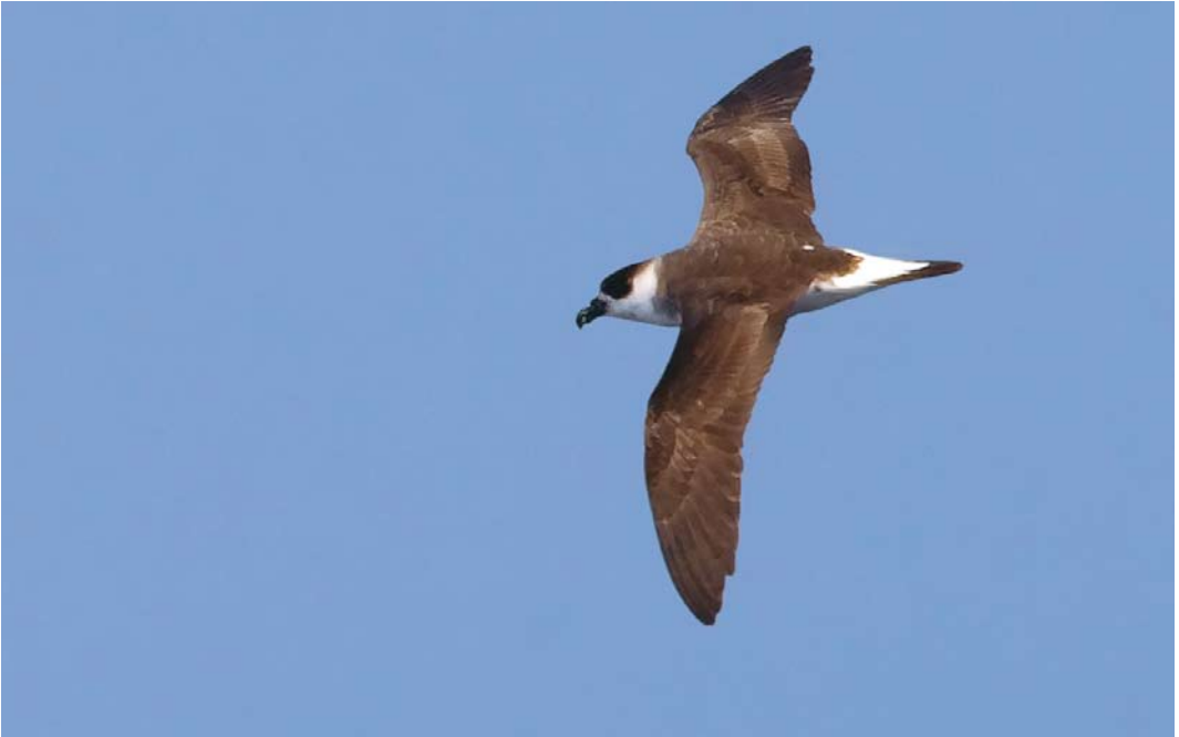
112 Black-capped Petrel / Zwartkapstormvogel Pterodroma hasitata , off Hatteras, USA, 21 May 2008