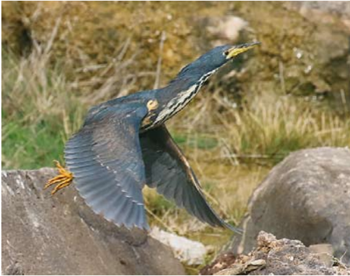
117 Dwarf Bittern / Afrikaanse Woudaap Ixobrychus sturmii , first-winter, Barranco de Río Cabras, Fuerteventura, Canary Islands, 3 December 2017 (Arne Torkler)