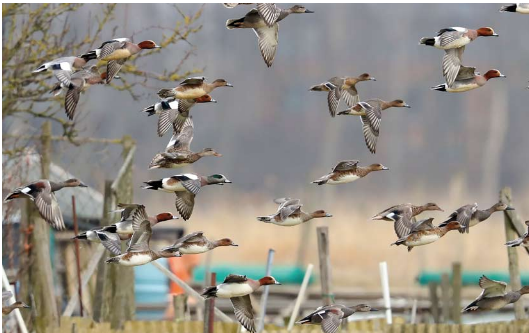
174 Amerikaanse Smient / American Wigeon Anas americana , adult mannetje, met Smienten / Eurasian Wigeons A penelope en Krakeenden / Gadwalls A strepera , Ruijgelaanse- en Zonneveldspolder, Wassenaar, Zuid-Holland, 1 maart 2018 ( René van Rossum ) 175 Koningseider / King Eider Somateria spectabilis , adult mannetje, Pollendam, Harlingen, Friesland, 14 februari 2018 ( Wim van Zwieten )