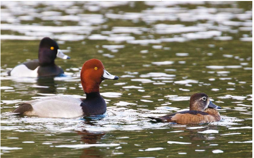
143 Redhead / Amerikaanse Tafeleend Aythya americana , male, with Ring-necked Ducks / Ringsnaveleenden A. collaris , male and female, Terceira, Azores, 17 February 2018