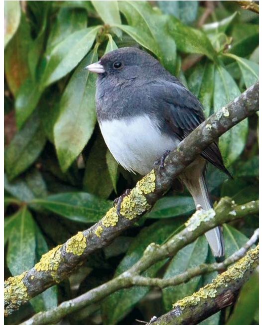
160 Greater Spotted Eagle / Bastaardarend Aquila clanga 'fulvescens' , immature, Kerkini lake, Greece, 5 February 2018 161 Dark-eyed Junco / Grijze Junco Junco hyemalis , Doornzele, Oost-Vlaanderen, Belgium, 20 March 2018 162 Siberian Crane / Siberische Witte Kraanvogel Grus leucogeranus , adult male ('Omid'), Fereydunkenar, Mazandaran, Iran, 1 February 2018 163 Taiga Merlin / Amerikaans Smelleken Falco columbarius columbarius , female or first-winter, Thurso, Highland, Scotland, 3 February 2018