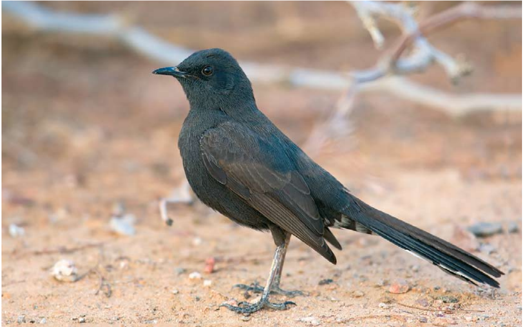
168 Black Scrub Robin / Zwarte Waaijerstaart Cercotrichas podobe , first-winter, Eilat, Israel, 2 March 2018 (Felix Timmermann)

Belgium, from at least 15 March. From January to mid-March, at least 13 Pine Buntings Emberiza leucocephalos were reported, including three in Germany, two in Greece and two in the Netherlands. A Common Reed Bunting E schoeniclus at Los Abrigos, Tenerife, on 28 January was (only) the fourth for the Canary Islands. Four Little Buntings E pusilla remained at Costa Calma, Fuerteventura, into March. A Rustic Bunting E rustica photographed at Sagres, Vila do Bispo, on 7 February was the third for Portugal.