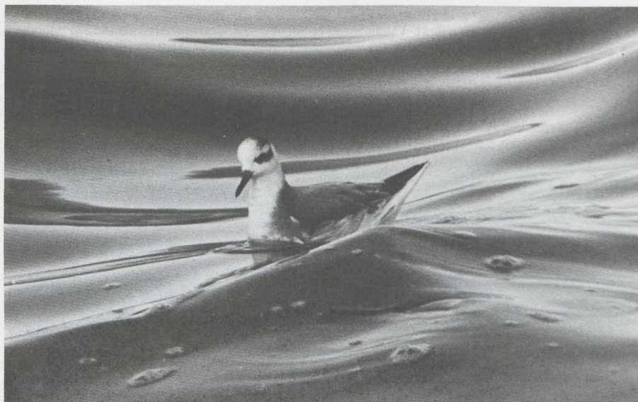
11-12. Grey Phalarope/Rosse Franjepoot Phalaropus fulicarius , IJmuiden (Noord-Holland), January 1981 ( Jan Mulder ); Iceland Gull/Kleine Burgemeester Larus glaucooides , second-winter bird, IJmuiden, January 1981 ( Hans Schouten )