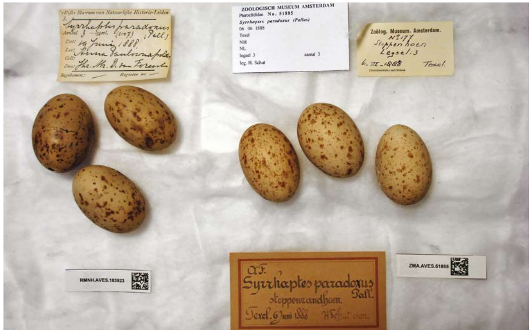
107 Legsels van Steppehoer / Pallas's Sandgrouse Syrnhaptes paradoxus (verzameld op Texel, Noord-Holland, op 6 juni 1888 (rechts) en te Anna-Paulownapolder, Noord-Holland, op 19 juni 1888), Naturalis Biodiversity Center, Leiden, Zuid-Holland, 13 november 2013