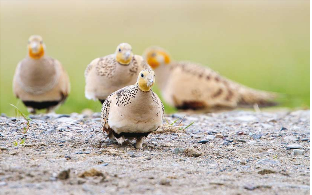
52 Pallas's Sandgrouse / Steppehoenders Syrrhaptes paradoxus , males (left and right) and females (centre), between Zaysan lake and Tarbagatai mountains, East Kazakhstan, Kazakhstan, 25 May 2014 (Ralph Martin)

June 1990; in Nord-Trøndelag, Norway, in July–November 1990; at Kuusamo, Finland, in June 1992; and at Askola, Lappeenranta, Finland, in July–August 2010 (Slack 2009; cf Dutch Birding 32: 336, 2010).