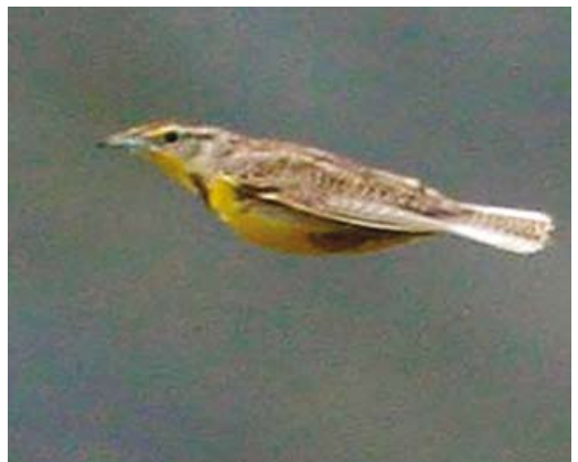
38-43 Western Meadowlark / Geelkaakweidespreeuw Sturnella neglecta , Provideniya, Chukotka, Russia, 2 July 2004 (Phil Palmer)