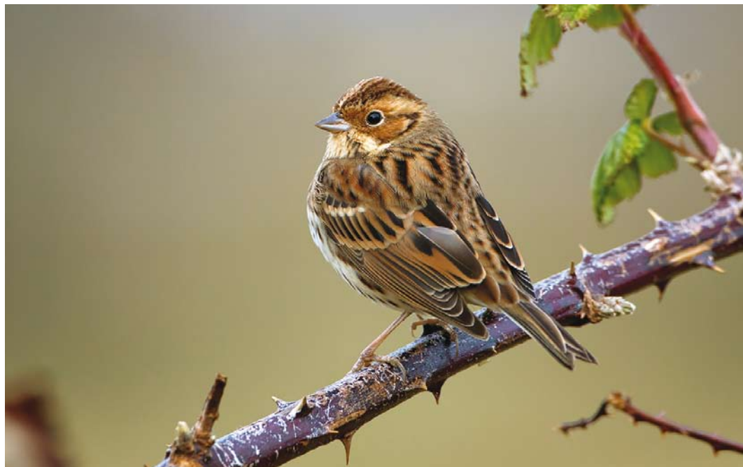
99 Dwerggorz / Little Bunting Emberiza pusilla , Noordwijk, Zuid-Holland, 7 december 2016 (Co van der Wardt)