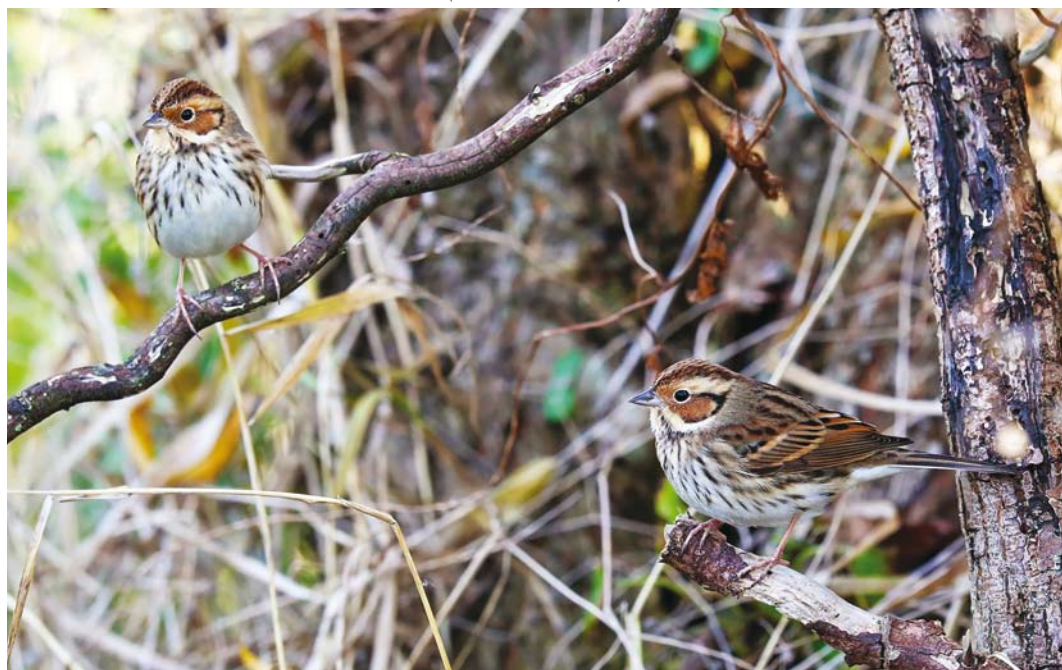
100 Dwerggorzen / Little Buntings Emberiza pusilla , Noordwijk, Zuid-Holland, 30 november 2016 (René van Rossum)