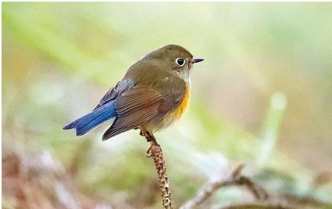
91 Blauwstaart / Red-flanked Bluetail Tarsiger cyanurus , eerstejaars, Berkheide, Zuid-Holland, 6 december 2016