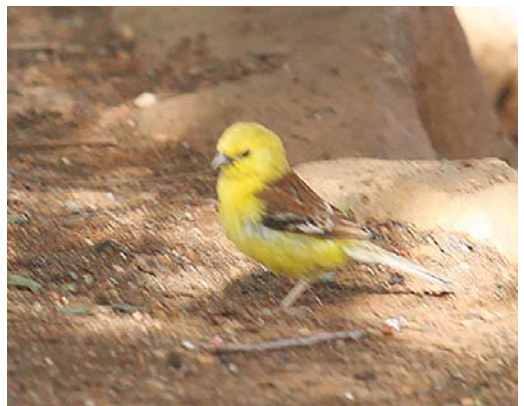
84 Pine Bunting / Witkopgors Emberiza leucocephalos , male, Widooie, Limburg, Belgium, 31 December 2016 85 Caspian Stonechat / Kaspische Roodborsttapuit Saxicola maurus hemprichii , Linosa, Italy, 25 November 2016 86 Pine Bunting / Witkopgors Emberiza leucocephalos , male, Pikrolimni lake, Thessaloniki, Greece, 6 January 2017 87 Dark-eyed Junco / Grijsze Junco Junco hyemalis , adult male, West Mersea, Essex, England, 8 December 2016 88 Basalt Wheatear / Basalttapuit Oenanthe lugens warriar , Ovda valley, Israel, 17 January 2017 89 Sudan Golden Sparrow / Bruinruggoudmus Passer luteus , male, Pajara, Fuerteventura, Canary Islands, 28 December 2016