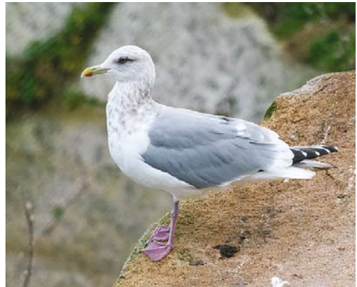
69 Steppe Grey Shrike / Steppeklapekster Lanius lahtora pallidirostris , first-year, Andarax river mouth, Almería, Andalucía, Spain, 30 November 2016 70 Steppe Grey Shrike / Steppeklapekster Lanius lahtora pallidirostris , first-year, Saline Joniche, Reggio Calabria, Italy, 22 December 2016 71 Franklin's Gull / Franklins Meeuw Larus pipixcan , adult, with Black-headed Gull / Kokmeeuw Chroicocephalus ridibundus , Mur de Lixhe, Liège, Belgium, 27 December 2016 72 Thayer's Gull / Thayers Meeuw Larus thayeri , adult, Lago, Xove, Lugo, Spain, 13 January 2017

first for Belarus. If accepted, a fourth-year Vega Gull L. vegae at Charny, Seine-et-Marne, on 17 November will be the first for France and the second for the WP (the first was in Ireland in January 2016; cf Dutch Birding 38: 104, 2016). A third-winter American Herring Gull L. smithsonianus was photographed at Portimão, Algarve, Portugal, on 4 December, while an adult returned to Sesimbra, Setúbal, where it was first observed in February 2014. In Spain, two returning adults were seen at Lires, Muxia, A Coruña, from 7 December, and at Ondarroa harbour, Bizkaia, from 23 December. A first-winter was reported at Couso, Ribeira, A Coruña, on 1 January. Also in Spain, the Thayer's Gull L. thayeri returned for its 10th winter to Lago, Xove, Lugo, on 13 January. An Iceland Gull L. glaucoides at Tallinn on 13 January was the second for Estonia. If accepted, a putative second-winter Slaty-backed Gull L. schistisagus at Gdańsk, Pomerania, on 2-3