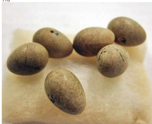
Friesland, zes eieren (T G de Vries; plaat 118). CDNA-beoordeelsoort tot 1992.

Graszanger / Zitting Cisticola Cisticola juncidis 1976 3 oktober, Dijkgat, Wieringermeer, Hollands Kroon , Noord-Holland, twee eieren die achterbleven nadat de drie jongen waren uitgevlogen; nest verzameld (L Zijlstra). CDNA-beoordeelsoort tot 1 januari 2000.