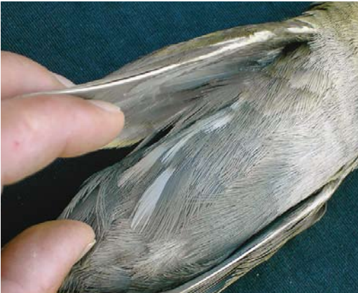
135-138 Lesser Moorhen / Afrikaans Waterhoen Paragallinula angulata , first-year (collected off Laxe, A Coruña, Spain, on 5 February 2000), Wildlife Recovery Center, Oleiros, A Coruña, 19 November 2006 (Pablo Pita Criado)

& Strand 2000) was first accepted but later rejected after review (considered Common Moorhen; Haas 2012). In the 'greater WP' (including Iran and the Arabian Peninsula), there are two records in Oman: two immatures at Hilf on 7-9 November 1991 and one at Salalah nature reserve on 1 October 2008 (Eriksen & Victor 2013). The vagrancy potential of the species is illustrated by a bird caught from a ship while swimming at sea near the archipelago of São Pedro and São Paulo, Brazil, on 10 January 2005 (Bencke et al 2005). This archipelago is a small and isolated group of rocky islets lying in the equatorial Atlantic Ocean c 960 km north-east of the coast of Rio Grande do Norte, Brazil, and 1824 km south-west of Guinea-Bissau, Africa.