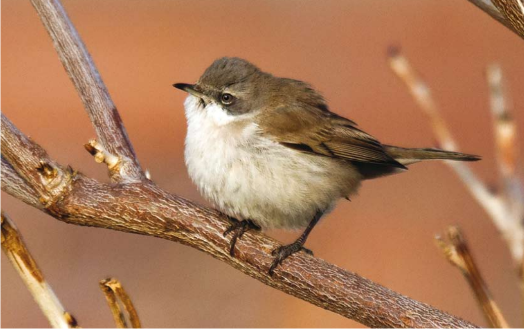
215 Vermoedelijke Siberische Braamsluiper / presumed Siberian Lesser Whitethroat Sylvia althaea blythi , Breda, Noord-Brabant, 20 januari 2017