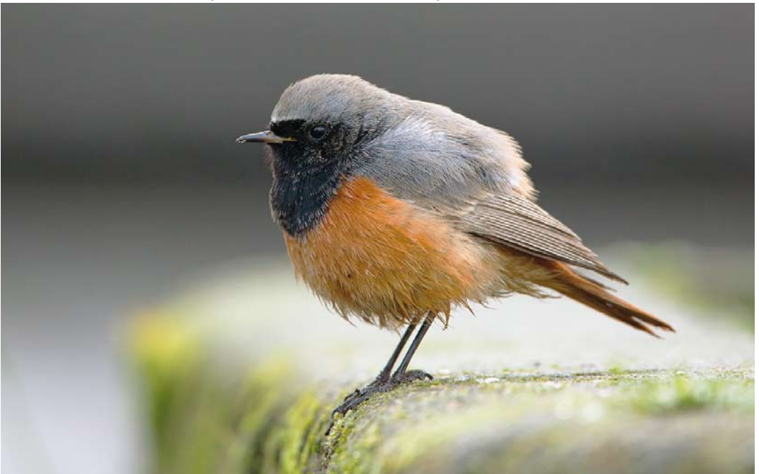
216 Oosterse Zwarte Roodstaart / Eastern Black Redstart Phoenicurus ochruros phoenicuroides , eerste-winter mannetje, Barendrecht, Zuid-Holland, 15 januari 2017 (Alex Bos)