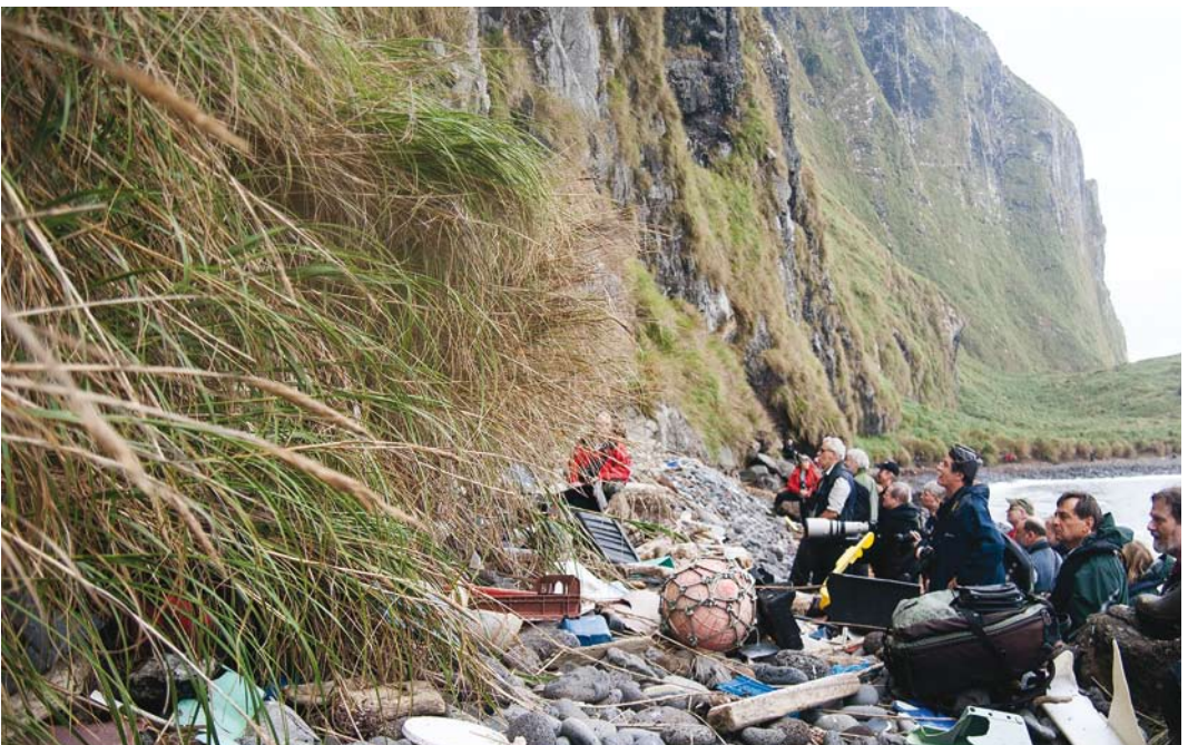
164 Waiting for Inaccessible Island Rail Atlantisia rogersi , Inaccessible Island, South Atlantic Ocean, 13 April 2011 ( Garry Bakker )