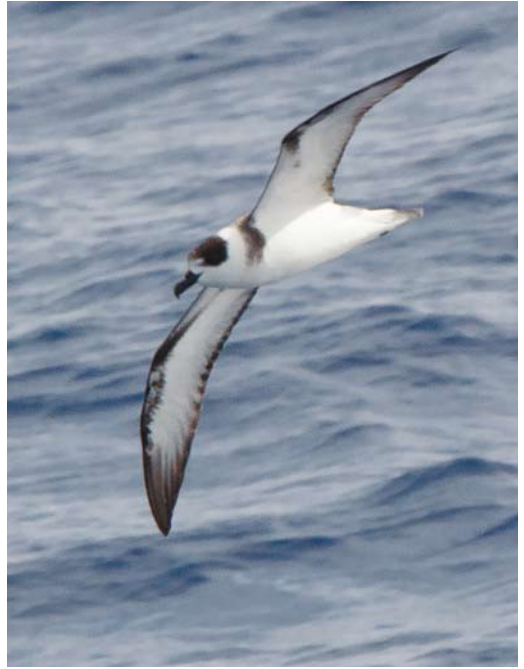
158 White-necked Petrel / Kermadecwitnekstormvogel Pterodroma cervicalis , off Tonga, Pacific Ocean, 7 April 2014 (Pierre M A van der Wielen) 159-161 White-necked Petrel / Kermadecwitnekstormvogel Pterodroma cervicalis , off Macauley, Kermadec Islands, New Zealand, 4 April 2014 (Pierre M A van der Wielen)