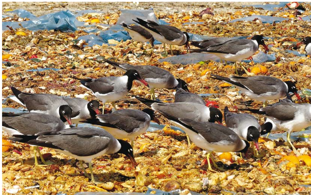
22 White-eyed Gulls / Witoogmeeuwen Larus leucophthalmus , adult summer, Hurghada, Egypt, 10 June 2014. Feeding at rubbish tip.