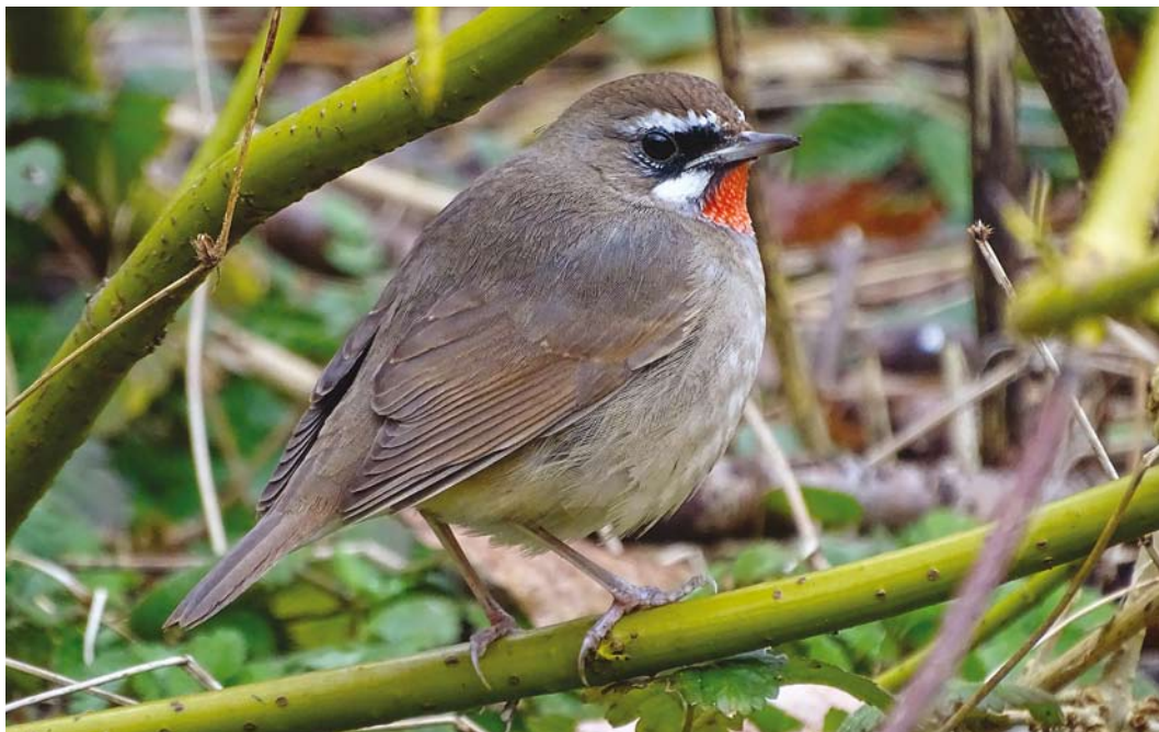
36 Roodkeelnachtegal / Siberian Rubythroat Calliope calliope , eerste-winter mannetje, Hoogwoud, Noord-Holland, 18 maart 2016