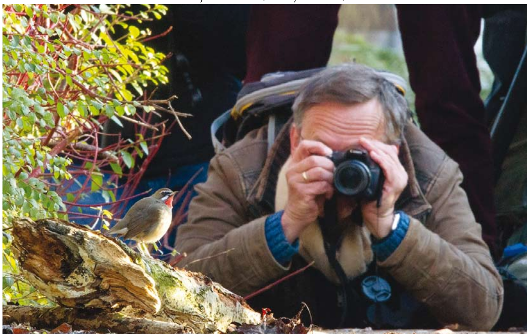
37 Roodkeelnachtegal / Siberian Rubythroat Calliope calliope , eerste-winter mannetje, Hoogwoud, Noord-Holland, 22 januari 2016 (Harvey van Diek)