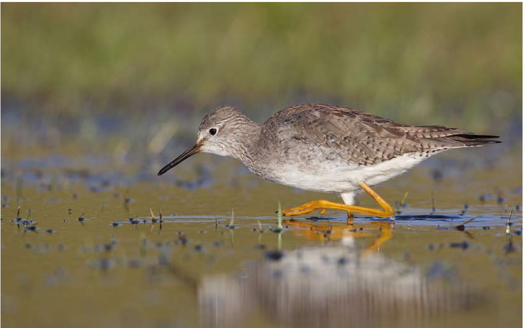
648 Lesser Yellowlegs / Kleine Geelpootruiter Tringa flavipes , Schokland, Flevoland, 27 February 2015 (Martin van der Schalk)