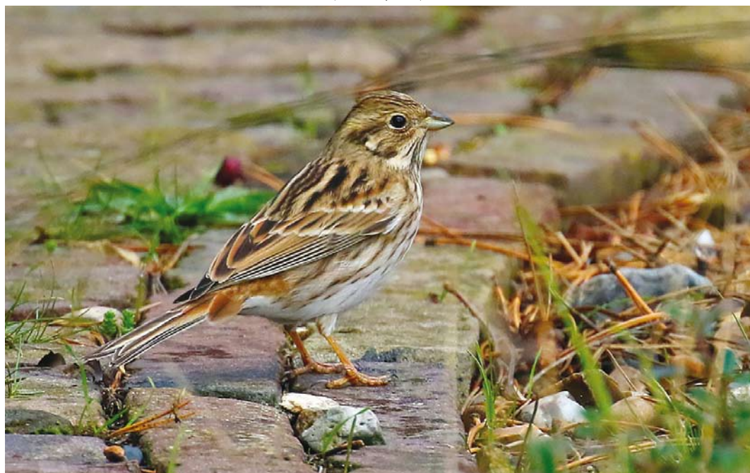
734 Witkopgors / Pine Bunting Emberiza leucocephalos , Oost-Vlieland, Vlieland, Friesland, 21 oktober 2016 (Wietze Janse)