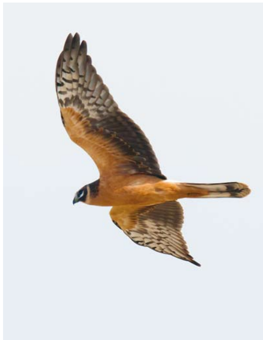
720 Kuifaalscholver / European Shag Phalacrocorax aristotelis , juveniel, Nijmegen, Gelderland, 30 oktober 2016 (Alex Bos) 721 Steppiekiekendief / Pallid Harrier Circus macrourus , juveniel, Maasvlakte, Zuid-Holland, 20 september 2016 (Arnaud B van den Berg) 722 Oosterse Tortel / Oriental Turtle Dove Streptopelia orientalis , eerstejaars, Kroonspolders, Vlieland, Friesland, 30 oktober 2016 (Frank Majoor)