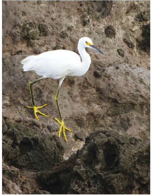
677 Levant Sparrowhawk / Balkansperwer Accipiter brevipes , juvenile, Buskett, Malta, 27 September 2016 678 Snowy Egret / Amerikaanse Kleine Zilverreiger Egretta thula , Santa Cruz da Flores, Flores, Azores, 19 October 2016 679 Thick-billed Murre / Kortbekzeekoet Uria lomvia , Anstruther, Fife, Scotland, 26 September 2016