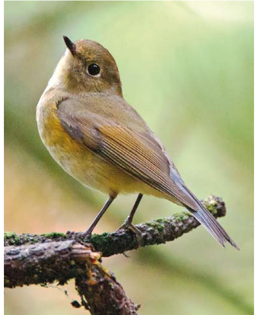
738 Blauwstaart / Red-flanked Bluetail Tarsiger cyanurus , Staatsbossen, De Koog, Texel, Noord-Holland, 15 oktober 2016 (Harvey van Diek)

bij Groesbeek, Gelderland. Daarnaast werden vogels waargenomen van 12 tot 26 september in de Engbertsdijkvenen, Overijssel; op 20 september bij Castelree, Noord-Brabant; en op 1 oktober bij Ridderkerk, Zuid-Holland.