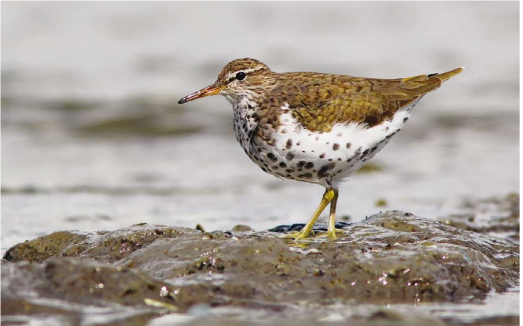
647 Spotted Sandpiper / Amerikaanse Oeverloper Actitis macularia , second calendar-year, Medemblik, Noord-Holland, 28 April 2015 (Rob Half) )