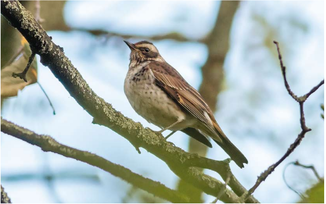
742-743 Vermoedelijke Bruine Lijster / presumed Dusky Thrush Turdus eunomus , eerstejaars vrouwtje, Beijum, Groningen, Groningen, 8 november 2016 (Jos Welbedacht)