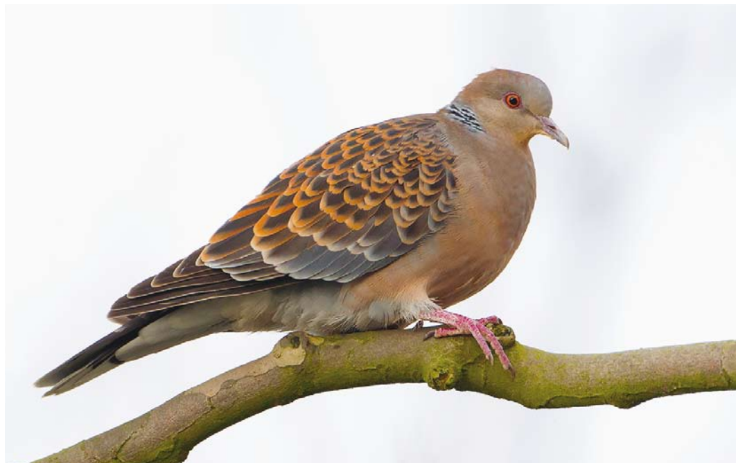
644 Oriental Turtle Dove / Oosterse Tortel Streptopelia orientalis , Vlaardingen, Zuid-Holland, 5 January 2015 (Co van der Wardt) 645 Pallid Swift / Vale Gierzwaluw Apud pallidus , first-year, IJmuiden, Noord-Holland, 8 November 2015 (Jan den Hertog) 646 Great Snipe / Poelsnip Callinago media , Broekhuizen, Limburg, 25 April 2015 (Mariet Verbeek)