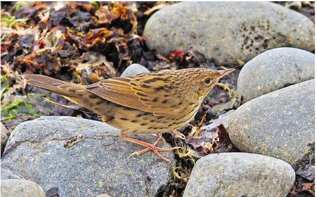
714 Lanceolated Warbler / Kleine Sprinkhaanzanger Locustella lanceolata , Famjin, Suðuroy, Faeroes, 1 October 2016 (Silas Olofson)