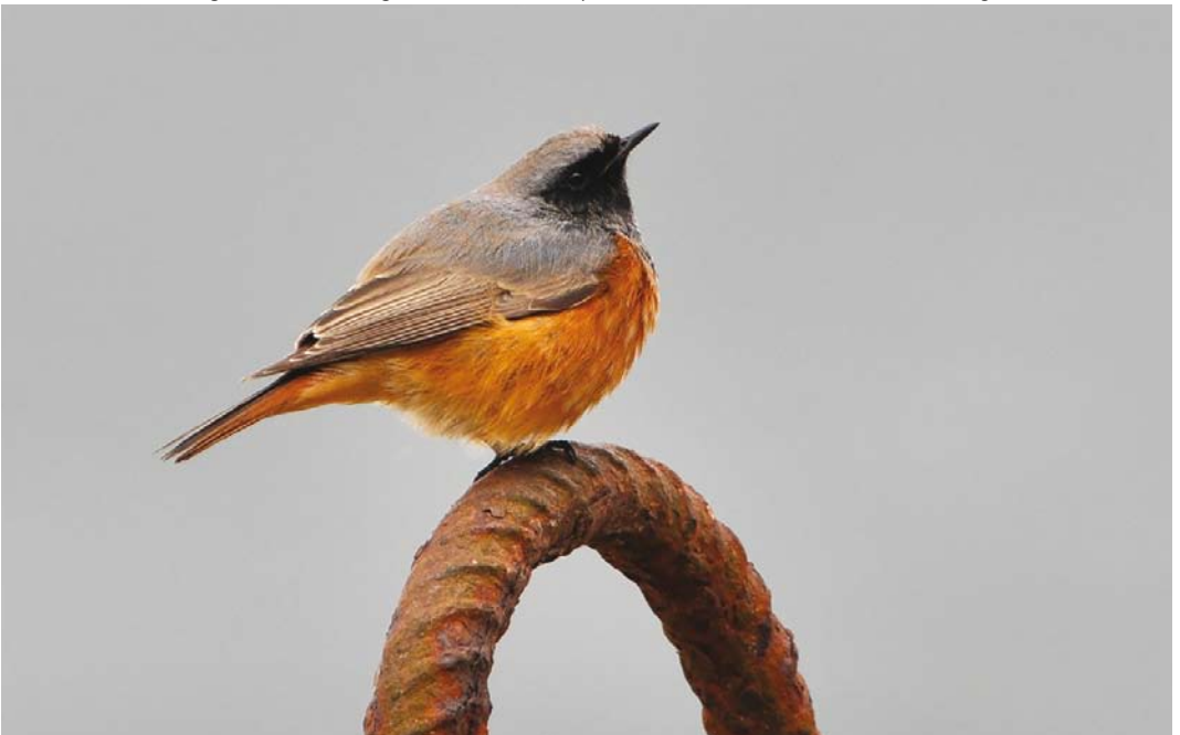
710 Eastern Black Redstart / Oosterse Zwarte Roodstaart Phoenicurus ochruros phoenicuroides , first-winter male, Helgoland, Schleswig-Holstein, Germany, 6 November 2016