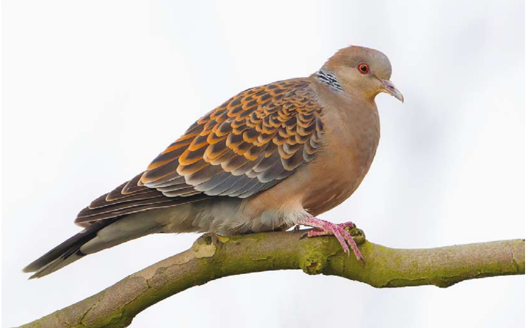
644 Oriental Turtle Dove / Oosterse Tortel Streptopelia orientalis , Vlaardingen, Zuid-Holland, 5 January 2015 645 Pallid Swift / Vale Gierzwaluw Apud pallidus , first-year, IJmuiden, Noord-Holland, 8 November 2015 646 Great Snipe / Poelsnip Callinago media , Broekhuizen, Limburg, 25 April 2015