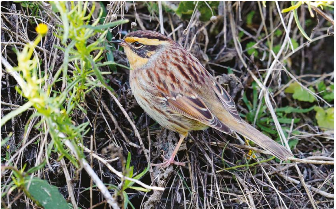
741 Bergheggenmus / Siberian Accentor Prunella montanella , Maasvlakte, Zuid-Holland, 21 oktober 2016