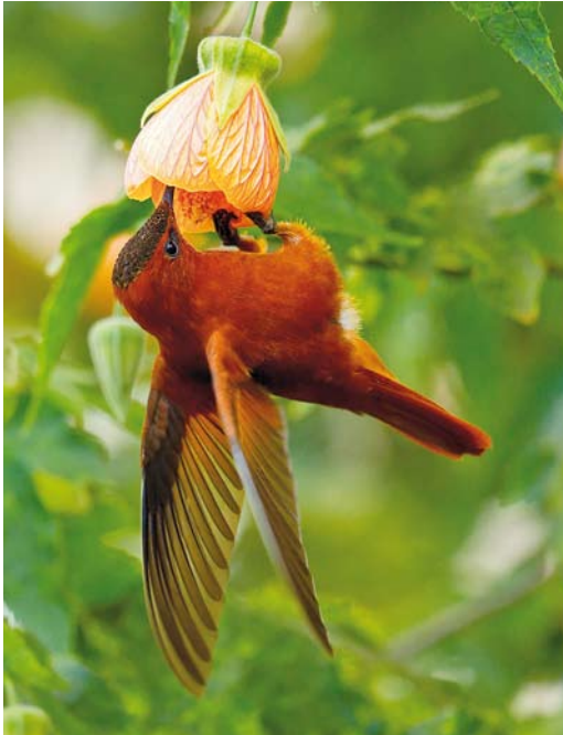
3 Juan Fernández Firecrown / Juan-Fernándezkolibri Sephanooides fernandensis , male, Robinson Crusoe Island, Chile, 7 March 2013. Typical hanging upside-down feeding behaviour.