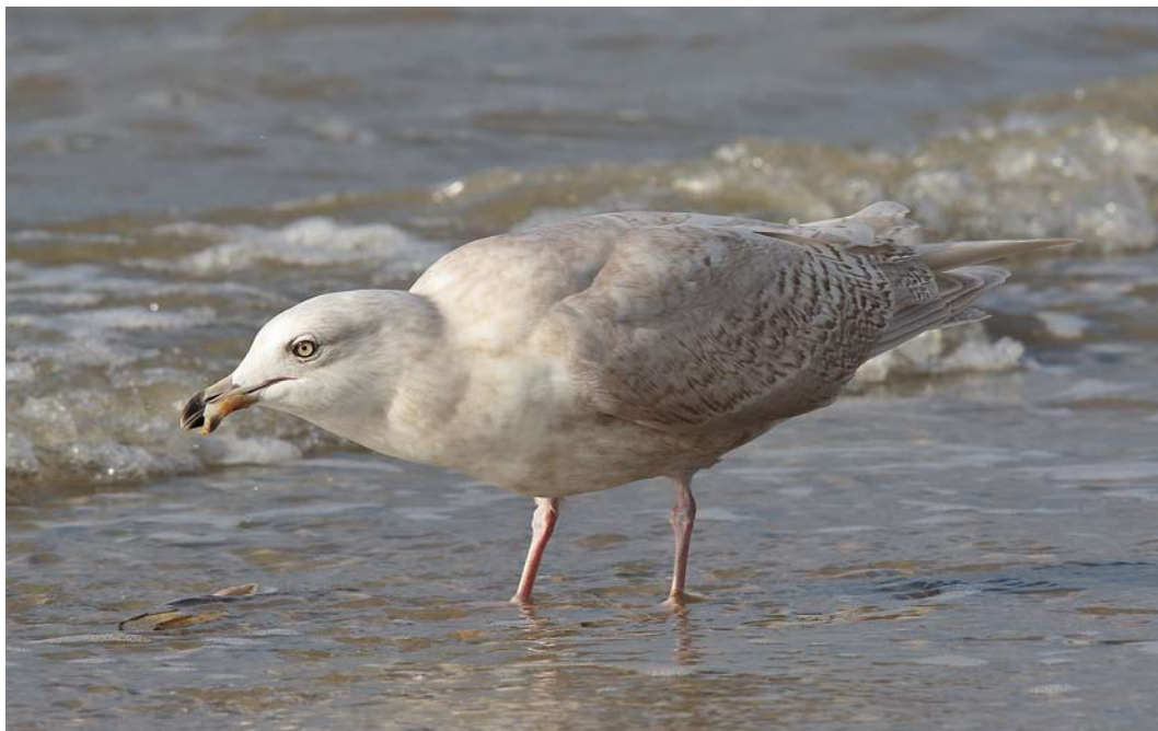
84 Kleine Burgemeester / Iceland Gull Larus glaucoides , tweede-winter, IJmuiden, Noord-Holland, 9 november 2014 ( Eric Menkveld )