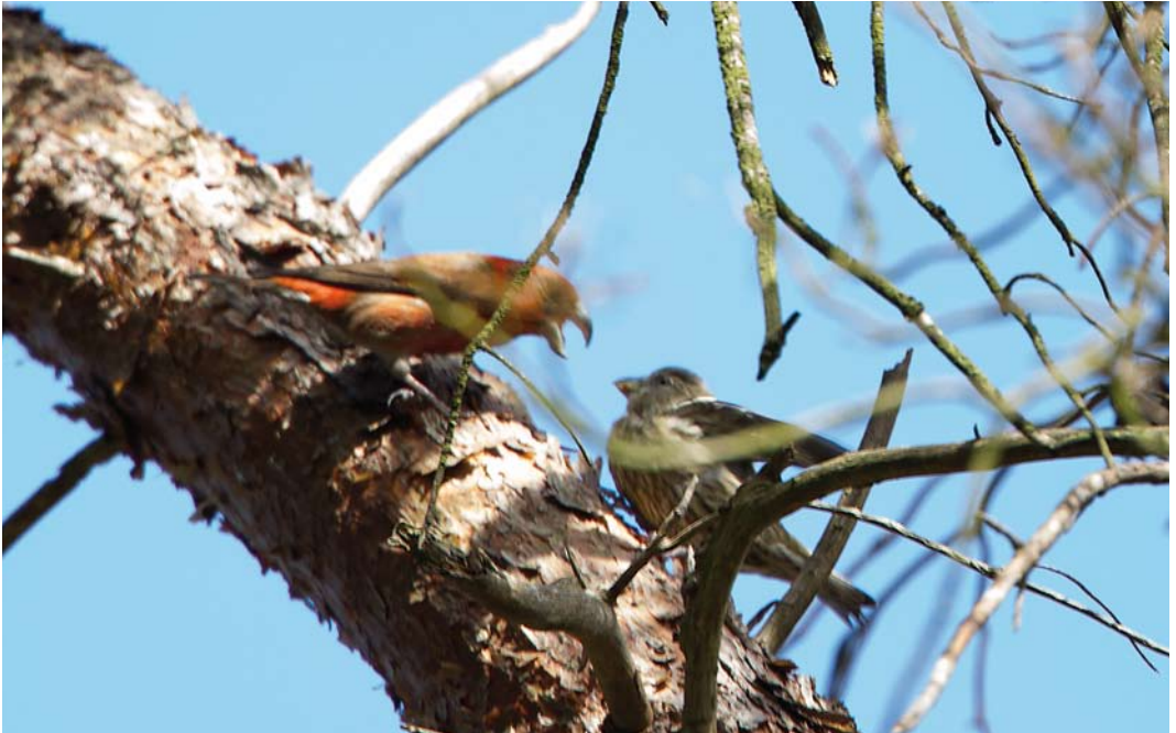
36 Grote Kruisbekken / Parrot Crossbills Loxia pytyopsittacus , mannetje en juveniel, Otterlosche Zand, Gelderland, 17 april 2014 (Alex Bos)