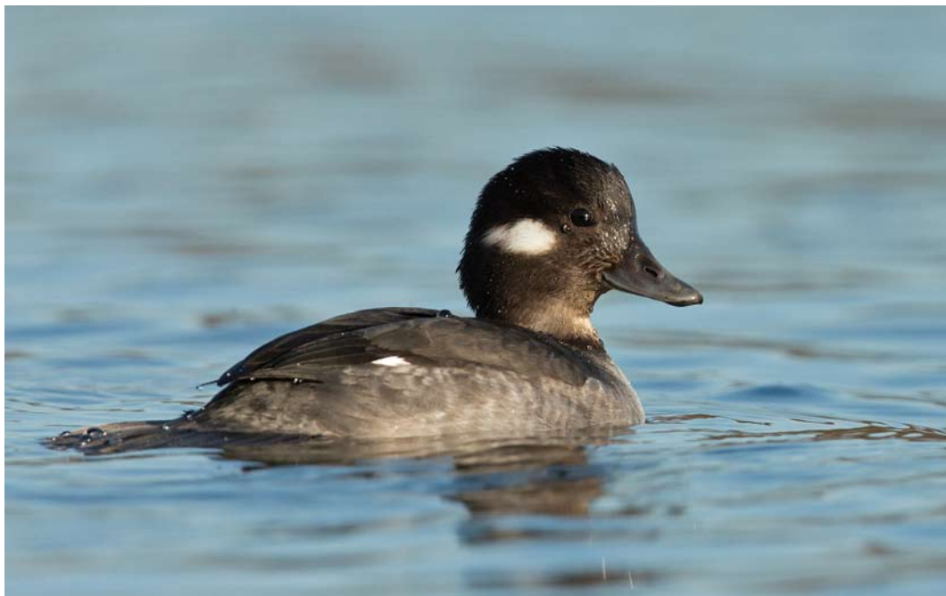
79 Buffelkopeend / Bufflehead Bucephala albeola , eerstejaars vrouwtje, WML-plas, Heel, Limburg, 1 januari 2015 (Rans Schols)