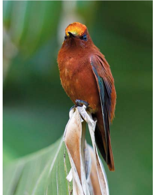
4 Juan Fernández Firecrown / Juan-Fernándezkolibri Sephanooides fernandensis, male, Robinson Crusoe Island, Chile, 7 March 2013.

Masafuera is one of the most important sites for breeding petrels in the eastern Pacific and, despite being a World Heritage Site, we have little hope for the two endemic petrels without eradication of the introduced fauna (rats, mice, cats and goats) from the island. Furthermore, permanent or regular monitoring of the populations is lacking.