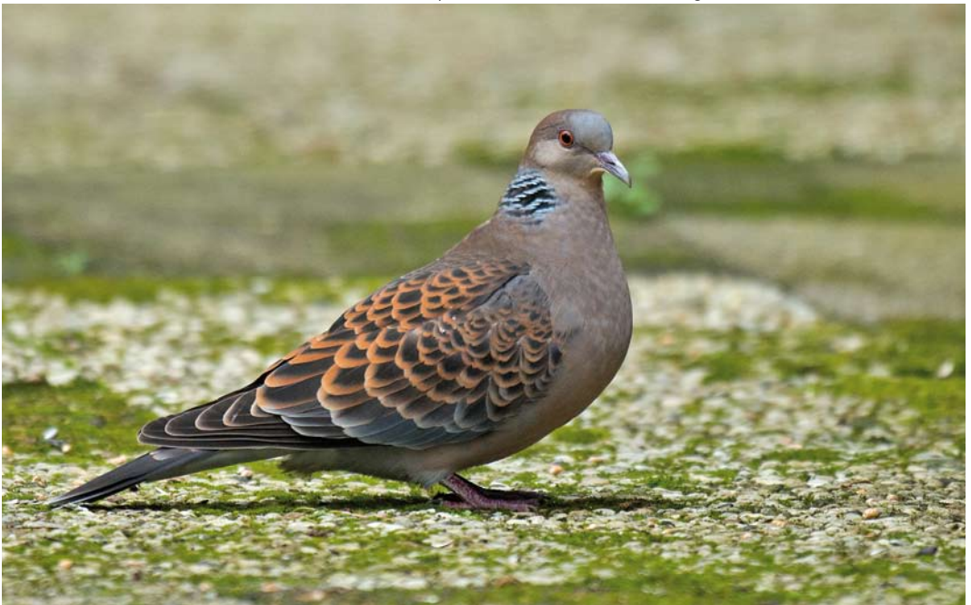
50 Oriental Turtle Dove / Oosterse Tortel Streptopelia orientalis , first-winter, Vlaardingen, Zuid-Holland, Netherlands, 5 January 2015 (Arnoud B van den Berg)