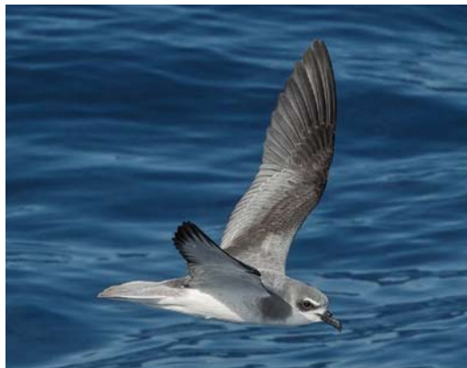
27 De Filippi's Petrel / Juan-Fernándezstormvogel Pterodroma defilippiana, 'en route' to Juan Fernández Archipelago, Chile, 15 March 2013. Winter breeder that we did not expect to see in such large numbers as we did in March, raising questions about their origin. 28 De Filippi's Petrel / Juan-Fernándezstormvogel Pterodroma defilippiana, between Robinson Crusoe Island and Masafuera, Chile, 8 March 2013

direction of position CH-9, 10 and 11 (see figure 1), where there was the impression of a corridor flight-path.