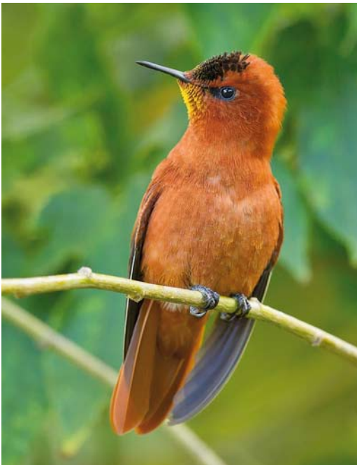
5 Juan Fernández Firecrown / Juan-Fernándezkolibrie Sephanoides fernandensis , male, Robinson Crusoe Island, Chile, 7 March 2013 ( Hadoram Shirihai /© Tubenoses Project ) 6 Juan Fernández Firecrown / Juan-Fernándezkolibrie Sephanoides fernandensis , female, Robinson Crusoe Island, Chile, 7 March 2013 ( Hadoram Shirihai /© Tubenoses Project ). Note that high degree of sexual dimorphism, although with still distinctly attractive and colorful female plumage in its own way, is reason why this species was initially mistakenly described as two species!

Juan Fernandez Firecrown shows extreme sexual dimorphism, which even resulted in both sexes being described as separate species (Colwell 1989, Roy et al 1998). The species shares or competes for resources with the non-endemic Green-backed Firecrown S sephaniodes that is a relative newcomer to the islands (Colwell 1989, Roy et al 1998). Both species compete mainly for the nectar of introduced species like Abutilon or Eucalyptus which abound in the surroundings of the village. Although the flowers of at least 12 endemic plant species are equally suitable, most of these, like Dendroseris litoralis , Raphithamnus venustus and Sophora fernandeziana , are now endangered (Colwell 1989).