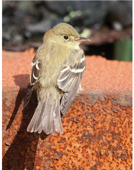
546 Acadian Flycatcher / Beukenfeetiran Empidonax virescens , first-calendar year, Dungeness, Kent, England, 22 September 2015 547-548 Acadian Flycatcher / Beukenfeetiran Empidonax virescens , first-calendar year, Dungeness, Kent, England, 22 September 2015