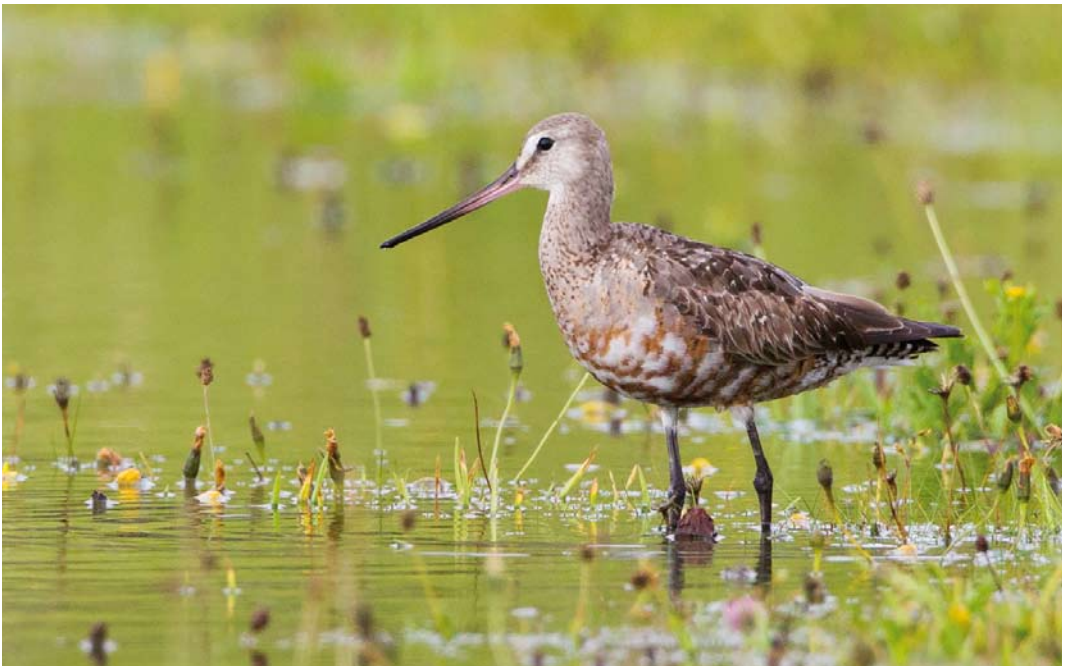
525 Hudsonian Godwit / Rode Grutto Limosa haemastica , adult, Inismor, Galway, Ireland, 17 September 2015