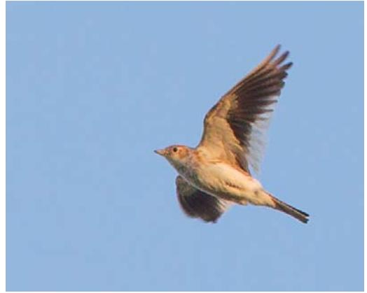
505 Demoiselle Cranes / Jufferkraanvogels Grus virgo , south-east of Podolsk, Orenburg Oblast, Russia, 19 June 2015 (Rami Mizrahi) 506 White-winged Lark / Witvleugelleeuwierik Alauda leucoptera , in display, near Gaynulino, north-west of Orsk, Orenburg Oblast, Russia, 17 June 2014 (David Monticelli)

strong candidate for future split due to reduced intergradation with the western group in contact zones in the southern Ural range and in the lower basins of the Kama and Vyatka rivers (Red'kin & Konovalova 2006). This is supported by markedly different mitochondrial and nuclear genomes of the eastern and western groups (Hung et al 2012). Their voice was not audibly different from European birds but detailed analysis would be needed. Some nuthatches seen around Yekaterinburg did not look so obviously different from European birds but they were not photographed, inviting better scrutiny of the nuthatches there.