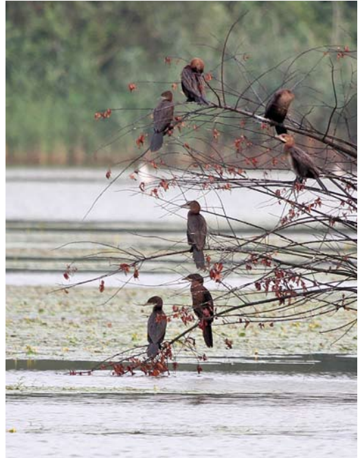
534 Black-winged Kite / Grijze Wouw Elanus caeruleus , juvenile, Maashorst, Noord-Brabant, Netherlands, 4 August 2015 ( Michel Veldt ) 535 Pygmy Cormorants / Dwergaalscholwers Phalacrocorax pygmeus , Spytkowice, Małopolska, Poland, 14 August 2015 ( Paweł Malczyk ) 536 Wilson's Phalarope / Grote Franjepoot Phalaropus tricolor , first-winter, with Pectoral Sandpiper / Gestreepte Strandloper Calidris melanotos , Goulven, Bretagne, France, 12 September 2015 ( Valentin Condal )