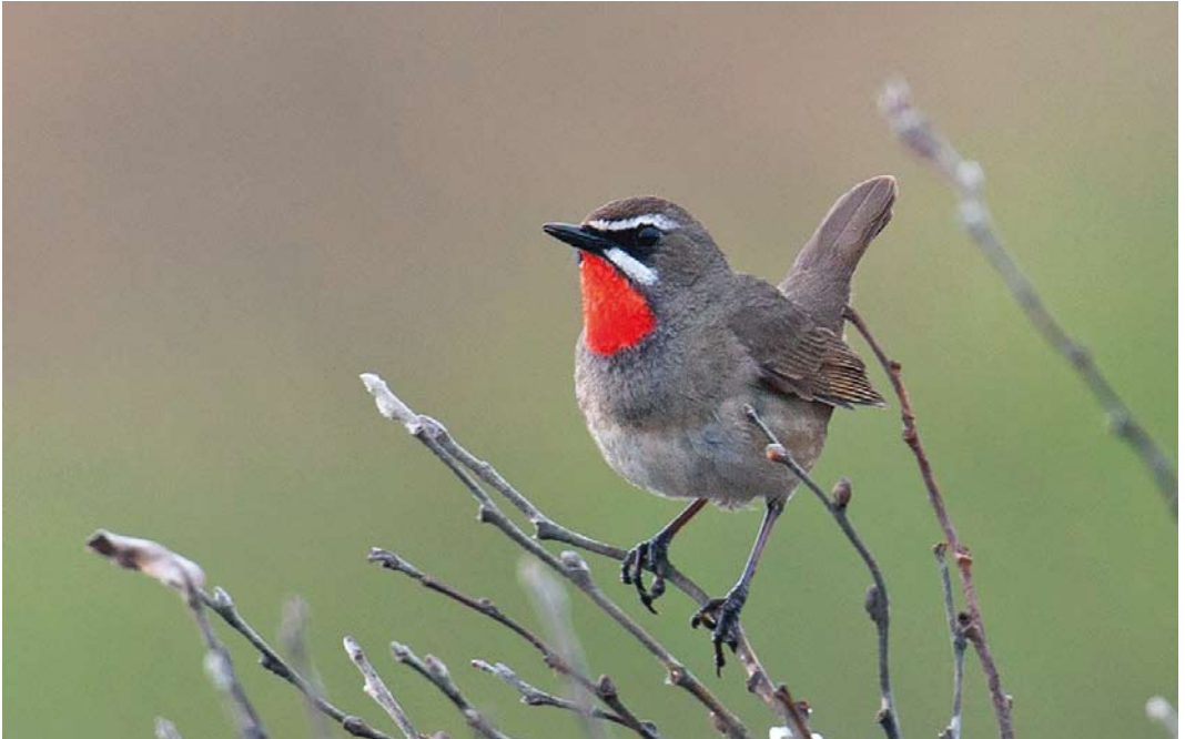
492 Siberian Rubythroat / Roodkeelnachtegaal Calliope calliope , male, mount Kvarkush, west of Severouralsk, Ural mountains, Russia, 18 June 2015 ( Felix Timmermann )