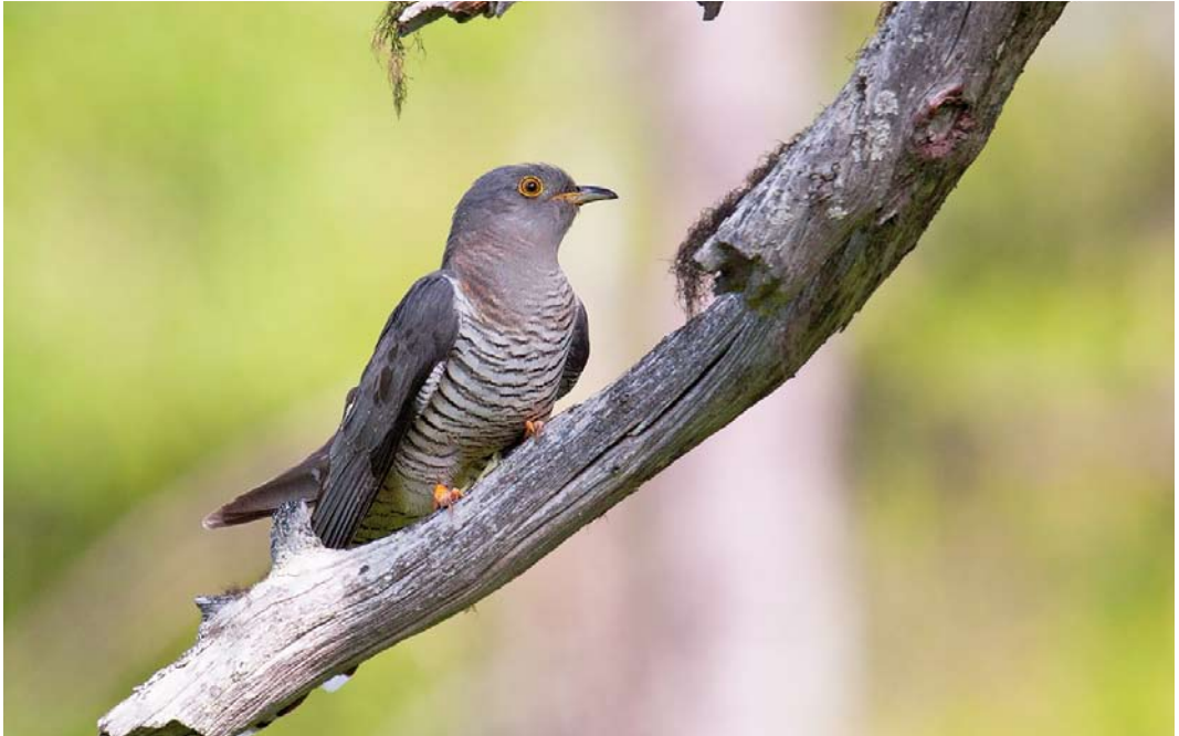
491 Oriental Cuckoo / Boskoekoek Cuculus optatus , Ural ridge west of Severouralsk, Ural mountains, Russia, 20 June 2015

Ural ridge and also at Kvar Kush; males were usually audible from our campsites at both locations.