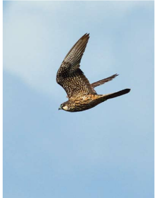
540 Eleonora's Falcon / Eleonora's Valk Falco eleonora , second calendar-year, Skagen, Nordjylland, Denmark, 15 September 2015 ( Niels Evald Jensen )

800 pairs in Slovakia and 40 pairs in Hungary (Slovak Raptor Journal 9, 2015). In the Biebrza valley, Poland, the proportion of pairs producing hybrids Greater Spotted x Lesser Spotted Eagle A clanga x pomarina increased by over 30% between 1996 and 2012. The percentage of territories occupied by pure Greater Spotted pairs had declined by 50% at the end of this period. The increasing number of mixed pairs correlated very significantly with the decreasing number of pairs of Greater Spotted, but weakly with the numbers of the more common Lesser Spotted. Mate replacement was frequently recorded, and favoured Lesser Spotted or hybrids (Acta Ornithol 50: 33-41, 2015, cf Dutch Birding 32: 384-397, 2010). In France, a subadult Spanish Imperial Eagle A adalberti was seen at Laroque-de-Fa, Aude, on 13 July and a second-year at Eyne, Pyrénées-Orientales, on 27 July. In June-July, 11 breeding pairs of Pallid Harrier Circus macrourus were found in Finland.