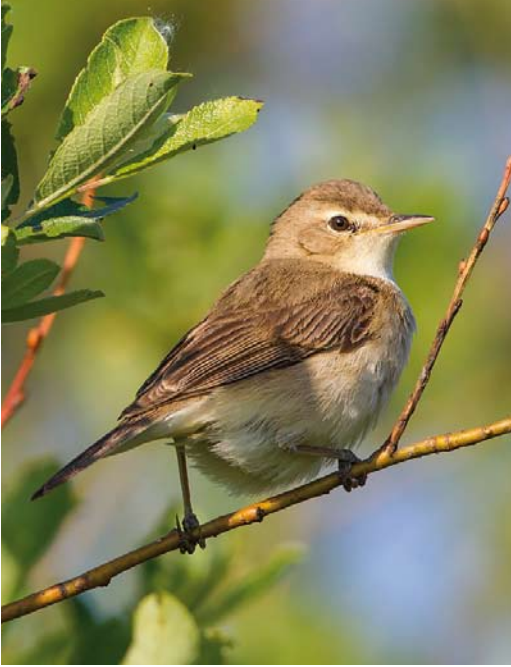
484 Booted Warbler / Kleine Spotvogel Iduna caligata , airport marshes near Bolshoy Istok, Yekaterinburg, Russia, 7 June 2014 (David Monticelli)