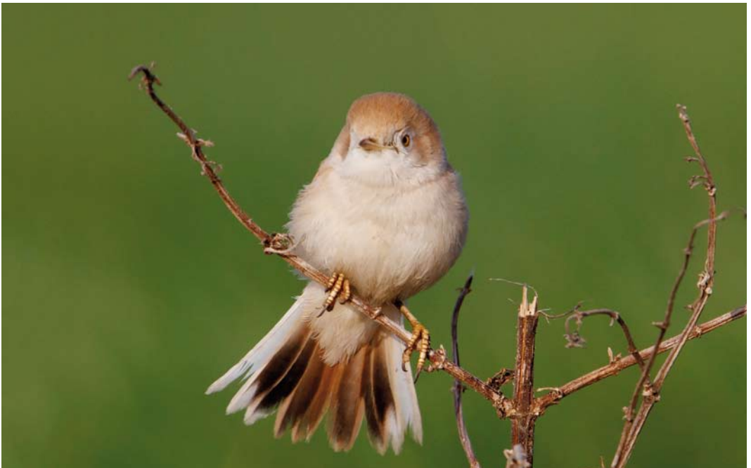
508 Afrikaanse Woestijngrasmus / African Desert Warbler Sylvia deserti , Alphen aan den Rijn, Zuid-Holland, 29 november 2014