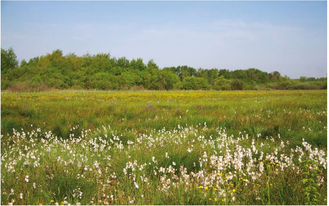
479 Airport marshes near Bolshoy Istok, Yekaterinburg, Russia, 19 June 2013 ( Eric Didner ) 480 Azure Tit / Azuurmees Cyanistes cyanus , marshes east of Monetnyy, Yekaterinburg, Russia, 8 June 2014 ( David Monticelli ) 481 Long-tailed Rosefinch / Langstaartroodmus Carpodacus sibiricus , marshes east of Monetnyy, Yekaterinburg, Russia, 8 June 2014 ( David Monticelli )