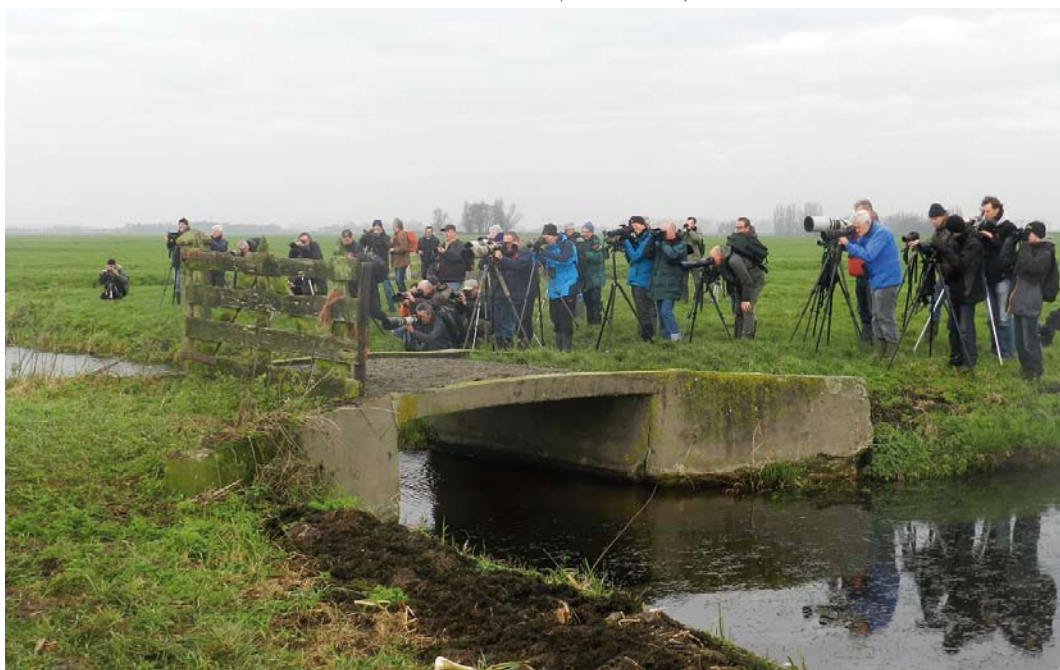
510 Vogelaars bij Afrikaanse Woestijngasmus Sylvia deserti , Alphen aan den Rijn, Zuid-Holland, 28 november 2014 ( Enno B Ebels )