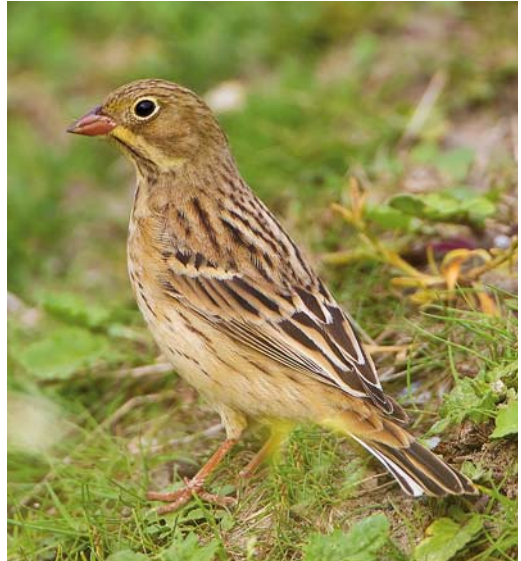
565 Ortolaan / Ortolan Bunting Emberiza hortulana , Maasvlakte, Zuid-Holland, 30 augustus 2015 (Martin van der Schalk)

een adulte Struikrietzanger Acrocephalus dumetorum op 2 augustus op Goeree, Zuid-Holland. In augustus waren er ten minste 20 veldwaarnemingen van Waterrietzanger A. paludicola . Vergeleken hiermee stelde het aantal van 10 ringvangsten enigszins teleur. In augustus werden vier Grote Karekieten A. arundinaceus geringd. Een Graszanger Cisticola juncidis werd regelmatig waargenomen in het Verdrongen Land van Saeftinghe, Zeeland.