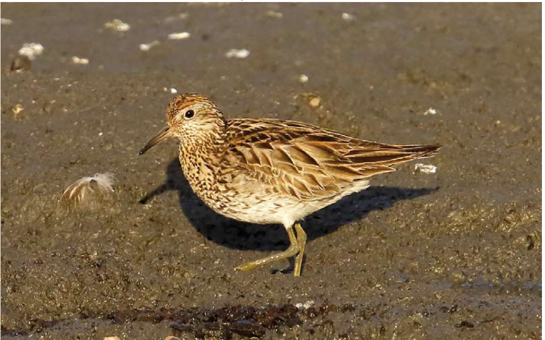
533 Sharp-tailed Sandpiper / Siberische Strandloper Calidris acuminata , adult, Camperduin, Noord-Holland, Netherlands, 7 September 2015