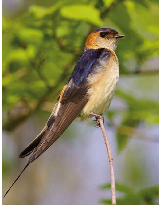
447 Roze Spreeuw / Rosy Starling Pastor roseus , Barneveld, Gelderland, 9 juni 2015 (Co van der Wardt) 448 Roodstuitzwaluw / Red-rumped Swallow Cecropis daurica , Den Hoorn, Texel, Noord-Holland, 17 mei 2015 (Diederik Kok) 449 Vermoedelijke Witbandkruisbek / presumed Two-barred Crossbill Loxia leucoptera , vrouwtje, met Kruisbek / Red Crossbill L. curvirostra , Uden, Noord-Brabant, 17 juni 2015 (Alexander Buil)