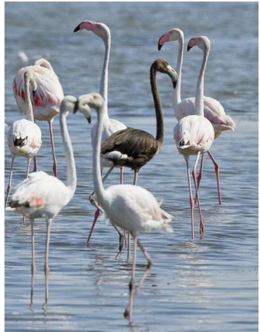
310 Melanistic Greater Flamingo / melanistische Flamingo Phoenicopterus roseus , with normally coloured individuals, Eilat, Israel, 8 August 2013

case much less dark and less extensive than in this bird. Between October 2012 and early 2014, the bird underwent moult but its features hardly changed (if at all). This indicates that the dark plumage was not caused by external factors, such as staining (dirt or oil), but was an intrinsic character of this individual. The dark colour was therefore probably caused by melanism (cf van Grouw 2006, 2013). Whether it was a hereditary type of melanism (by mutation) is hard to tell. This is most likely the case but melanism can also be caused by a shortage of vitamin D or other physical deformities (Hein van Grouw in litt).