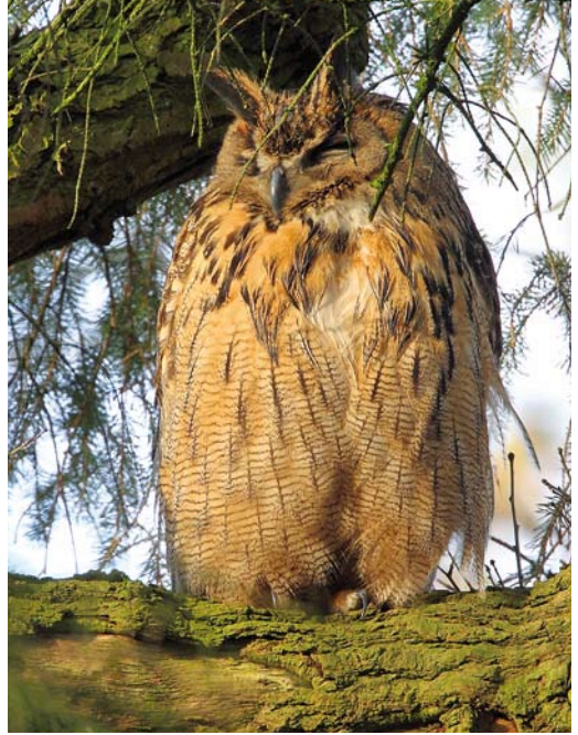
79 Gestreepte Strandloper / Pectoral Sandpiper Calidris melanotos , juveniel, Schoorkuilen, Limburg, 4 november 2011 (René Weenink) 80 Oehoe / Eurasian Eagle Owl Bubo bubo , Heiloo, Noord-Holland, 24 december 2011 (Eric Menkveld) 81 Parelduiker / Black-throated Loon Gavia arctica , juveniel, Oudeschild, Texel, Noord-Holland, 26 december 2011 (René Pop)