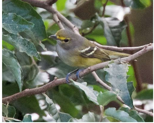
42 White-eyed Vireo / Witoogvireo Vireo griseus , first-year, Ribeira da Lapa, Corvo, Azores, 24 October 2008

west of the 'high fields' on Corvo's sloping eastern flank. Ribeira da Lapa is a small and relatively open valley (compared with other ribeiras on Corvo), the vegetation being dominated by laurel and hydrangea scrub and small cedars. Unfortunately, despite finding a Lesser Yellowlegs Tringa flavipes alongside the pools in the lower part of the valley, they had not detected any interesting passerines and, about halfway up the valley, PA headed south to work his way back through the fields as DS pushed on up the ribeira. Dropping back into the valley bottom, DS was struck by the increased amount of bird activity in this section and, after briefly stopping to take a photograph, settled down in a shady spot overlooking an area of scrub on the opposite side. After a short period scanning, a small, grey-headed passerine with double wing-bars and yellow underparts suddenly appeared amongst the laurel before, almost instantly, disappearing again.