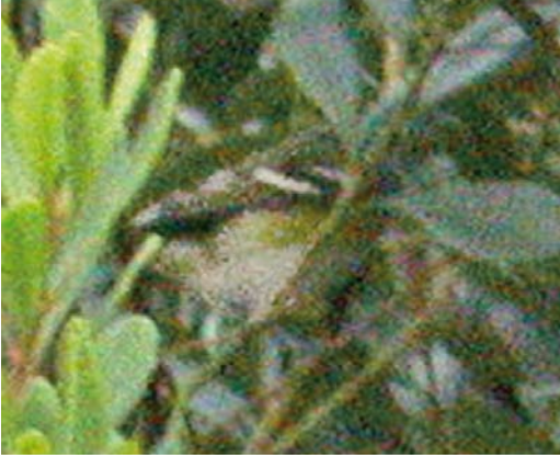
41 White-eyed Vireo / Witoogvireo Vireo griseus , first-year, Ribeira de Cancelas, Corvo, Azores, 22 October 2005