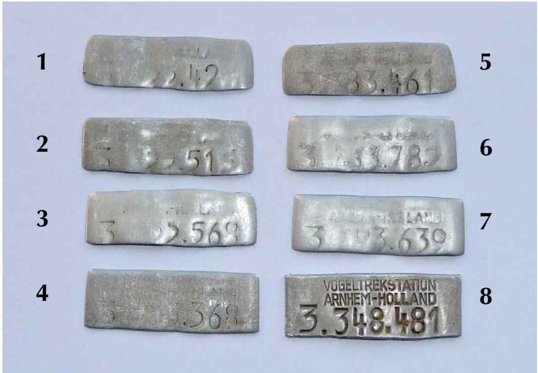
FIGURE 4 Aluminium rings of Vogeltrekstation Arnhem removed from tibia of eight Black-headed Gulls Chroicocephalus ridibundus ; 1-7 wintering at Hilversum, Noord-Holland, Netherlands (intentionally trapped, re-ringed with stainless steel ring), 8 found dead; see table 3 for details.