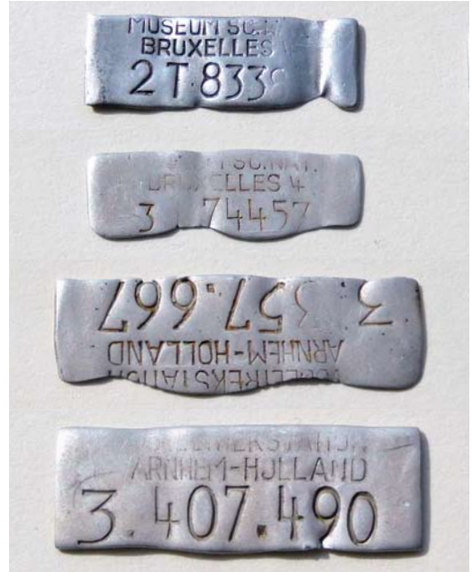
FIGURE 5 Aluminium rings removed from four Black-headed Gulls Chroicocephalus ridibundus breeding on Griend, Friesland, Netherlands (upper three on tarsus, lower on tibia). All trapped on nest and ring replaced by stainless steel ring, Arnhem 3.357.667 upside down; see text for details. Note irregular scalloping of lower edge.