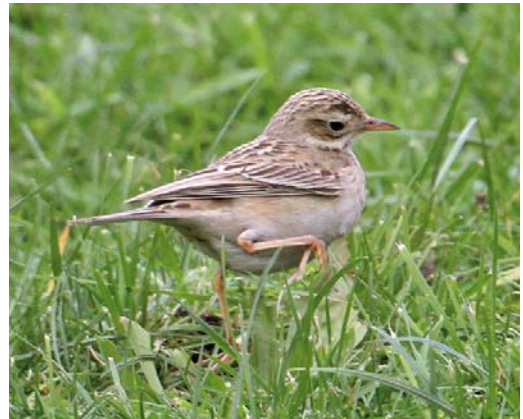
22 Richard's Pipit / Grote Pieper Anthus richardi , first-winter, A Coruña, Galicia, Spain, 11 January 2010 (Pablo Gutiérrez). Note very long white tongue on inner web of second outermost tail-feather (t5), extending far towards base of feather. Note also long-tailed appearance. 23 Richard's Pipit / Grote Pieper Anthus richardi , first-winter, A Coruña, Galicia, Spain, 11 January 2010 (Pablo Gutiérrez). Note triangular shape of black centre of third innermost median covert, almost reaching tip of feather, typical of Richard's. Pattern of two adjoining median coverts, however, more like Blyth's Pipit A godlewskii , with squarer and more clear-cut black centre, creating wide pale tip. 24-25 Richard's Pipit / Grote Pieper Anthus richardi , first-winter, A Coruña, Galicia, Spain, 11 January 2010 (Pablo Gutiérrez). Note long and relatively straight hind claw.

tongue on inner web of t5; 5 mantle pattern more spotted than striped; 6 head pattern with dark lateral crown-stripe and prominent supercilium; and 7 call (which, however, was not recorded). The pattern of the median coverts was not conclusive, with some feathers showing a pattern as in Richard's and some as in Blyth's Pipit (cf plate 20 and 23). However, the most centrally placed moulted one, which are said to be the most important, fit Richard's better (see below).