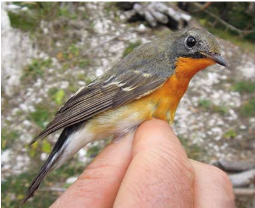
45-46 Mugimaki Flycatcher / Mugimakivliegenvanger Ficedula mugimaki , first-year male, Passo della Berga, Brescia, Italy, 6 October 2011

sembling a Red-breasted Flycatcher Ficedula parva , because of the orange underparts and greyish upperparts. The ringers realized that it was not this species but they did not have direct access to electricity and internet (due to the remote position in the mountains) and, therefore, it took some time before the correct identification was established. RB sent some photographs to Ottavio Janni, who helped to identify the bird as a first-year male Mugimaki Flycatcher F mugimaki .