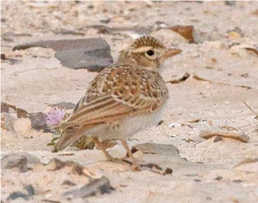
14 Arabian Dunn's Lark / Arabische Dunns Leeuwerik Eremalauda dunnii eremodites , recently fledged juvenile, Arava valley, Israel, 23 May 2010

1991). Since then, it probably also bred in 2003 (James Smith pers comm) but in very small numbers. Both breeding events were linked to local rainfall and floods that produced 'green patches' in the desert.