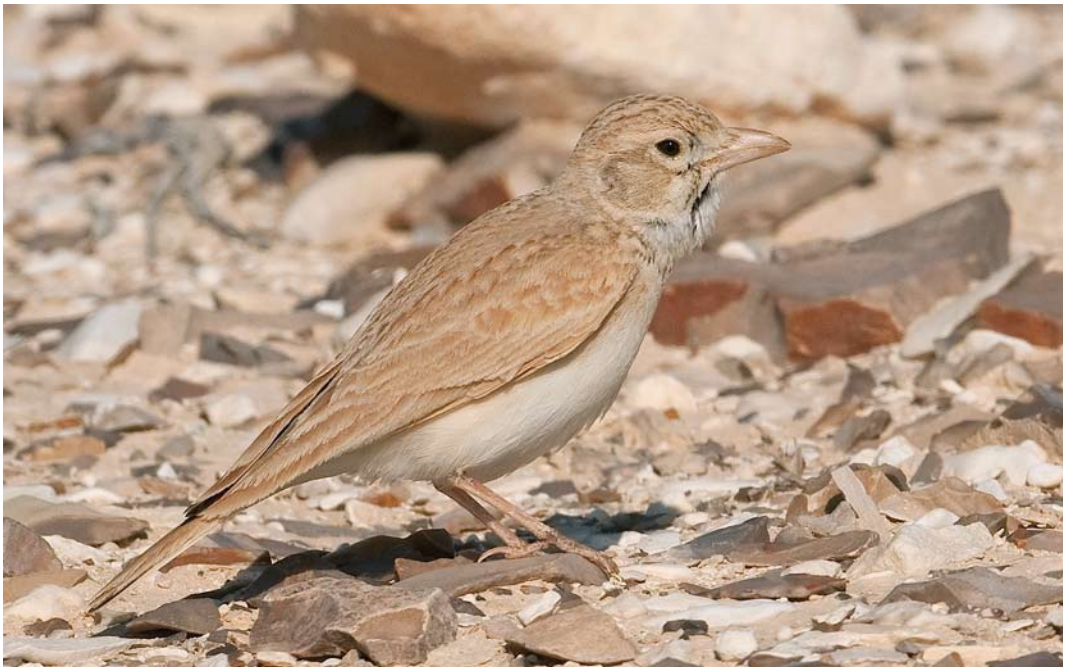
13 Arabian Dunn's Lark / Arabische Dunns Leeuwerik Eremalauda dumni eremodites , Arava valley, Israel, 14 April 2010 (Hadoram Shirihai)

Dunn's Lark is a poorly known nomadic lark breeding locally and discontinuously in remote parts of Central and North Africa and the southern Middle East (del Hoyo et al 2004). Two taxa are recognized: African Dunn's Lark E d dumni in Africa and Arabian Dunn's Lark E d eremodites in the Middle East. It has been suggested that these two may actually represent two species, based on distinctive morphometric differences; further studies into vocalizations and genetic differences are currently being undertaken and the results will be available soon (Hadoram Shirihai pers comm). All Israeli records refer to eremodites . Dunn's Lark is extremely rare in Israel, first recorded in the 1970s (ter Haar 1981, Shirihai 1996). In 1989, it bred in Israel for the first time, in the central Arava valley. This was a major breeding event that involved probably some 10s or 100s of pairs (Shirihai