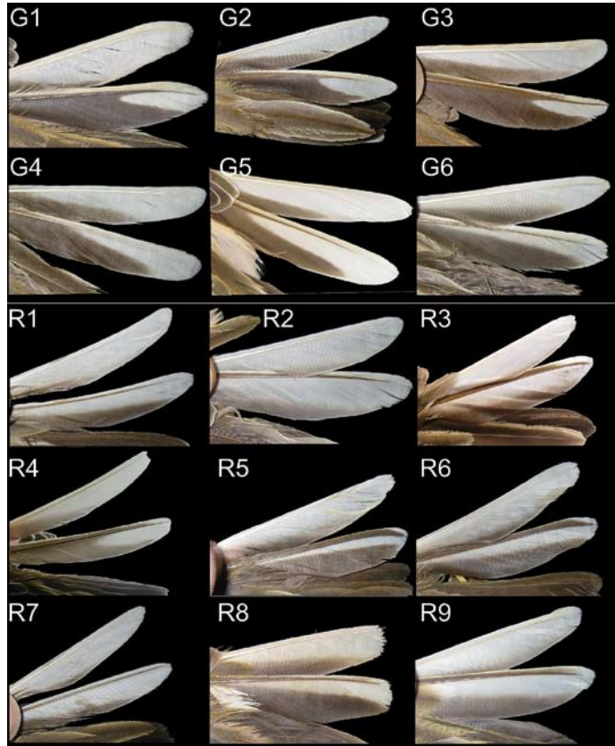
FIGURE 2 Variation in outermost tail-feathers of Richard's Pipit Anthus richardi (R) and Blyth's Pipit A. godlewskii (G) (David Vieites). G1-6 A. godlewskii . R1-4 A. r. richardi . R5-6 atypical A. r. centralasiae . R7 A. r. ussuriensis . R8-9 A. r. sinensis . G1-4 show typical pattern of t5-6 in Blyth's, with some specimens having more white on t5 (G5-G6). R8-9 examples of Richard's where pattern and amount of white resemble atypical Blyth's of G5-6.

Tail pattern is a supporting feature for separating Richard's Pipit and Blyth's Pipit but it should be used with care as there is a certain degree of overlap (Svensson 1992, cf van den Berg et al 1993). The pattern of the outer tail-feather (t6) and the outer web of the second outermost tail-feather (t5) in both species are similar, being mostly white, but with some birds showing a variable degree of brown. Figure 2 shows examples of the variation in t5-6 in both species from a large series of skins at Natural History Museum in Tring, England, and Museum für Naturkunde, Berlin, Germany. In Blyth's, the white on the inner web of t5 never extends to the base of the feather, unlike the most common pattern in Richard's. The variation on t5 and t6 in Richard's is substantial; t5 and t6 usually have much white, with a typical pattern on the