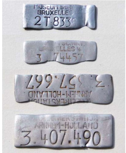
FIGURE 5 Aluminium rings removed from four Black-headed Gulls Chroicocephalus ridibundus breeding on Griend, Friesland, Netherlands (upper three on tarsus, lower on tibia). All trapped on nest and ring replaced by stainless steel ring, Arnhem 3.357.667 upside down; see text for details. Note irregular scalloping of lower edge.