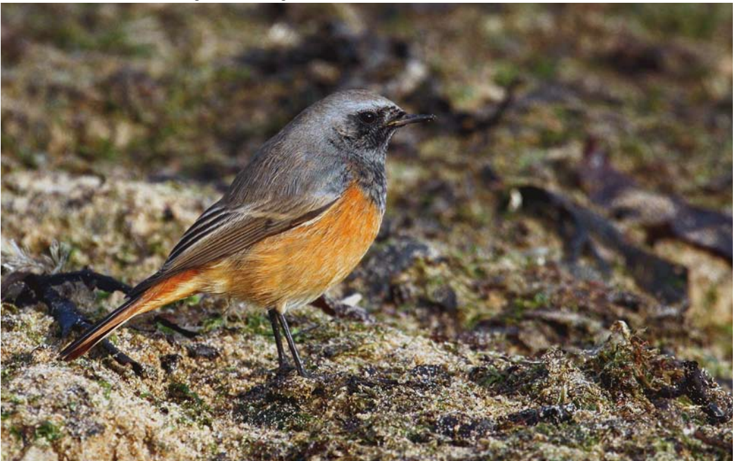
72 Eastern Black Redstart / Oosterse Zwarte Roodstaart Phoenicurus ochruros phoenicuroides , first-year male, Margate, Kent, England, 15 November 2011 ( James A Hanlon )