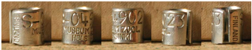
FIGURE 6 Stainless steel ring Helsinki S-049023 of Black-headed Gull Chroicocephalus ridibundus , 30 years and 8 months after ringing on tarsus. Found dead near Monster, Zuid-Holland, Netherlands (record 4 in table 1), collection J van Kruijssen.

as well, with an annual survival of adults of 90% (Prévoit-Julliard et al 1998). During a long-term study in London, England, Gibson (2011) saw 30 individuals of over 20 years old, and 28 breeding birds out of 109 ringed birds (26%) on Griend reached an age of at least 15 years. Most had been ringed as adult, so their real age might even be (much) higher. We have not investigated sex-biased wear and loss of rings but we do not rule out that this also occurs (see Coulson (1976) for