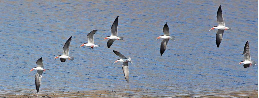
62 Allen's Gallinule / Afrikaans Purperhoen Porphyrio alleni , adult, St Julians, Malta, 24 December 2011 (Raymond Galea) 63 Western Sandpiper / Alaskastrandloper Calidris mauri , first-year, Cley, Norfolk, England, 28 December 2011 (Rob Wilson) 64 African Skimmers / Afrikaanse Schaarbekken Rynchops flavirostris , Kom Ombo, Egypt, 28 December 2011 (Kris De Rouck)

33: 203, 2011). A first-year Western Sandpiper C mauri remained at Cley, Norfolk, England, from 28 November into January. The first-winter Long-toed Stint C subminuta at La Turballe, Loire-Atlantique, France from 6 November stayed until 20 December. A first-year Least Sandpiper C minutilla was foraging at Black Rock Strand, Kerry, Ireland, from 29 November to 19 December. A first-year Sharp-tailed Sandpiper C acuminata was present at Chew Valley Lake, Somerset, England, from 18 November to 16 December. The Wilson's Snipe Gallinago delicata on St Mary's, Scilly, England, since early October stayed into late December, while the 14th recorded in the Azores since the autumn was also found in December. The second Pin-tailed Snipe G stenura for Italy (and Europe) was present for a few days until at least 18 December near Siracusa, Sicily, and its identification could be confirmed by sonagrams. In the Azores, a Hudsonian Whimbrel Numenius hudsonicus was seen at Fajã dos Cubres, São Jorge, on 4 December. The last record of Slender-billed Curlew N tenuirostris for Poland on 7 October 1995 has been reconsidered and is now