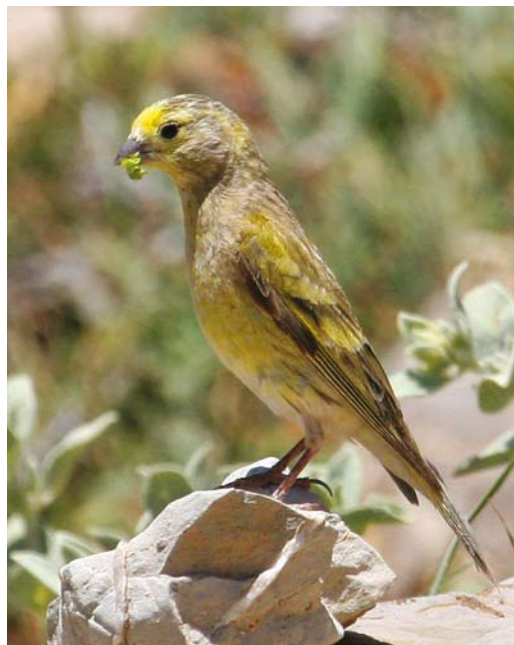
110 Syrian Serin / Syrische Kanarie Serinus syriacus , second-year female, mount Hermon, Israel, 29 May 2008. Note brownish and worn alula feathers and primary coverts, lacking yellowish edges and grey tip.

birds, having both adult-type feathers and some old retained juvenile feathers; and 3 adults (third calendar-year or older) of which all feathers are similar in age and pattern.