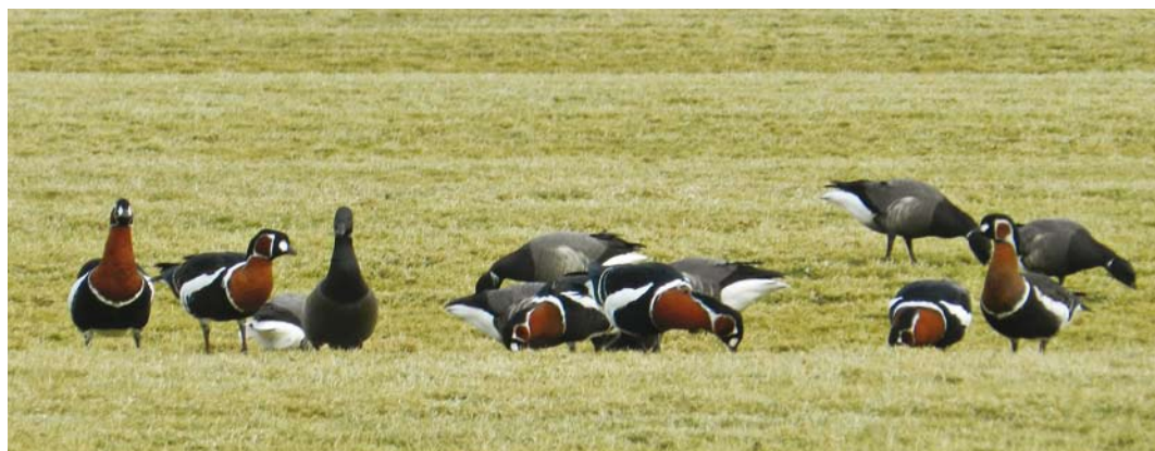
184 Oehoe / Eurasian Eagle Owl Bubo bubo , Winterswijk, Gelderland, 29 februari 2012 ( Arnoud B van den Berg ) 185 Kleine Karekiet / Eurasian Reed Warbler Acrocephalus scirpaceus , Oud-Naarden, Naarden, Noord-Holland, 1 januari 2012 ( Rudy Schippers ) 186 Papegaaiduiker / Atlantic Puffin Fratercula arctica , Scheveningen, Zuid-Holland, 8 januari 2012 ( Rutger Wilschut ) 187 Ringsnavelmeeuw / Ring-billed Gull Larus delawarensis , adult (PAA3), Maasbracht, Limburg, 23 februari 2012 ( Jeroen Nagtegaal ) 188 Roodhalsganzen / Red-breasted Geese Branta ruficollis , Banckspolder, Schiermonnikoog, Friesland, 21 februari 2012 ( Enno B Ebels )