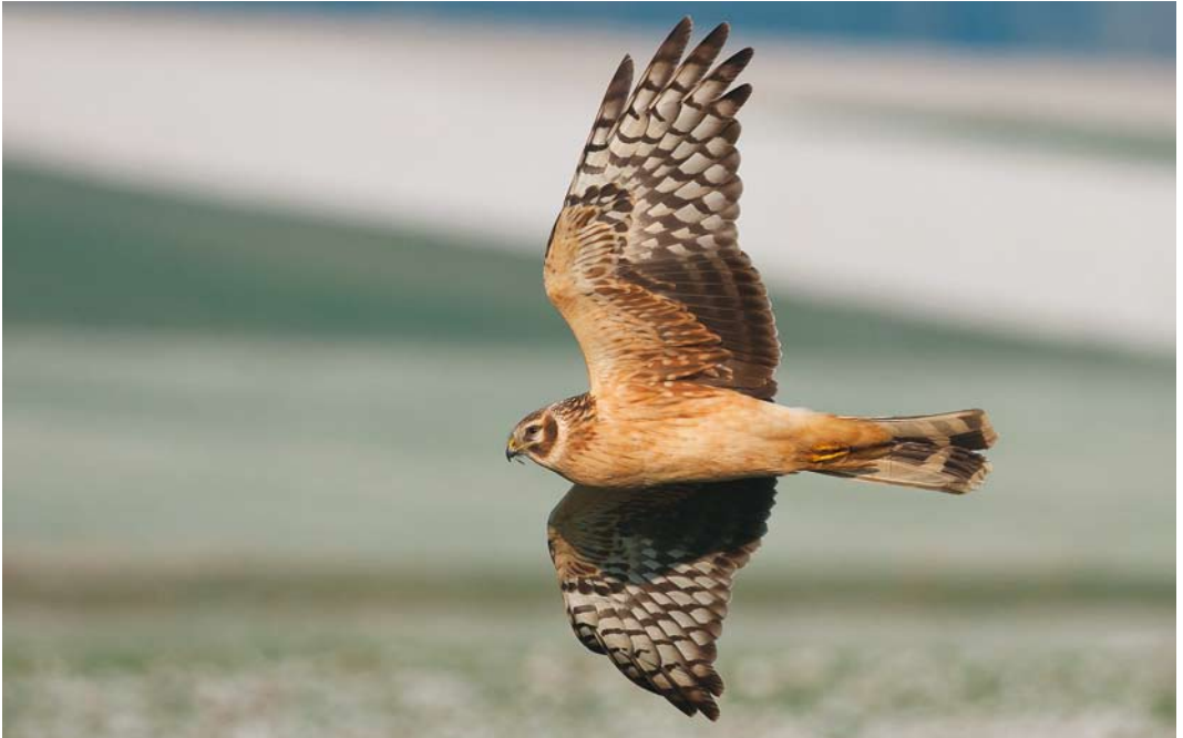
157 Hybrid Pallid x Hen Harrier / hybride Steppekiekendief x Blauwe Kiekendief Circus macrourus x cyaneus , second calendar-year female, Villers-le-Gambon, Namur, Belgium, 1 February 2012