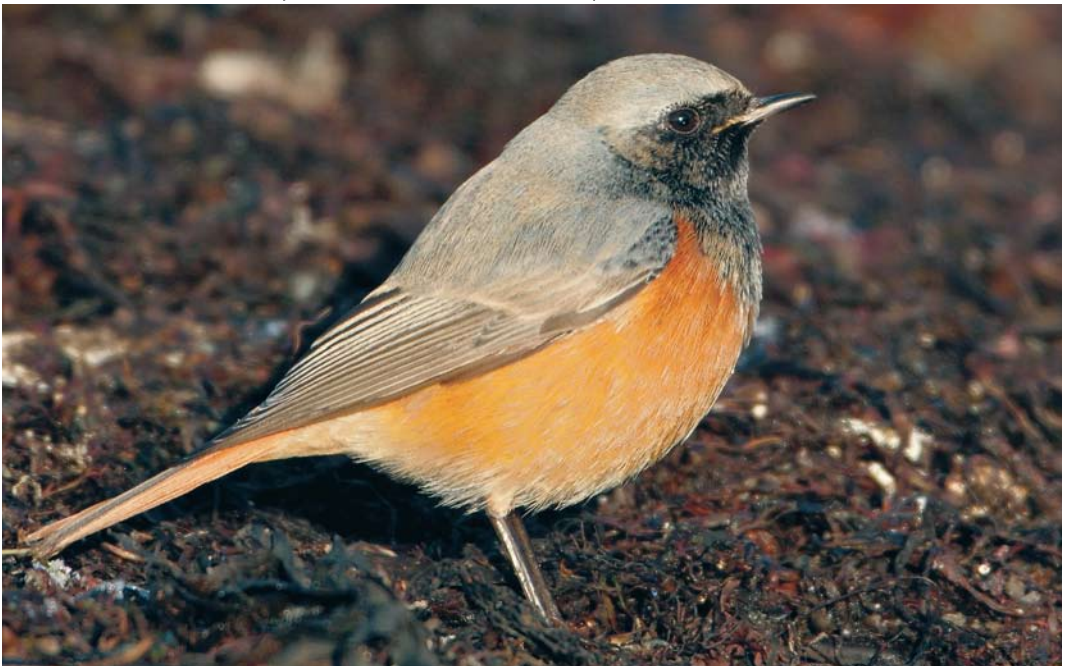
169 Eastern Black Redstart / Oosterse Zwarte Roodstaart Phoenicurus ochruros phoenicuroides , male, Rålehamn, Tjällran, Skåne, Sweden, 24 January 2012 ( Mikael Nord )