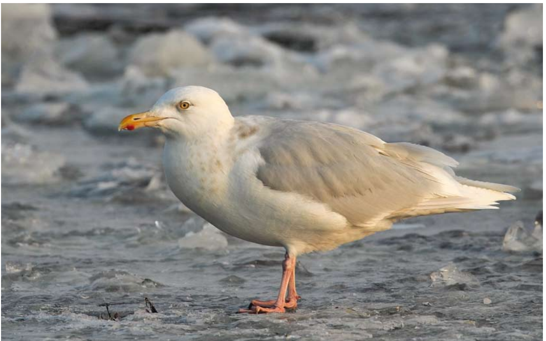
181 Grote Burgemeester / Glaucous Gull Larus hyperboreus , adult, Urk, Flevoland, 7 februari 2012 (Edwin Winkel)