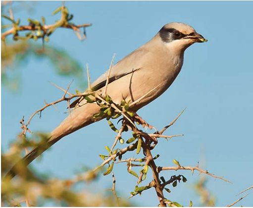
63 Hypocolius / Zijdestaart Hypocolius ampelinus , male, Cape Greco, Cyprus, 4 December 2010 (Alex Kirschel)