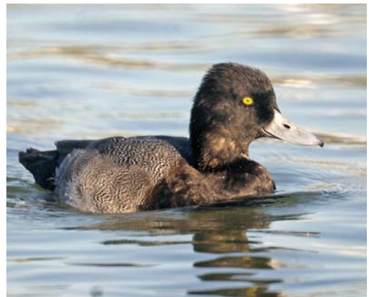
54 Northern Harrier / Amerikaanse Blauwe Kiekendief Circus cyaneus hudsonius , Thornham, Norfolk, England, 28 November 2010 ( Vincent Legrand ) 55 Lanner Falcon / Lannervalk Falco biarmicus , Gageron, Camargue, Bouches-du-Rhône, France, 16 January 2011 ( Marc Thibault ) 56 Forster's Tern / Forsters Stern Sterna forsteri , first-year, Peniche, Portugal, 22 January 2011 ( David Monticelli ) 57 Lesser Scaup / Kleine Topper Aythya affinis , adult male eclipse, Huningue, Haut-Rhin, France, October 2010 ( Tobias Epple )

cies for the Netherlands was in Gelderland in 1996. In England, a genuine juvenile White-tailed Eagle Haliaeetus albicilla turned up in West Sussex on 11 December and flew to Hampshire the next day. The juvenile female Northern Harrier Circus cyaneus hudsonius at Tacumshin, Wexford, Ireland, remained through December as did a juvenile male between Holme and Blakeney, Norfolk, England; a third one was photographed at Kilcoole, Wicklow, Ireland, on 13 November ( Birding World 23: 509-523, 2010). In the Netherlands, 50 breeding pairs of Montagu's Harrier C. pygargus were counted in 2010 of which 45 in eastern Groningen. In southern Spain, an Atlas Long-legged Buzzard Buteo rufinus cirtensis at Los Barrios, Cádiz, on 9 January is considered to be the same individual seen during the past two years. The sixth Rough-legged Buzzard B. lagopus for Spain was photographed off Tarragona on 18 December. In the Netherlands (c 100) and France (at