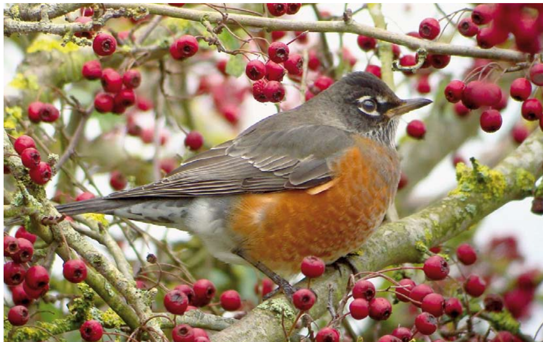
65 American Robin / Roodborstlijster Turdus migratorius , first-winter male, Turf, Devon, England, 11 November 2010