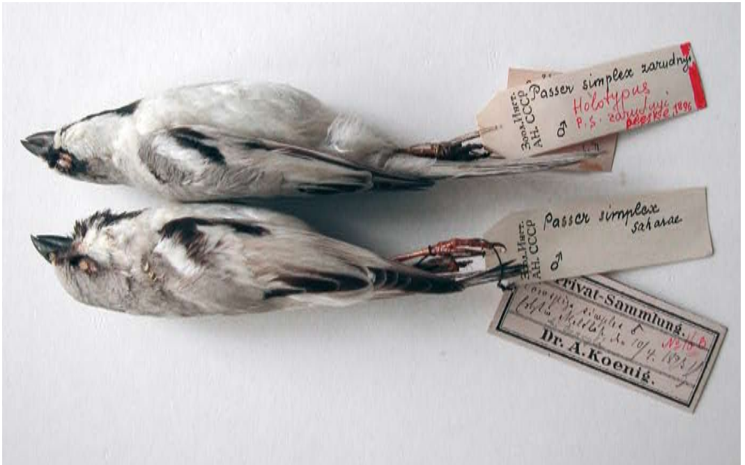
153-155 Zarudny's Sparrow / Zarudny's Woestijnmus Passer (simplex) zarudnyi , holotype (top), and Desert Sparrow / Afrikaanse Woestijnmus P s saharae , male, Zoological Institute, Russian Academy of Sciences, St Petersburg, Russia (ZISP), July 2007.