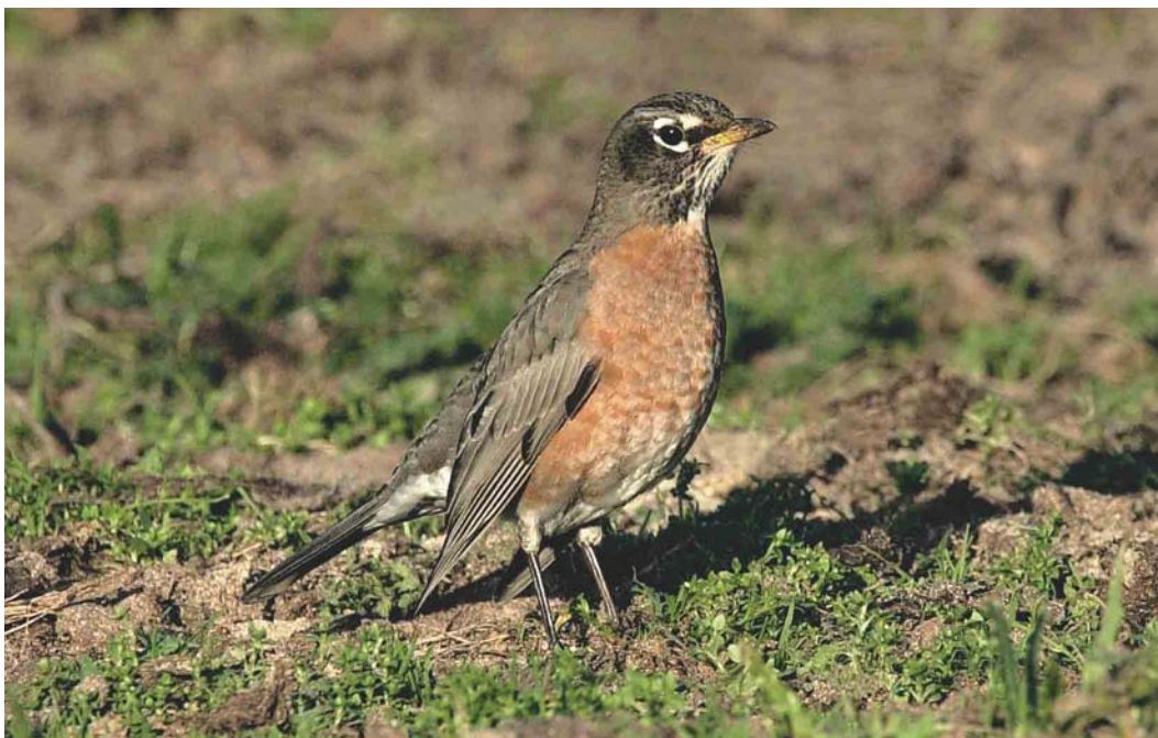
117 American Robin / Roodborstlijster Turdus migratorius , Godrevy Point, Cornwall, England, 16 December 2003