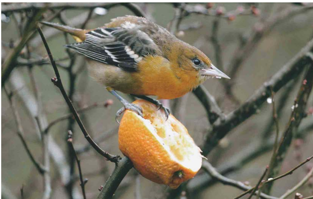
116 Baltimore Oriole / Baltimoretroepiaal Icterus galbula , Headington, Oxford, Oxfordshire, England, 29 December 2003 (Bill Baston)