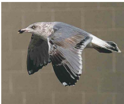
72 American Herring Gull / Amerikaanse Zilvermeeuw Larus smithsonianus , third-winter, Boston, Massachusetts, USA, February 1999. Note extensive black markings on secondaries.

than second-winter birds, and virtually all will have adult-like grey (rather than pale brownish) inner primaries (Martin Elliott pers comm).