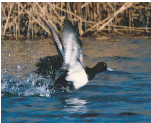
152 Kleine Topper / Lesser Scaup Aythya affinis , adult mannetje, Scheelhoek, Zuid-Holland, 20 februari 2003 (Jan den Hertog)

Dwergaalscholver in Limburgs grensgebied Op 1 maart 2003 besloot Paul van Engelshoven zijn zojuist aangeschafte digitale camera uit te proberen bij de Eijsder Beemden ten zuiden van Maastricht, Limburg. De eerste drie foto's die hij door zijn telescoop maakte waren van een kleine aalscholver die op een paar stronken in het water zat. Hij dacht aan een Kuifaalscholver Stictocarbo aristotelis en belde 's middags een kennis die ook naar vogels keek met deze mededeling; dit leidde echter niet tot vervolgacties. Op 2 maart besloot Ben Gaxiola de Eijsder Beemden – zijn voormalige 'local patch' – te bezoeken omdat hij vanwege familieverplichtingen het weekend in Limburg vertoefde. Op weg terug naar zijn auto werd rond 16:30 zijn aandacht getrokken door een kleine aalscholver en hij dacht onmiddellijk met een Dwergaalscholver Microcarbo pygmeus van doen te hebben. Hij zag de vogel zonder telescoop en was door het slechte weer nog niet 100% zeker van de determinatie. De volgende ochtend bleek de Dwergaalscholver vroeg aanwezig op zijn visplek en kon Ben de determinatie definitief afronden. De vogel was in zomerkleed, met een donkere keel, iets lichtere buik en witte pluimveertjes op met name oorstreek en achterkop. Om c 07:40 vloog de vogel op in zuidelijke richting en verdween richting België. Rond 17:00 verscheen hij weer in de Eijsder Beemden, blijkbaar zijn vaste slaapplek.