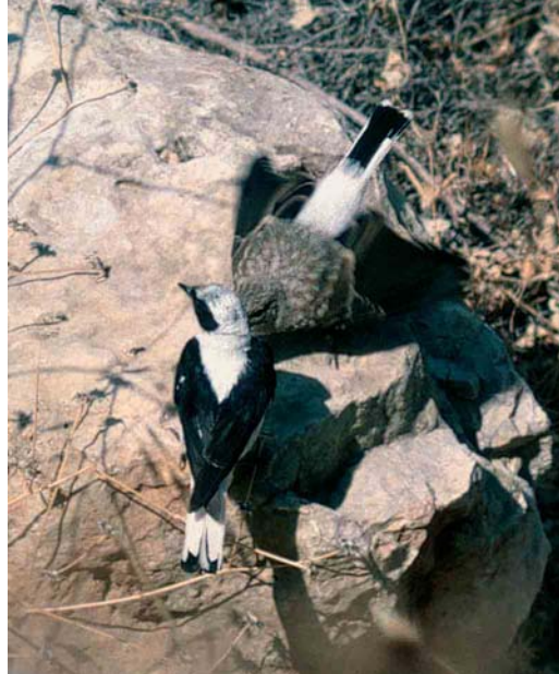
75 Eastern Black-eared Wheatears / Oostelijke Blonde Tapuiten Oenanthe melanoleuca , adult male (lower left) and juvenile, Crete, Greece, July 1984. Typical bird with obvious grey suffusion to crown and nape, and all-white triangular, rather narrow mantle, giving bi-coloured character to upperparts. By July, adult melanoleuca males rarely display any obvious ochre. Moulting has started and the middle, black, rectrices are missing.

males point towards melanoleuca , while bright, deep ochre upperparts point towards hispanica . In spring, whitish crown and nape with pale brownish/greyish tinge and only a slight ochre/orange touch on the mantle, as well as whitish breast and belly indicate melanoleuca , while deep ochre, uniform upperparts indicate hispanica . The most reliable of these plumages is the typical autumn melanoleuca plumage. The others are not conclusive and will need supportive characters for identification. Melanoleuca has more black on the scapulars, leaving a narrower pale mantle section than on hispanica – a good additional field mark for typical birds, mainly in spring. There is more black on the head in melanoleuca than in hispanica , thus covering a larger area of the lores, the forehead, the ear-coverts and – in black-throated males – the throat. This is the most reliable single field character in autumn as well as spring, and safe identification normally requires trustworthy assessment of