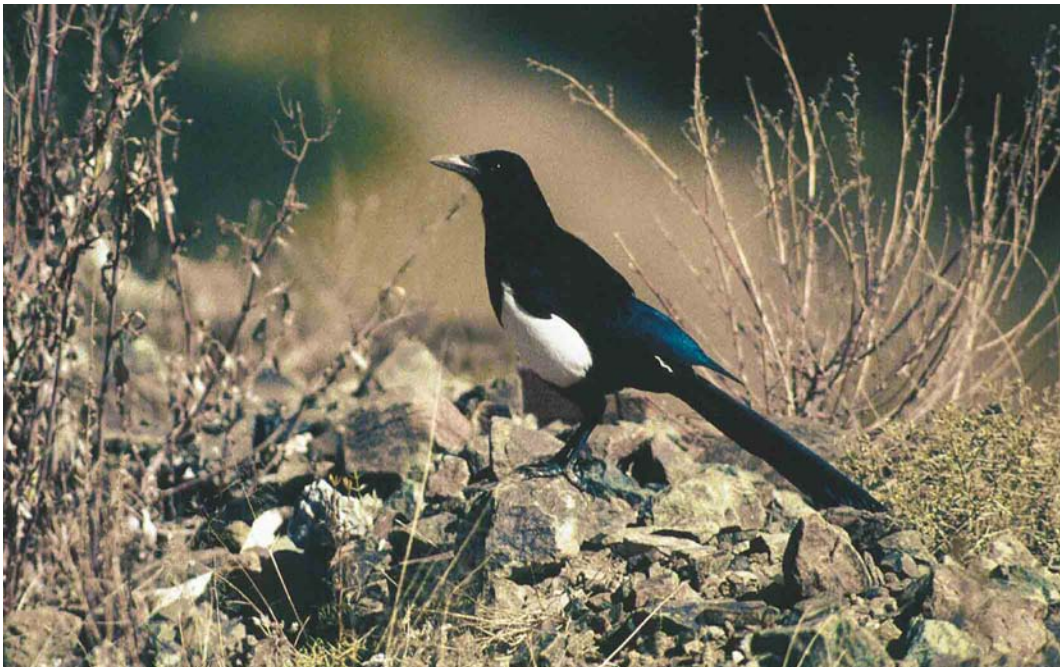
102 Asir Magpie / Asirekster Pica (pica) asirensis , Raydah, Asir Province, Saudi Arabia (Bruno Pambour/NWRC-Taif)