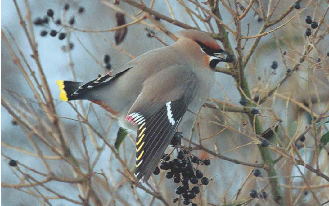
145 Pestvogel / Bohemian Waxwing Bombycilla garrulus , Noordwijk, Zuid-Holland, januari 2003 (Menno van Duijn)