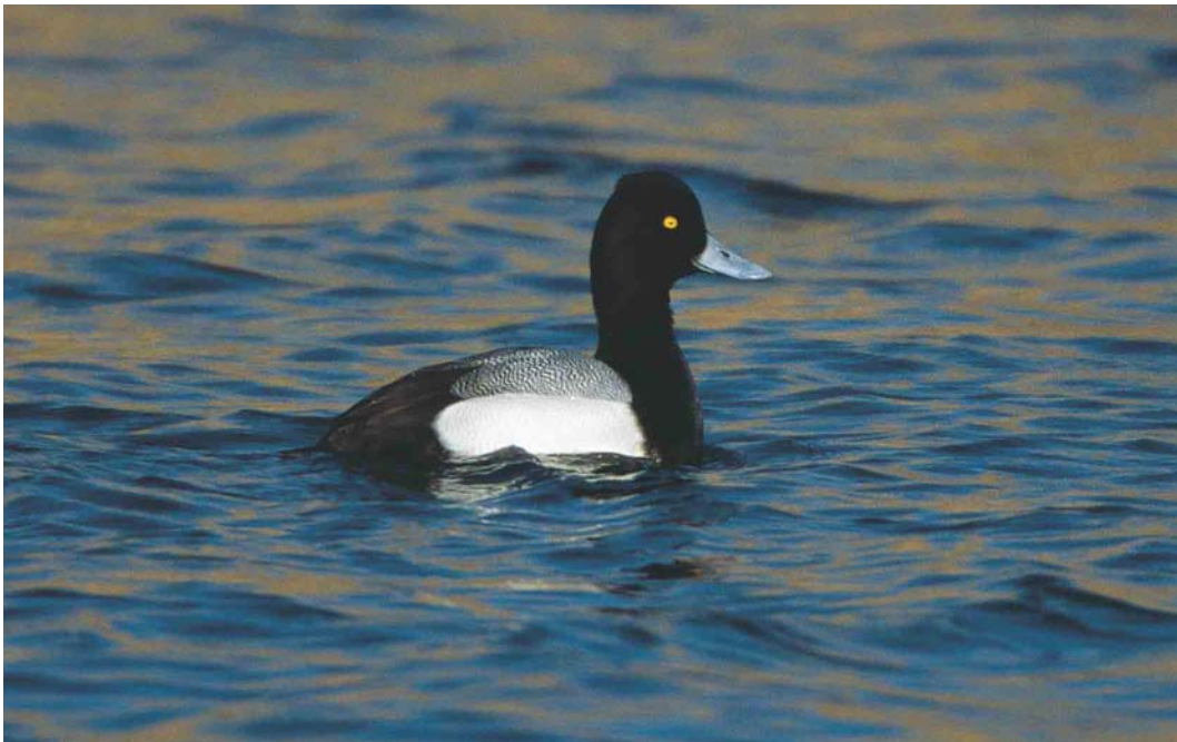
136 Kleine Topper / Lesser Scaup Aythya affinis , adult mannetje, Scheelhoek, Zuid-Holland, 21 februari 2003