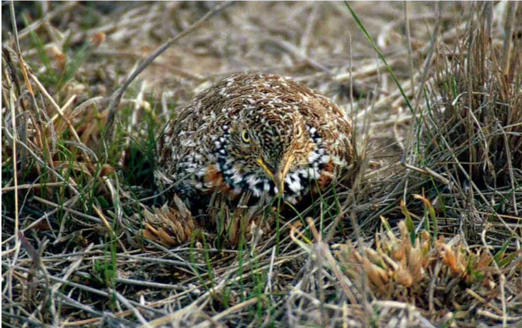
93-94 Plains-wanderer / Trapvechtkwartel Pedionomus torquatus , adult female, near Deniliquin, New South Wales, Australia, 20 June 2002