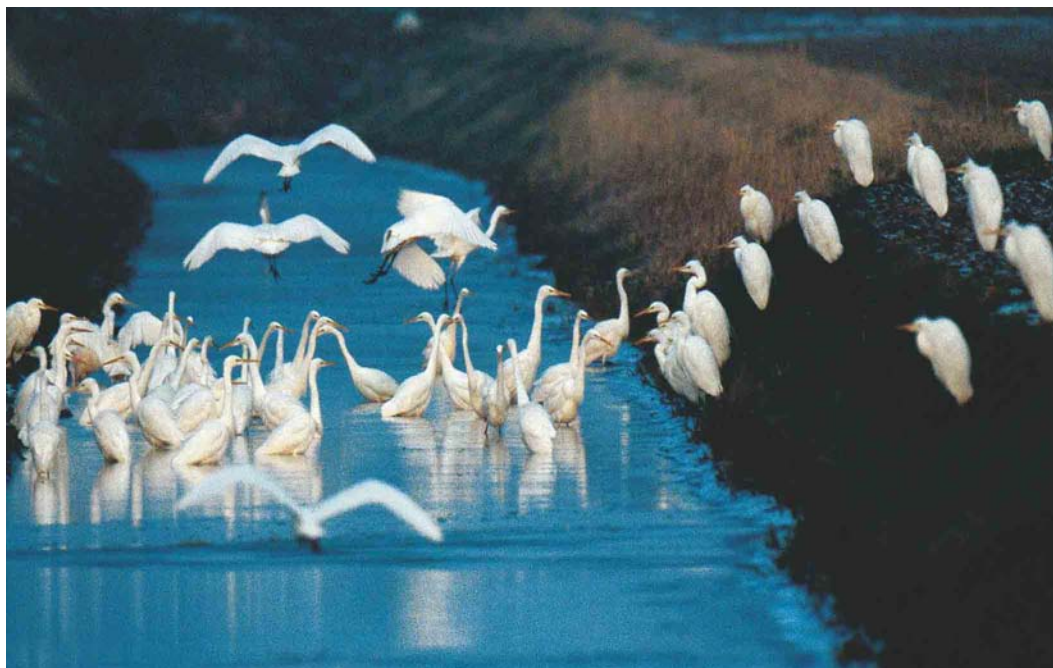
137 Grote Zilverreigers / Great Egrets Casmerodius albus , Brabantsche Biesbosch, Noord-Brabant, januari 2003