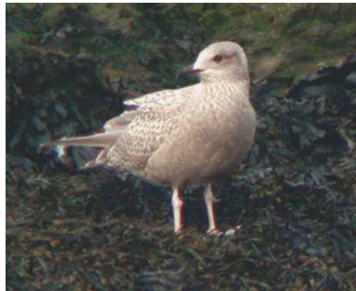
123 Lesser Short-toed Lark / Kleine Kortteenleeuwerik Calandrella rufescens , Utlångan, Blekinge, Sweden, 14 February 2003 ( Mikael Nord ) 124 Glaucous Gull / Grote Burgemeester Larus hyperboreus , second-winter, Punta de Jandia, Fuerteventura, Canary Islands, 7 February 2003 ( Andreas Buchheim ) 125-126 Thayer's Gull / Thayers Meeuw Larus glaucooides thayeri , juvenile, Killybegs, Donegal, Ireland, 24 February 2003 ( Chris Batty )

Another adult occurred at Castro Urdiales, Cantabria, Spain, from 9 February to March. A first-winter was present at Entressen, La Crau, Bouches-du-Rhône, from 25 February to at least 9 March, together with a first-winter Ring-billed Gull L. delawarensis and an adult Glaucous Gull L. hyperboreus . In both France and Spain, eight Ring-billed Gulls were reported during February alone. At Pt Saint Elmo, Malta, a first-winter Slender-billed Gull L. genei and a first-winter European Herring Gull L. argentatus were seen on 18 January and several Pontic Gulls L. cachinnans in January-February. On 16 February, seven migratory Lesser Black-backed Gulls flew over Reykjavík, Iceland. In the third week of February, six first-winter American Herring Gulls L. smithsonianus were reported from Cork and Londonderry, Ireland, and one from Cornwall, England. Up to 11 were present in the Azores in February. On 2 February, a juvenile Thayer's Gull L. glaucooides thayeri