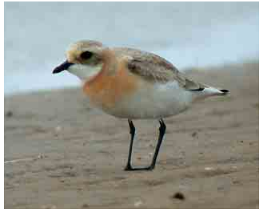
150 Pacific Golden Plover / Aziatische Goudplevier Pluvialis fulva , Harger- en Pettemerpolder, Noord-Holland, Netherlands, 14 April 2002 ( Nils van Duivendijk ) 151 Great Snipe / Poelsnip Gallinago media , Maassluis, Zuid-Holland, Netherlands, 16 May 2002 ( Leo J R Boon/Cursorius ) 152-153 Lesser Sand Plover / Mongoolse Plevier Charadrius mongolus , Rimac, Lincolnshire, England, May 2002 ( Michael J Tarrant )

ladelphia was seen at Le Croisic, Loire-Atlantique, France, on 13 March. In England, the adult staying until 9 March at Millbrook, Cornwall, turned up at Paghham, West Sussex, on 16 March where it remained until at least 25 March. In Scotland, an adult was found on South Uist, Outer Hebrides, Scotland, on 28 April. In Spain, the first Audouin's Gull L audouinii for Cantabria was a third-summer at Somo in Santander bay from 5 May. In France, singles were seen at Lapalme, Aude, on 24 April (second-summer), at Portiraques, Hérault, on 1 May and at the Camargue on 16 May. In Sardinia, up to 4000 Slender-billed Gulls L genei were counted at Molentargius on 14 April. On 15 May, one was reported at Wollmatinger Ried, Baden-Württemberg, Germany. On Flores, Azores, not only four first-winter Ring-billed Gulls L delawarensis but also a first-winter American Herring Gull L smithsonianus was observed at Lagoa Rasa on 16 April.