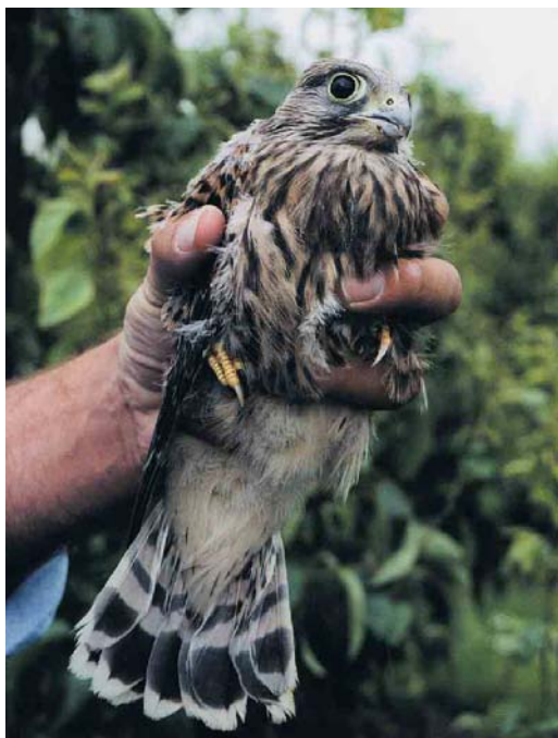
107 Common Kestrel / Torenvalk Falco tinnunculus , 27-day-old juvenile, Kapelle, Zeeland, Netherlands, 24 June 2000

However, the accompanying photograph demonstrates that even this character is not always decisive. It depicts a 27-day-old juvenile Common Kestrel, ringed as one of four fledglings at Kapelle, Zeeland, the Netherlands, on 24 June 2000. The central claw on both feet is very pale,