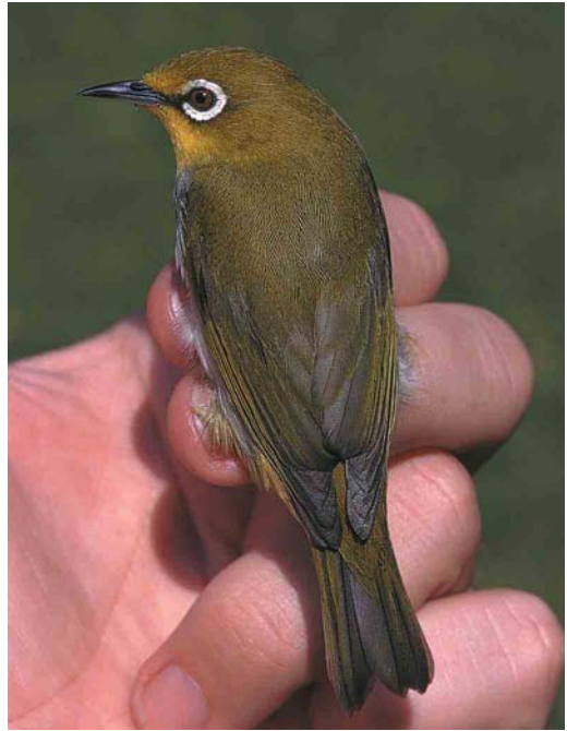
213 Japanese White-eye / Japanse Brilvogel Zosterops japonicus simplex , Mai Po, Hong Kong, China, 11 September 1999 (Paul J Leader). Note short primary projection and pronounced contrast between yellow throat and green side of head