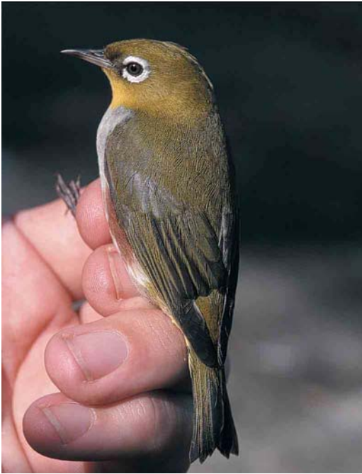
212 Chestnut-flanked White-eye / Roodflankbrilvogel Zosterops erythropleurus , Kadoorie Farm and Botanic Garden, Hong Kong, China, November 1999. Note long primary projection and diffuse contrast between yellow throat and green side of head