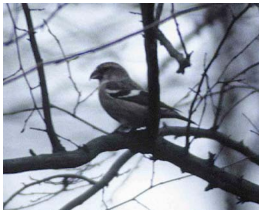
81 Two-barred Crossbills / Witbandkruisbekken Loxia leucoptera bifasciata , female, Kuinderbos, Flevoland, 14 December 1997

Common Crossbills at Kwinteloijen, Rhenen, Utrecht.