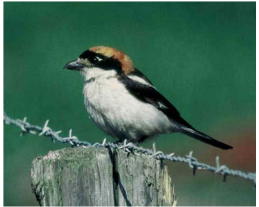
69 Dusky Warbler / Bruine Boszanger Phylloscopus fuscatus , Lauwersoog, Groningen, November 1997 70 Greater Short-toed Lark / Kortteenleeuwerik Calandrella brachydactyla , Grevenbicht, Limburg, 30 April 1997 71 Arctic Warbler / Noordse Boszanger Phylloscopus borealis , Maasvlakte, Zuid-Holland, 28 September 1997 72 Woodchat Shrike / Roodkopklauwier Lanius senator , second-year male, Katwijk aan Zee, Zuid-Holland, 26 July 1997

After review, involving a quite heated correspondence with foreign experts about the separation of this species from Booted Warbler A. caligatus , CDNA has decided that the only accepted field record, on Vlieland, Friesland, on 18 September 1994 (van der Veen & Ebels 1996) is still acceptable. The photograph of a Paddyfield Warbler on Fair Isle, Scotland, in October 1997 (Dutch Birding 19: 307, plate 310, 1997), showing striking resemblance to the Vlieland bird, took away the last remaining doubts among the committee members.