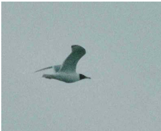
101 Reuzenzwartkopmeeuw / Pallas's Gull Larus ichthyaetus , adult, Gullegem, West-Vlaanderen, 18 maart 1999