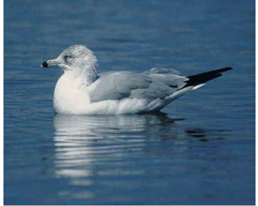
97 Ring-billed Gull / Ringsnavelmeeuw Larus delawarensis , second-winter, Quinta do Lago, Algarve, Portugal, 14 March 1999 (Ray Tipper)

lan, Cork, Ireland, until at least 20 April; in Scilly, England, until at least 20 March; and at Ashford, Kent, until at least 23 March. In England, other individuals were seen in Surrey on 16 March, in Norfolk on 17-29 March and in Cornwall in early April. A Black-browed Albatross Diomedea melanophris was seen off Ouessant, Finistère, France, on 1-2 April. A Red-billed Tropicbird Phaethon aethereus was reported off Playa Santiago, La Gomera, Canary Islands, on 11 March. On 20 February, the first White-tailed Tropicbird P lepturus for the Cape Verde Islands was an adult seen at Ilhéu de Curral Velho, Boavista. On 9 March, a Great White Pelican Pelecanus onocrotalus occurred at Hyères, Var, France. A Little Bittern Ixobrychus minutus at Sint Maartensvlotbrug, Noord-Holland, on 13 April may be one of the earliest arrivals ever for the Netherlands. In the Cape Verde Islands, dark-morph Western Reef Egrets Egretta gularis were seen on São Vicente from 19 January until at least 14 March, at Baía da Gata, Boavista, on 21 February, and at Praia, Santiago, on 11 March. The first Great Egret Casmerodius albus for the Cape Verde Islands was photographed at Rabil lagoon, Boavista, on 9 March.