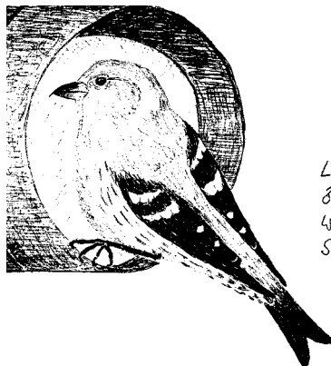
Loxia leucoptera ♂ ad., 21.08.97 Willemsduin / Schiermonnikoog