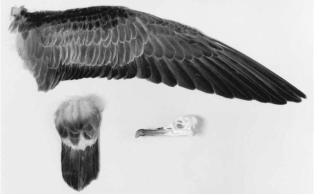
59 Great Shearwater / Grote Pijlstormvogel Puffinus gravis , second-calendar year (wing, tail and skull of bird found beached at Petten, Noord-Holland, on 23 February 1997), Zoölogisch Museum Amsterdam, Amsterdam, Noord-Holland (Louis A van der Laan) 60 Pied-billed Grebe / Dikbekfuut Podilymbus podiceps , adult, Akersloot, Noord-Holland, April 1997 (Hans Gebuis) 61 Pied-billed Grebe / Dikbekfuut Podilymbus podiceps , adult, Akersloot, Noord-Holland, April 1997 (Jan van Holten)