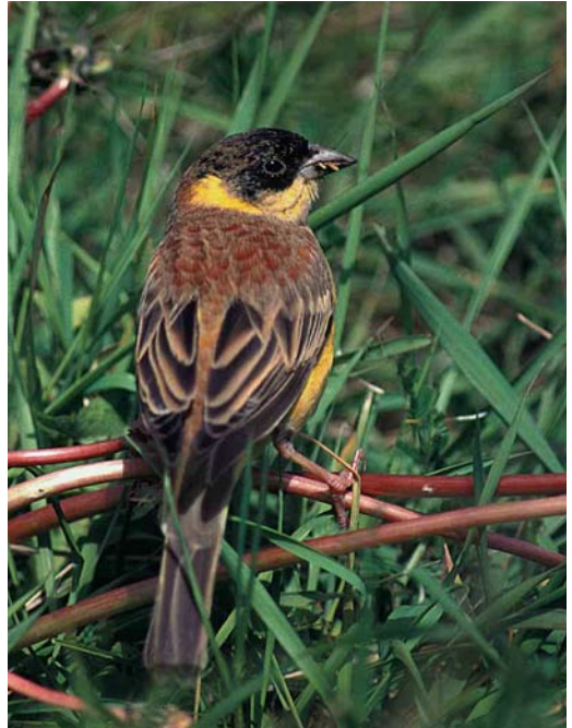
77 Black-headed Bunting / Zwartkopgors Emberiza melanocephala , first-summer male, Den Helder , Noord-Holland, 5 May 1997 ( René Pop )

Hutchins's Canada Goose Branta hutchinsii hutchinsii 3 March, Brakel , Gelderland, five (description does not