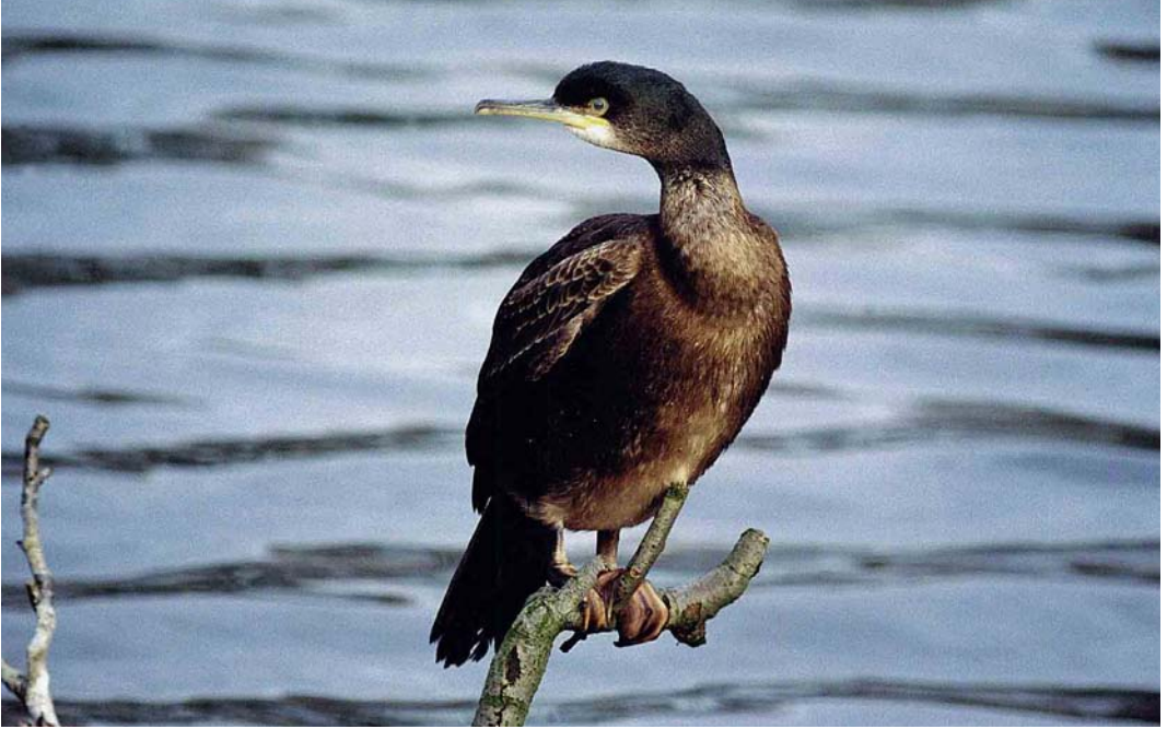
99 Kuifaalscholver / European Shag Stictocarbo aristotelis , eerste-winter, Eindhoven, Noord-Brabant, 28 februari 1999