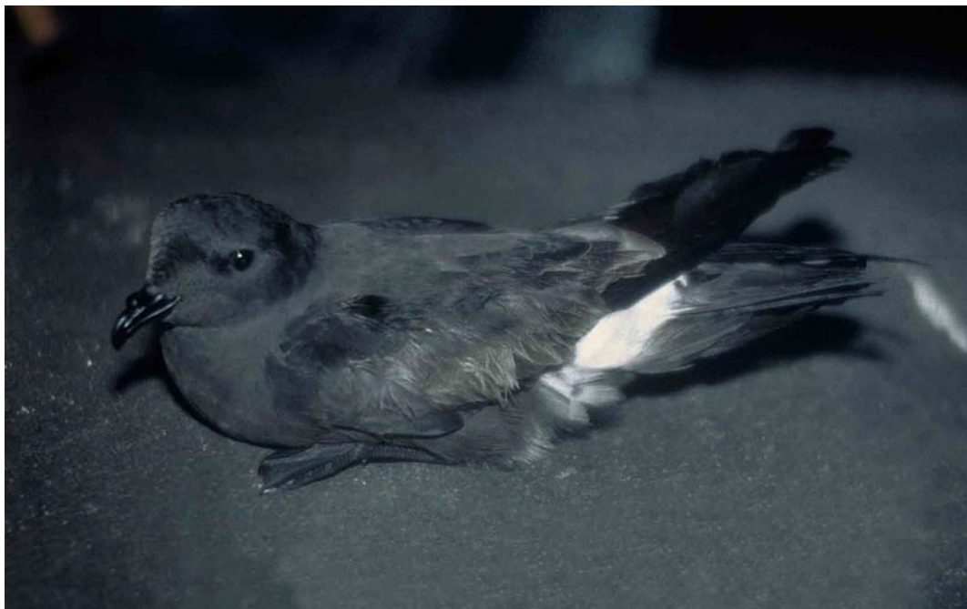
87 Madeiran Storm-petrel / Madeirastormvogeltje Oceanodroma castro , Furna Roques, Ilhas Desertas, Madeira, September 1996 (Manuela Nunes)

birds ringed in one season were recaptured in the same season in a subsequent year whereas only two possible interchanges between hot- and cool-season populations were noted. The brood-patch scores of the latter two individuals suggested that they were non-breeders (Monteiro & Furness 1998).