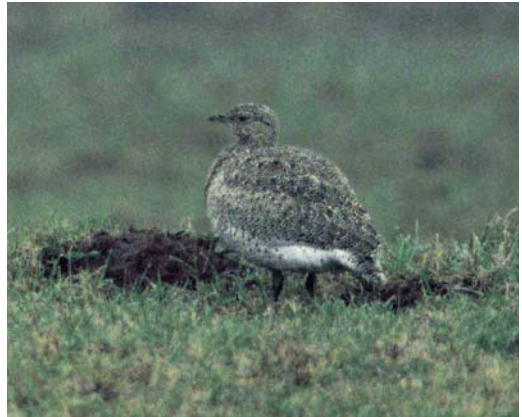
63 Little Bustard / Kleine Trap Tetrax tetrax , immature male, Etersheim, Zeevang, Noord-Holland, 8 March 1997