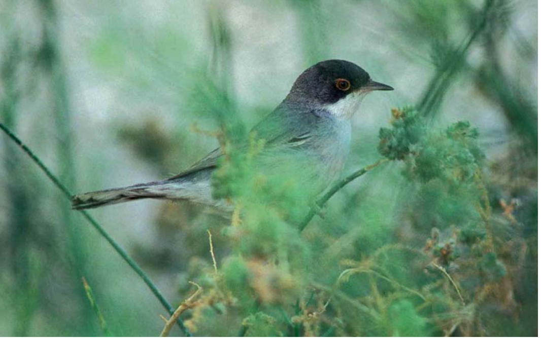
90 Ménétries's Warbler / Ménétries' Zwartkop Sylvia mystacea , Kibbutz Lothan, Israel, 2 April 1999 (René van Rossum) 91 White-tailed Lapwing / Witstaartkievit Vanellus leucurus , Yotvata, Israel, 21 March 1999 (Alex Wieland) 92 Oriental Skylark / Kleine Veldleeuwerik Alauda gulgula , Yotvata, Israel, 21 March 1999 (Alex Wieland)