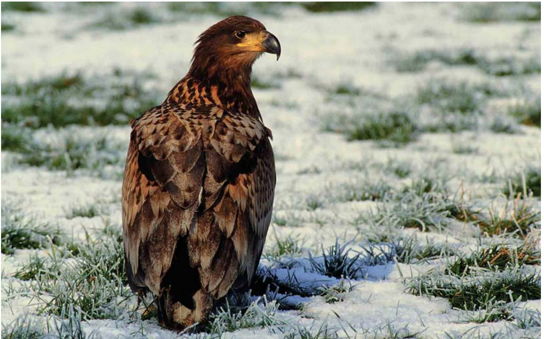
102 Zearend / White-tailed Eagle Haliaeetus albicilla , Zevegem, Oost-Vlaanderen, februari 1999

cus vlogen langs Zeebrugge op 1 februari en langs Nieuwpoort op 17 februari. Op 5 en 17 februari trok een Grote Jager S. skua langs Nieuwpoort en op 27 maart één langs Raversijde. Totaal onverwacht werd op 18 maart gedurende drie minuten een adult-zomer Reuzenzwartkopmeeuw Larus ichthyaetus waargenomen boven de Bergelenput te Gullegem, West-Vlaanderen. De foto is pijnlijk bevestigend. Op 16 februari werd kortstondig een eerste-winter Ringsnavelmeeuw L. delawarensis gemeld op Blokkersdijk. Naast een waslijst Geelpootmeeuwen L. michahellis waren er ook weer heel wat Pontische Meeuwen L. cachinnans cachinnans ; het totaal moet rond de 35 hebben gelegen, met maxima van acht te Mechelen, Antwerpen, en zeven te Gent. Van 24 tot 26 maart verbleef een moeilijk vindbare tweede-zomer Kleine Burgemeester L. glaucooides in de haven van Oostende. De adulte Grote Burgemeester L. hyperboreus bleef daar tot 28 maart ter plaatse, zij het onregelmatig. Verder vlogen hier eerste-winters langs op 5 en 23 februari, en op 19 maart verbleef een eerste-winter te Doornzele, Oost-Vlaanderen. Hybride meeuwen van klein formaat werden waargenomen te Oostende op 2 april; te Bredene op 1 april; te Oostduinkerke, West-Vlaanderen, op 8 april; en te Knokke-Zwin op 10 april. Langs de Belgische kust werden van februari tot begin maart 11 Alken Alca torda opgeraapt en slechts vijf werden er levend gezien. Langs Zeebrugge vloog op 7 februari