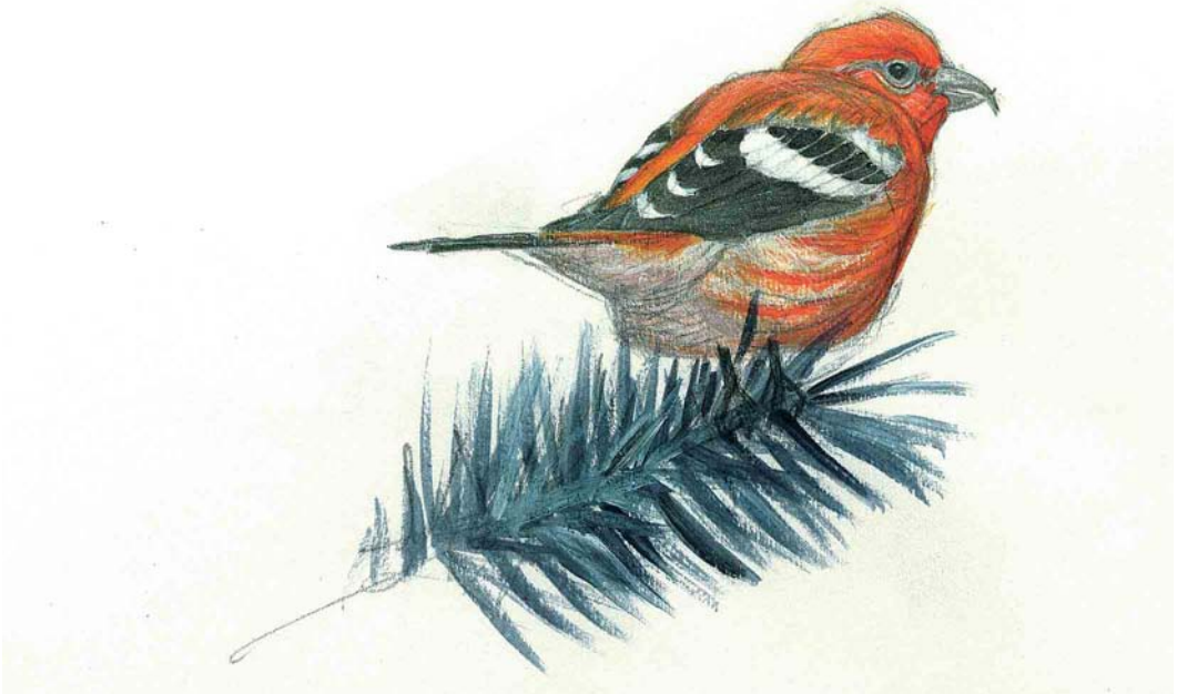
FIGURE 3 Two-barred Crossbill / Witbandkruisbek Loxia leucoptera bifasciata , male, Noordhollands Duinreservaat, Bakkum, Noord-Holland, 15 March 1998