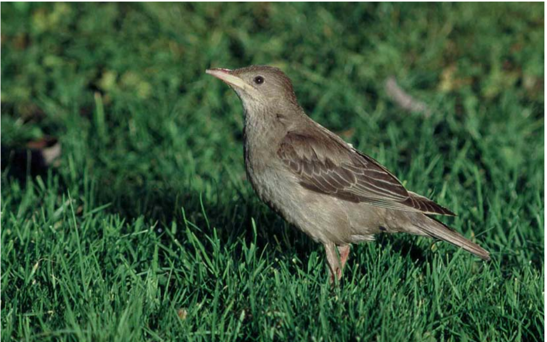
76 Rose-coloured Starling / Roze Spreeuw Sturnus roseus , juvenile, Anjum, Friesland, 1 December 1997 (Ruud E Brouwer)

(R Slaterus); 6 September, Westenschouwen, Westerschouwen , Zeeland, adult male, trapped and ringed (L van Ree, T van Ree, H van Buren); 15-26 September, Lunterse Bos, Ede , Gelderland, two, male and female-type, photographed (O Faulhaber, H Heerink; van den Berg & Bosman 1999; Dutch Birding 19: 259, plate 270, 1997, 21: 84, plate 79, 1999); 30 October to 31 January 1998, Oranje-Nassau's Oord, Wageningen , Gelderland, maximum 16 on 27 December, photographed, sound-recorded, videoed (H van Oosterhout, W M Wiegant et al; Dutch Birding 19: 311, plate 314, 1997); 15 November, Corversbos, Hilversum , Noord-Holland, 15 (F van Klaveren et al); 2 December to 29 January 1998, IJzeren Veld, Huizen , Noord-Holland, maximum of 22 on 13 December, photographed, sound-recorded (R F J van Beusekom et al); 5 December to 12 January 1998, Kuinderbos , Noordoostpolder, Flevoland, maximum of 18 on 21 December, photographed (S Bernardus, M Berlijn, R Offereins; Dutch Birding 21: 85, plate 80-81, 1999); 20 December, Kwinteloaien, Rhenen , Utrecht, female (R Keizer); 25 December to 25 July 1998, Opsterland , Friesland, at least four between 25 and 30 December, maximum of 16 on 5 January 1998, photographed (K Haas, L Davids, O Tol et al; Dutch Birding 21: 85, plate 82, 1999); 28 December, Doldersum, Vledder , Drenthe, 25 (M Swart); 29 December, Groet, Schoorl , Noord-Holland, three, including one male, sound-recorded (R Slaterus).