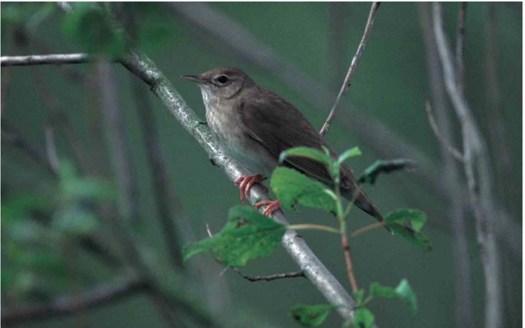
74 River Warbler / Krekelzanger Locustella fluviatilis , Pampushout, Flevoland, May 1997 (Peter van Rij)