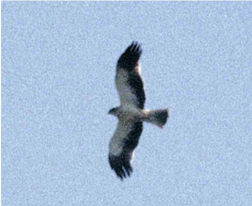
62 Booted Eagle / Dwergarend Hieraaetus pennatus , pale morph, Beek-Ubbergen, Gelderland, 17 July 1996 (Ward Hagemeyer)