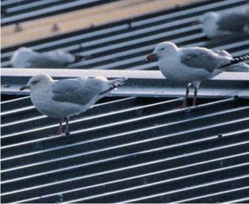
96 Kumlien's Gull / Kumliens Meeuw Larus glaucooides kumlieni , Killybegs, Donegal, Ireland, March 1999