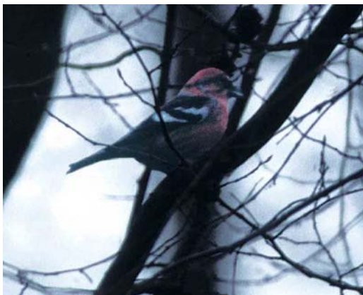
80 Two-barred Crossbill / Witbandkruisbek Loxia leucoptera bifasciata , male, Kuinderbos, Flevoland, 14 December 1997 (Sietse Bernardus)