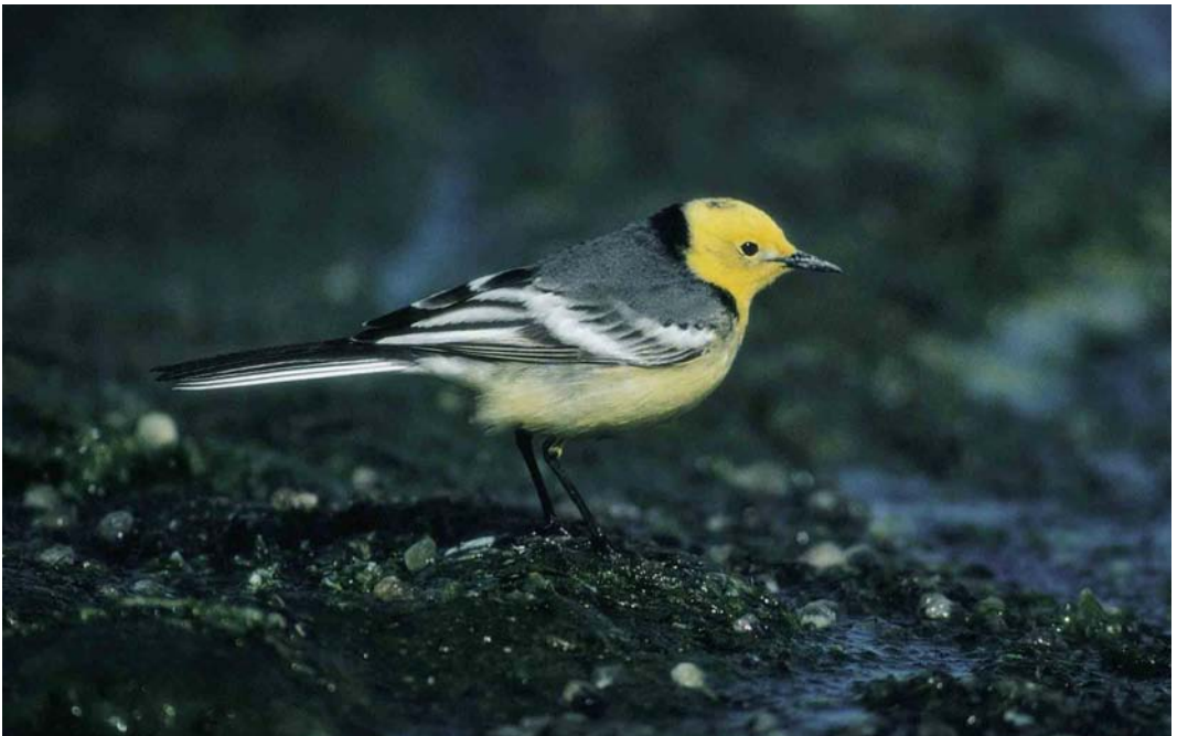
98 Citrine Wagtail / Citroenkwikstaart Motacilla citreola , male, Eilat, Israel, 12 March 1999

On 18 March, the first Pallas's Gull Larus ichthyaetus for Belgium was an adult photographed during its three minutes stay at Gullegem, West-Vlaanderen. The first Grey-headed Gull L cirrocephalus for Egypt was an adult winter reported on 7 February at Nabaq in the southern Sinai. If accepted, an adult Armenian Gull L armenicus at Siracusa dump, Sicily, Italy, on 2 March will be the second for Italy. In Ireland, at least three first-winter and two adult American Herring Gulls L smithsonianus were present during March at Killybegs, Donegal; also in March, at the same site, at least three Kumlien's Gulls L glaucoides kumlieni were seen. The third, fourth and fifth Caspian Terns Sterna caspia for the Cape Verde Islands were reported between 21 February and 14 March on Boavista, off Raso, and on São Vicente, respectively. A first-winter Forster's Tern