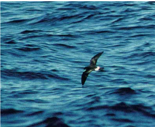
88-89 Madeiran Storm-petrel / Madeirastormvogeltje Oceanodroma castro, off Salvage Islands, August 1997