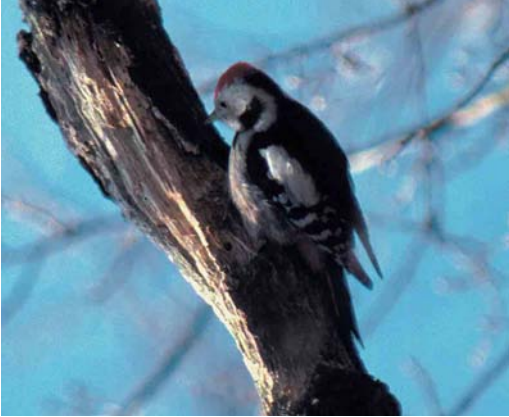
65 Middle Spotted Woodpecker / Middelste Bonte Specht Dendrocopos medius , Elzetterbos, Epen, Wittem, Limburg, 22 maart 1997