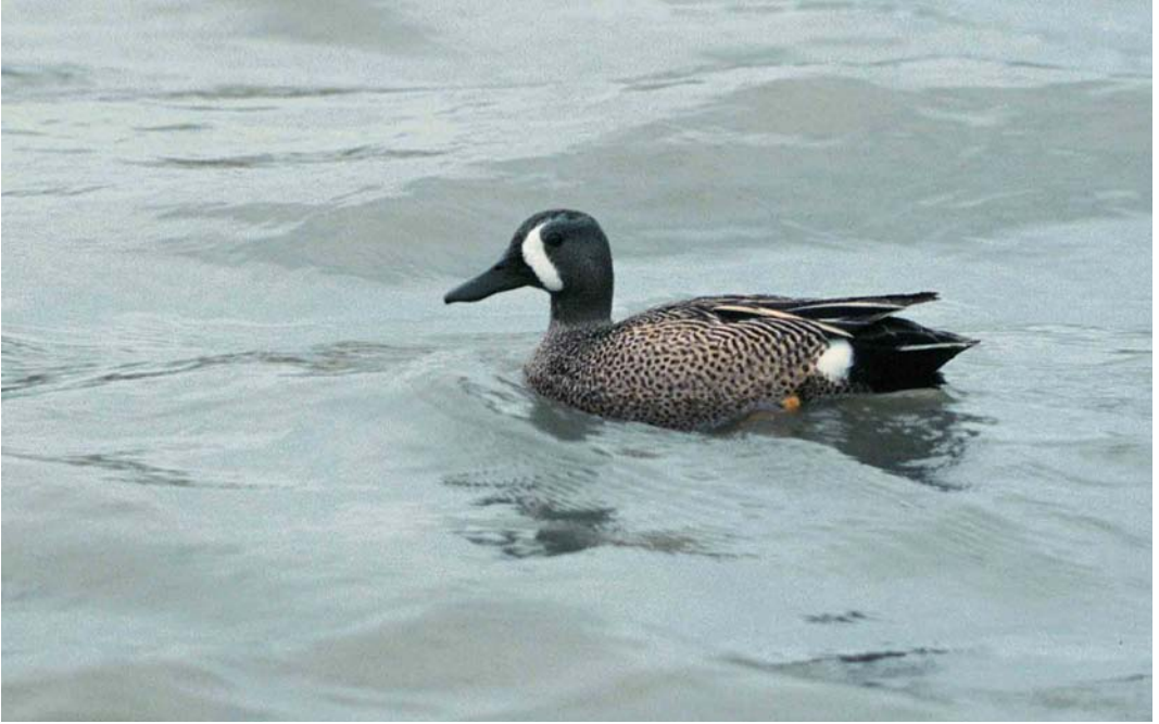
56 Blue-winged Teal / Blauwvleugeltaling Anas discors , adult male, Oostvaardersplassen, Flevoland, April 1997 (Ruud E Brouwer) 57 Whistling Swan / Fluitzwaan Cygnus columbianus with Bewick's Swan / Kleine Zwaan C. bewickii , Anloo, Drenthe, 28 December 1997 (Jan van Holten) 58 Greenland White-fronted Goose / Groenlandse Kolgans Anser albifrons flavirostris , Doniaburen, Friesland, 9 November 1997 (Arnoud B van den Berg)