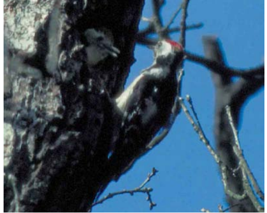
66 Middle Spotted Woodpeckers / Middelste Bonte Spechten Dendrocopos medius , Posterholt, Ambt Montfort, Limburg, June 1997 (Jan van Holten)