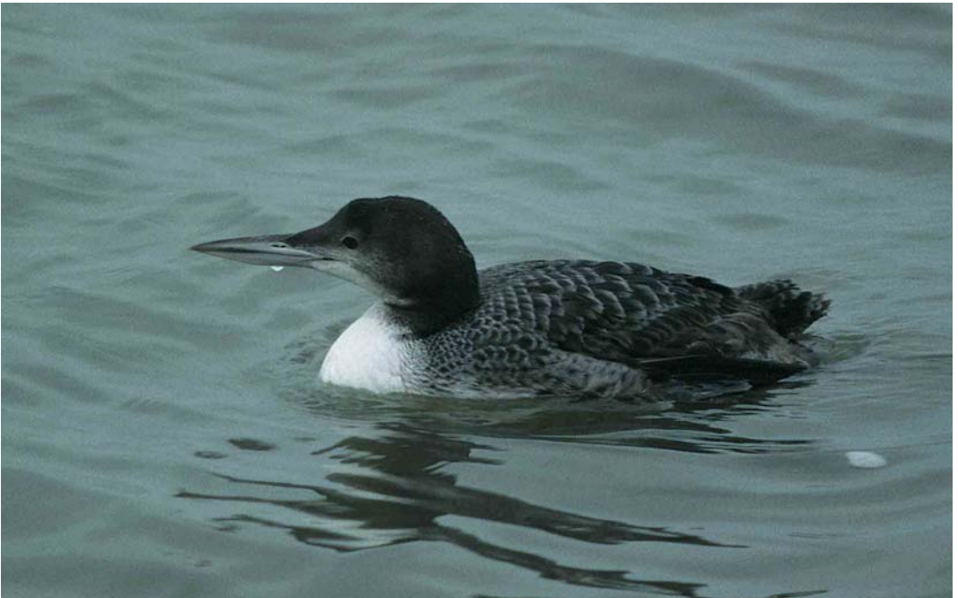
100 Ijsduiker / Great Northern Loon Gavia immer , eerste-winter, De Blocq van Kuffeler, Flevoland, 5 maart 1999 (Mark Nieuwenhuis)