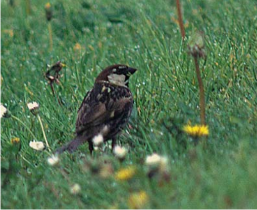
75 Spanish Sparrow / Spaanse Mus Passer hispaniolensis , male, De Cocksdoorp, Texel, Noord-Holland, 5 May 1997 (René Pop)

Terschelling , Friesland, male, caught by hand, photographed, released on 13 September at Franeker, Friesland (family Harsta; Dutch Birding 21: 83, plate 78, 1999); 21 August, Willemsduin, Schiermonnikoog , Friesland, adult male, caught by hand and released (H-G Folz, J Rosenbaum-Folz); 6 September Oost-Vlieland, Vlieland , Friesland, sound-recorded