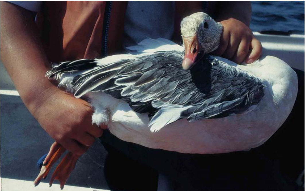
85 Sneeuwgangs / Snow Goose Anser caerulescens , Smålø, Trondheim, Noorwegen, 13 juli 1997 (Yngve Lystad)

Van 18 tot 26 april 1980 bevonden zich 18 Sneeuwganzen (13 witte en één blauwe adult en vier onvolwassen) bij Andijk, Noord-Holland. Eén van de witte vogels was geringd; deze bleek in 1977 als kuiken te zijn geringd in La Pérouse Bay, Manitoba, Canada. Het betrof een mannetje Kleine Sneeuwgangs (Blankert 1980). Samen met een aantal recente terugmeldingen van in Noord-Amerika gehalsringde canadese ganzen Branta canadensis parvipes/B hutchinsii uit Ierland en