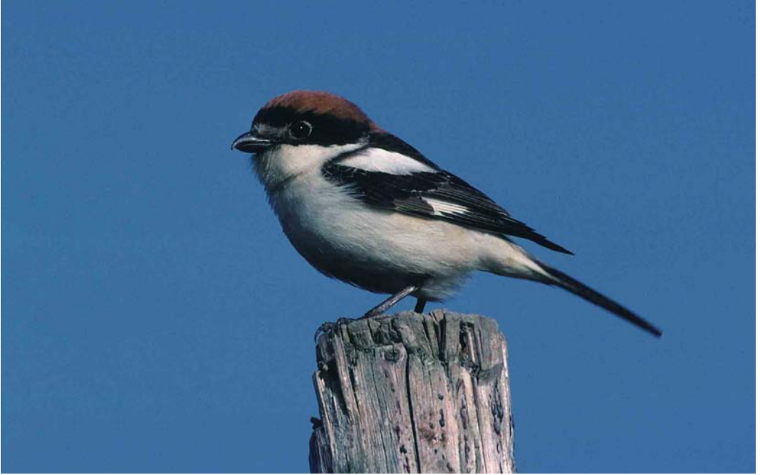
73 Woodchat Shrike / Roodkopklauwier Lanius senator , male, Hornhuizen, Groningen, 25 May 1997