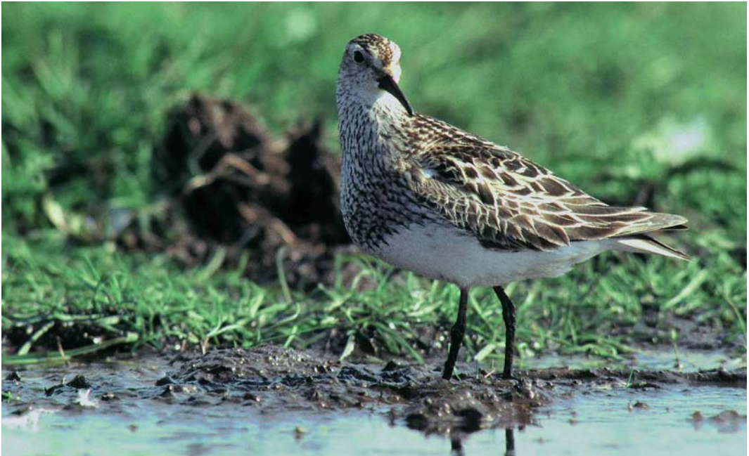
64 Pectoral Sandpiper / Gestreepte Strandloper Calidris melanotos , adult, Wormer- en Jisperveld, Noord-Holland, 10 July 1997 ( Jan van der Geld )

The first, but in retrospect the second record for the Netherlands, concerned a confiding individual which took up residence in the city of Groningen, for obvious reasons close to a McDonald's restaurant. After thorough study of the moult of the Groningen individual, several observers demanded review of the rejected 1993 record which was documented by a number of (poor-quality) photographs. One of the reasons for rejection of that record were the very short primaries, but CDNA now has decided that this can well be attributed to moult. Therefore, the Harderwijk record becomes the first.