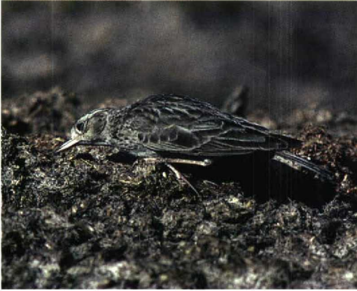
137 Oriental Lark / Kleine Veldleeuwerik Alauda gulgula , Eilat, Israel, 2 April 1993