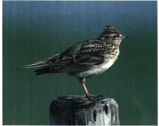
138 Sky Lark / Veldleeuwerik Alauda arvensis , Grevelingendam, Zuid-Holland, Netherlands, April 1993

area on the lores, some dark malar striping and often a dark half-ring below the eye, which are all lacking in the mystery bird; Wood can be excluded because this species should show a different, more striking head-pattern with a longer supercilium. Therefore, the mystery bird must be either a Sky Lark or an Oriental Lark.