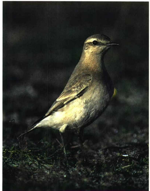
122 Desert Wheatear / Woestijntapuit Oenanthe deserti , first-winter male, Westernieland, Groningen, December 1996 123 Isabelline Wheatear / Izabeltapuit Oenanthe isabellina , Maasvlakte, Zuid-Holland, 23 October 1996 124 Booted Warbler / Kleine Spotvogel Acrocephalus caligatus , Katwijk aan Zee, Zuid-Holland, 10 September 1996