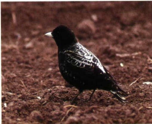
112 Black Lark / Zwarte Leeuwerik Melanocorypha yeltoniensis , male, Karlstad, Värmland, Sweden, May 1993 (Dan Zetterström)

(two), Saarijärvi and Orivesi. On 25 May, a River Warbler L. fluviatilis was trapped on Fair Isle, Shetland, and was last seen on 27 May. In Belgium, one was singing at Schulen, Limburg, on 30-31 May. In south-eastern Norway, three singing birds were found from 31 May to mid-June. The second Paddyfield Warbler Acrocephalus agricola for Hong Kong was seen at Nam Sang