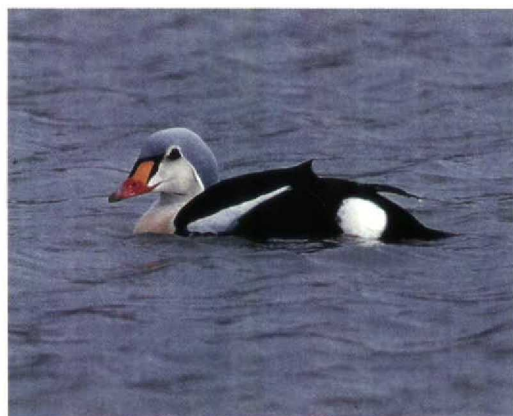
88 Pallid Harrier / Steppekiekendief Circus macrourus , third-year male, Vlissingen, Zeeland, 5 September 1991 (Rob Sponselee) 89 Dusky Warbler / Bruine Boszanger Phylloscopus fuscatus , second-year, Terschelling, Friesland, 9 November 1990 (Lammert van der Veen) 90 Great Spotted Cuckoo / Kuiikoekoek Clamator glandarius , second-year, Lelystad, Flevoland, 4 April 1991 (Allan Liosi) 91 Black-eared Wheatear / Blonde Tapuit Oenanthe hispanica , female, Rottumeroog, Groningen, 6 June 1991 (Wim Steenge) 92 Lesser Yellowlegs / Kleine Geelpootruiter Tringa flavipes , adult winter, Flauwers Inlagen, Zeeland, 9 October 1991 (Hans Gebuis) 93 King Eider / Koningseider Somateria spectabilis , Hoek van Holland, Zuidholland, 16 February 1991 (René van Rossum)