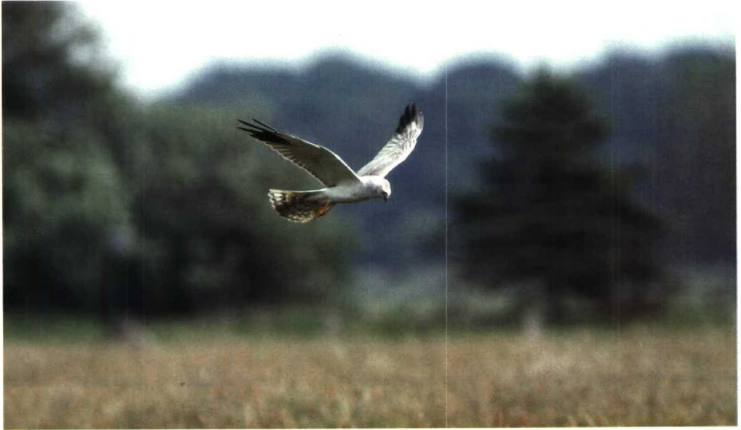
111 Pallid Harrier / Steppekiekendief Circus macrourus , male, Worpsswede, Niedersachsen, Germany, May 1993 (Axel Halley)

(two), Saarijärvi and Orivesi. On 25 May, a River Warbler L. fluviatilis was trapped on Fair Isle, Shetland, and was last seen on 27 May. In Belgium, one was singing at Schulen, Limburg, on 30-31 May. In south-eastern Norway, three singing birds were found from 31 May to mid-June. The second Paddyfield Warbler Acrocephalus agricola for Hong Kong was seen at Nam Sang