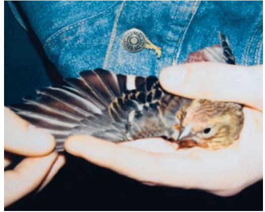
192-193 Pallas's Rosefinch / Pallas' Roodmus Carpodacus roseus , female or first-year male, Tsivil district, republic of Chuvashia, Russia, 9 December 1995 (A Yakovlev)

Chuvashia, female or first-year male, trapped by A Ksenofontov (plate 192-193). This record was accepted by the regional Middle Volga ornithological records committee. The man who trapped the bird claimed he saw other Pallas's Rosefinches at the same location some two weeks later (Sotnikov 2008, Isakov et al 2009; Oleg Borodin in litt, Vladimir Yakovlev in litt).