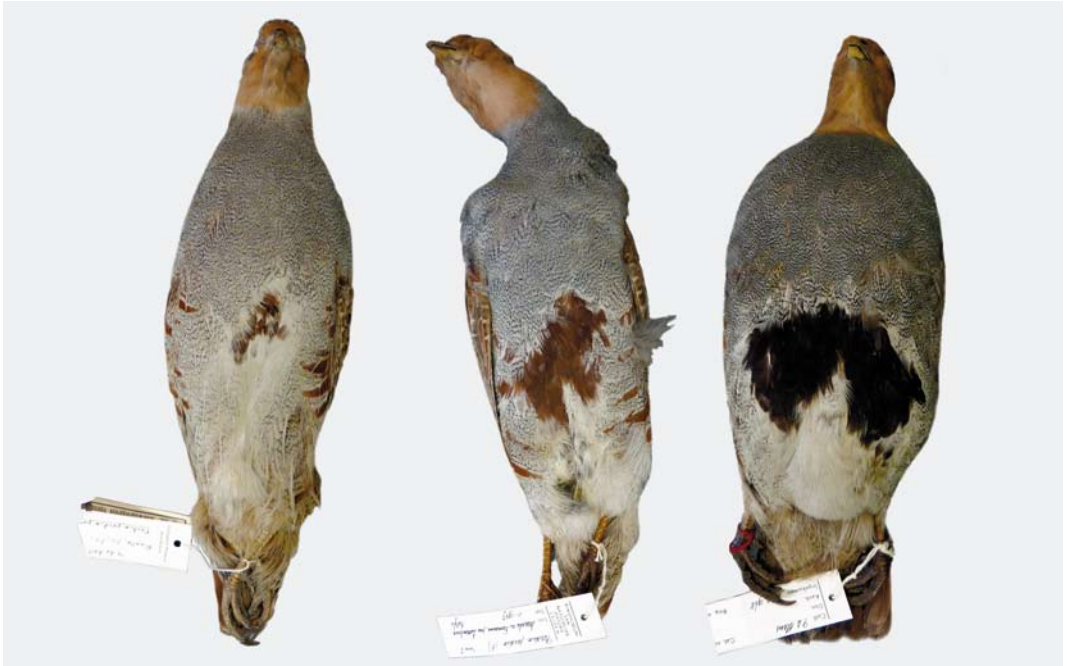
FIGURE 6 Grey Partridges / Patrijzen Perdix perdix , males, Naturalis Biodiversity Centre, Leiden, Netherlands, 28 December 2011. From left to right: collected at Raalte, Overijssel, Netherlands, on 14 December 1925; Marche-en-Famenne, Luxembourg, Belgium, on November 1947; and Westerwolde, Groningen, Netherlands, on 31 December 1933. These birds illustrate (from left to right) minimum, mean and maximum belly patch size in males in our sample.

dix and 54% to sphagnetorum ; however, when following 'traditional', 69% of the birds are perdix and 31% sphagnetorum . In either case, the number of sphagnetorum is sufficiently large to allow a good comparison. 54% of the birds used in the analysis are male and 46% female.