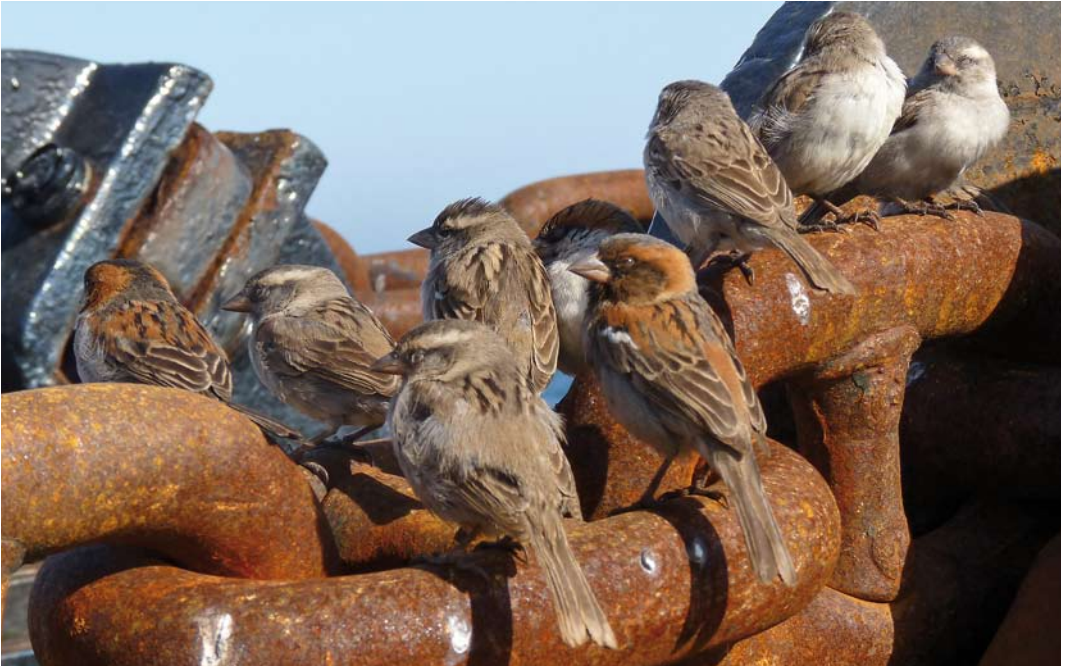
251 Iago Sparrows / Kaapverdise Mussen Passer iagoensis , on board of MV Plancius, Atlantic Ocean between Cape Verde Islands and Desertas, Hansweert, Zeeland, Netherlands, 8 May 2013 252 Iago Sparrows / Kaapverdise Mussen Passer iagoensis , male (front) and female, on board of MV Plancius, Hansweert, Zeeland, Netherlands, 19 May 2013. Ship-assisted arrivals from Raso, Cape Verde Islands.