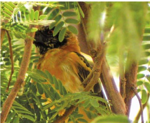
427-428 Village Weaver / Grote Textorwever Ploceus cucullatus , male, presumably adult, Abu Simbel, Egypt, 1 May 2006. Compare claw length with plate 430-431.

During researches about this sighting, it became apparent that what was probably the same bird had been seen on 2 April 2006 'near the blue factory along lake Nasser 500 m outside Abu Simbel' (apparently the area south of 'airport bay') by Erik Forsyth, leading a Rockjumper birding tour. The sighting was brief and no detailed description or photograph could be taken but EF identified the bird as a non-breeding male Village Weaver, a species he was very familiar with. Compared with the photographs taken on 1 May, the bird (assuming it was the same individual) was noted as less black on the face and not as bright yellow. Note that, given the lack of documentation, this April report remains unconfirmed.