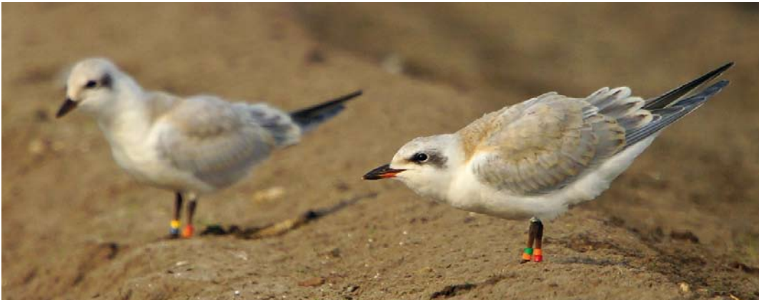
474 Grote Burgemeester / Glaucous Gull Larus hyperboreus , tweede-zomer, Osdorp, Amsterdam, Noord-Holland, 6 september 2012 475 Kleinste Jager / Long-tailed Jaeger Stercorarius longicaudus , juveniel, Kinderdijk, Zuid-Holland, 22 augustus 2012 476 Lachsterns / Gull-billed Terns Gelochelidon nilotica , juveniele, Keinsmerbrug, Noord-Holland, 28 augustus 2012

Vooral twee tamme juveniele van 28 tot 31 augustus op een parkeerplaats bij Hargen aan Zee, Noord-Holland, trokken veel bekijks. Een Amerikaanse Goudplevier Pluvialis dominica verbleef van 17 juli tot 18 augustus in de omgeving van Serooskerke. Aziatische Goudplevieren P. fulva werden gemeld op 3 en 4 juli in Mariëndal bij Den Helder, Noord-Holland; op 8 en 10 juli bij De Cocksdorp op Texel; van 21 tot 23 maximaal twee in de Slufter op Texel; op 31 juli en 1 augustus opnieuw twee in Waal en Burg op Texel; en op 16 augustus in de Ezumakeeg, Friesland. Het is onduidelijk hoeveel vogels er in het spel waren. Een Bonapartes Strandloper Calidris fuscicollis verbleef op 28 juli in de Sophiapolder bij Oostburg, Zeeland. Een tamme juveniele Bairds Strandloper C. bairdii die op 27 augustus werd gefotografeerd op het strand bij Wassenaar, Zuid-Holland, was daar tot groot genoegen van veel vogelaars ook op 29 en 30 augustus te zien. Het betrof alweer de derde twitchbare binnen een jaar. Op zeven plekken in het noorden en