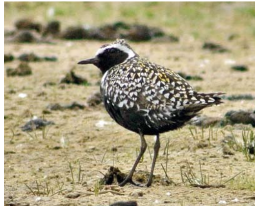
470 Blonde Ruiter / Buff-breasted Sandpiper Tryngites subruficollis , Prunjepolder, Zeeland, 22 augustus 2012 (Thomas Luiten) 471 Blonde Ruiter / Buff-breasted Sandpiper Tryngites subruficollis , Utopia, Texel, Noord-Holland, 3 augustus 2012 (Jos van den Berg) 472 Amerikaanse Goudplevier / American Golden Plover Pluvialis dominica , Schelphoek, Burgh-Haamstede, Zeeland, 25 juli 2012 (Harm Niesen) 473 Aziatische Goudplevier / Pacific Golden Plover Pluvialis fulva , Mariëndal, Den Helder, Noord-Holland, 4 juli 2012 (Harm Niesen)

ties waren voor langere tijd twee exemplaren aanwezig. Ook op een handvol andere plekken werd de soort gemeld. Het tweede-kalenderjaar mannetje Steppekieken-dief Circus macrourus dat vanaf 13 mei bij Exloo, Drenthe, verbleef, werd voor het laatst op 5 september gemeld. Het betrof de eerste overzomeraar voor Nederland. Intrigerend waren de meldingen rond half juli van twee adulte en twee juveniele Visarenden boven het Veluwemeer bij Biddinghuizen, Flevoland. Een donkere valk Falco die op 17 augustus werd gefotografeerd in Nationaal Park de Meinweg bij Roermond, Limburg, betrof mogelijk een Eleonora's Valk F. eleonora ; opmerkelijk was dat twee dagen eerder een donkere vorm Eleonora's Valk werd gemeld over de Duitse grens bij Viersen, Nordrhein-Westfalen, c 20 km naar het noordoosten. Het was een goed najaar voor Porseleinhoen Porzana porzana . Op diverse plekken doken vooral in augustus groepjes op, zoals minstens 16 bij Zevenhuizen,