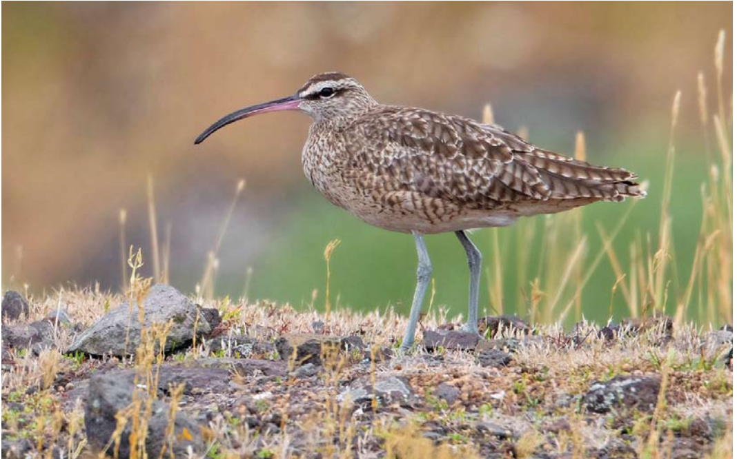
447 Hudsonian Whimbrel / Amerikaanse Regenwulp Numenius hudsonicus , Cabo da Praia, Terceira, Azores, 29 July 2012 ( Vincent Legrand ) 448 Stilt Sandpiper / Steltstrandloper Calidris himantopus , adult, Le Teich, Gironde, France, 11 August 2012 ( Joris Grenon ) 449 American Golden Plover / Amerikaanse Goudplevier Pluvialis dominica , Achill Island, Mayo, Ireland, 16 September 2012 ( Richard Bonser )