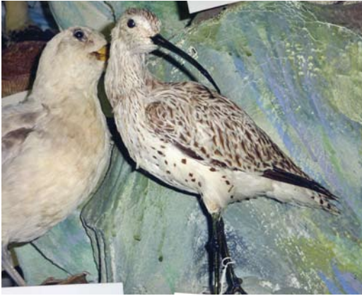
426 Dunbekwulp / Slender-billed Curlew Numenius tenuirostris (verzameld te Zierikzee, Zeeland, op 5 december 1888), Missiemuseum te Steijl, Venlo, Limburg, 9 augustus 2011 (Justin J F Jansen)

Zierikzee en werkte daar bij het gerechtshof.