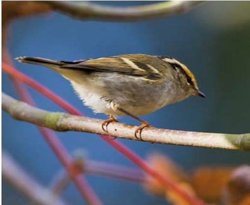
86 Pallas' Boszanger / Pallas's Warbler Phylloscopus proregulus , Ganzenhoek, Wassenaarse Slag, Zuid-Holland, 30 oktober 2010