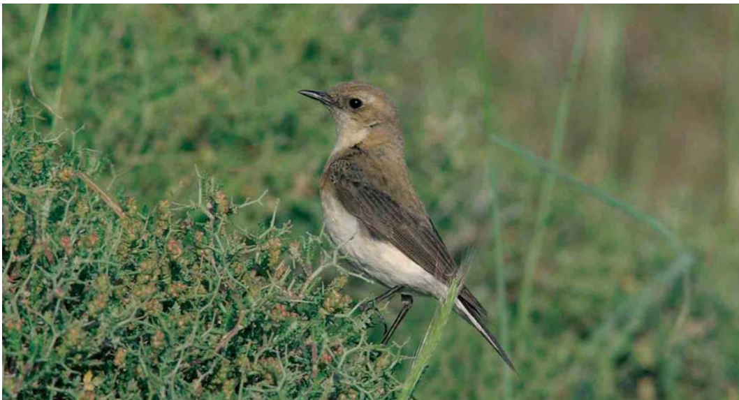
87 'Black-eared wheatear' / 'blonde tapuit' Oenanthe hispanica/melanoleuca , female, Lesvos, Greece, April 2002 (René Pop). Lack of any obvious black tones to ear-coverts or wings shows this to be a female rather than an immature male. While some hispanica have an ochre or russet tone to the upperparts and some melanoleuca are darker, more obviously deep brown, birds like this one occur in both taxa. Since the photograph is taken on Lesvos, it is most likely melanoleuca but it is not possible to identify a vagrant displaying a similar appearance.