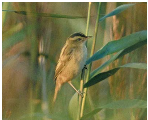
240 Ralreiger / Squacco Heron Ardeola ralloides , Egmond-Binnen, Noord-Holland, 8 juni 2000 (Cees Baart) cf Dutch Birding 22: 174, 2000 241 Steppiekievit / Sociable Lapwing Vanellus gregarius , Oosterwolde, Gelderland, 6 augustus 2000 (Eric Koops) 242-243 Steltstrandloper / Stilt Sandpiper Micropalama himantopus , adult, Sint Maartenszee, Noord-Holland, 23 juli 2000 (Teus J C Luijendijk) 244 Graszangeter / Zitting Cisticola Cisticola juncidis , Ooltgensplaat, Zuid-Holland, 27 juni 2000 (Marten van Dijl) 245 Waterrietzanger / Aquatic Warbler Acrocephalus paludicola , Westplaat, Zuid-Holland, 8 augustus 2000 (Marten van Dijl)