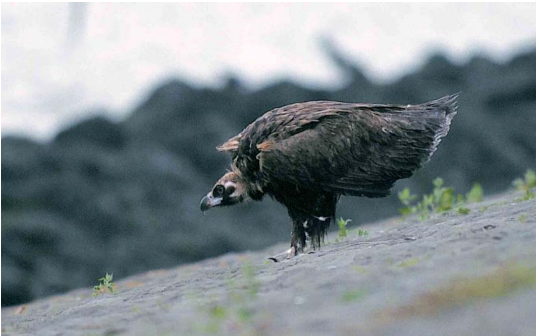
237 Monniksgier / Eurasian Black Vulture Aegypius monachus , onvolwassen, Den Oever, Noord-Holland, 26 juli 2000 ( René Pop )