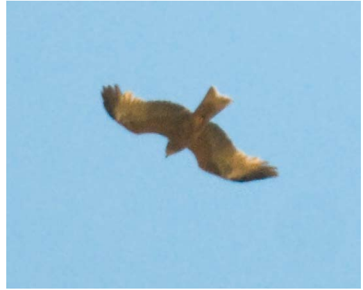
190-191 Yellow-billed Kite / Geelsnavelwouw Milvus aegyptius , Tizi-n-Tichka, High Atlas, Morocco, 8 April 2008 (Arnoud B van den Berg)

bill is sometimes blackish (Ferguson-Lees & Christie 2005). The possibility of a hybrid Black x Red could be ruled out because, for instance, the bird's features like tail length and underwing pattern, were not intermediate. Dick Forsman (in litt) responded that, judging from the photographs, the bird looked like an eastern African nominate rather than a M a parasitus from central and western Africa. Like our bird, Egyptian birds are redder and more uniformly coloured than western African ones, which are nearer to European Black Kite M m migrans in colour.