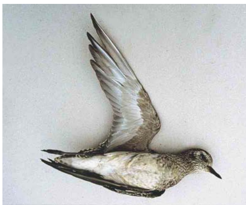
146-147 Amerikaanse Goudplevier / American Golden Plover Pluvialis dominica , eerste-winter, Hindeloopen, Friesland, 8 december 2003

bovendelen met mantel, rug, en schouderveren waren zwart met kleine vuilwitte stippen en met enkele gele stipjes. De kop was donker met contrasterende witgrijze wenkbrauwstreep. De volgende biometrische gegevens zijn verzameld: vleugellengte 187 mm, tarsuslengte 41.1 mm, snavellengte 22.1 mm, lengte van snavel en kop 57.5 mm, handpenprojectie 6/7 en gewicht 155 g.