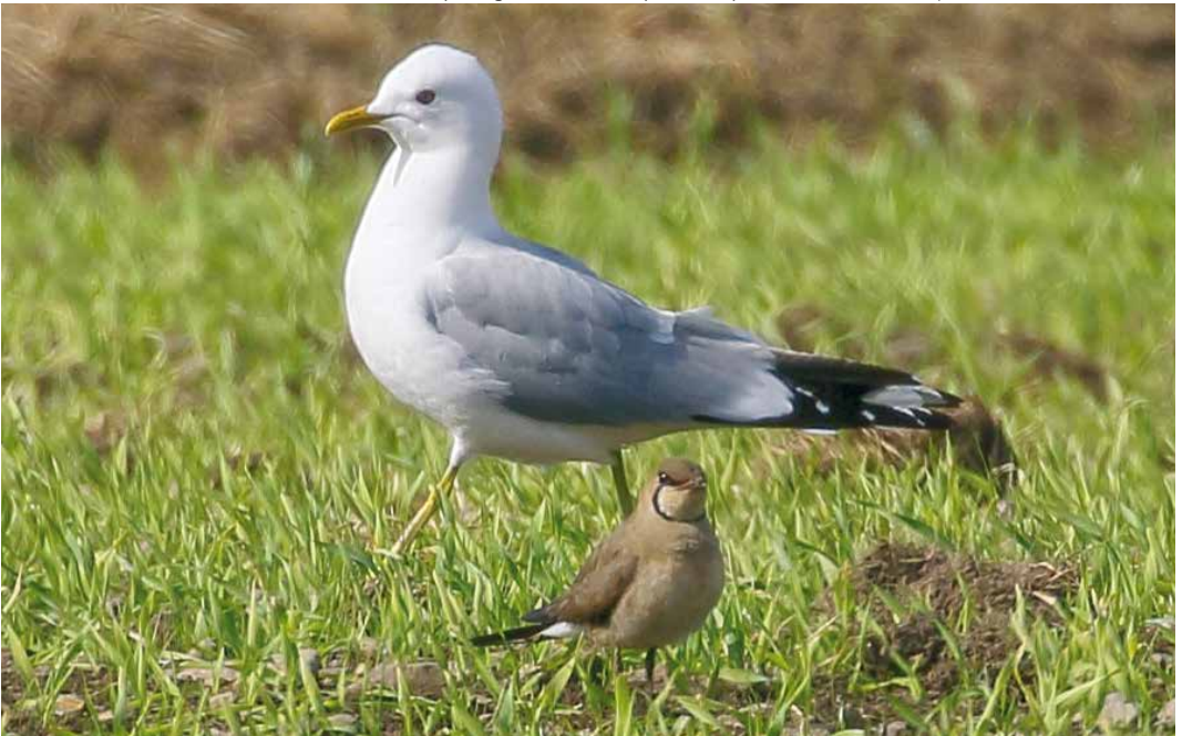
347 Oriental Pratincole / Oosterse Vorkstaartplevier Glareola maldivarum , with Common Gull / Stormmeeuw Larus canus , Hillesland, Karmøy, Rogaland, Norway, 27 May 2019