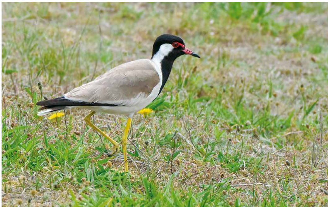
358 Red-wattled Lapwing / Indische Kievit Vanellus indicus , De Tuintjes, De Cocksdorp, Texel, Noord-Holland, Netherlands, 19 June 2019