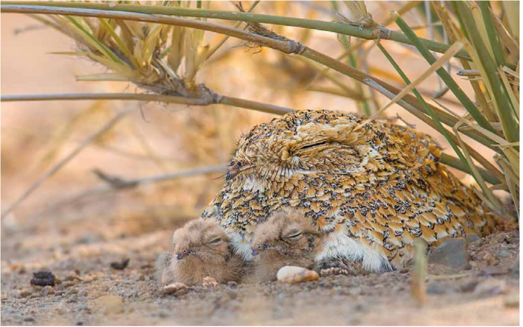
334-335 Golden Nightjars / Goudgele Nachtzwaluwen Caprimulgus eximius , female with two chicks, Oued Chiaf, c 55 km from Aousserd, Western Sahara, Morocco, 19 March 2019 (Felix Timmermann)