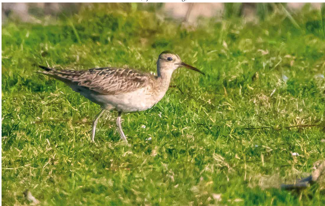
359 Little Curlew / Kleine Regenwulp Numenius minutus , Tofta Kile, Bohuslän, Sweden, 11 July 2019