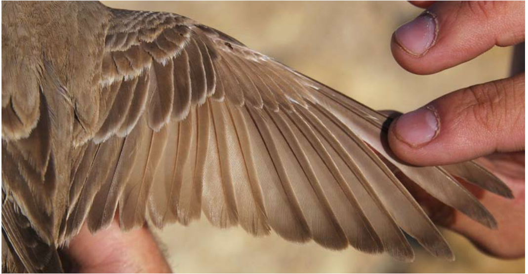
17 Pale Rockfinch / Bleke Rotsmus Carpospiza brachydactyla , adult, Negev, Israel, 9 June 2010 (Yoav Perlman). Note arrested wing moult.

nele regenval de katalysator kan zijn voor nomadisme in woestijnvogels, via de productiviteit van planten en insecten. Deze vorm van opportunisme als het gaat om broeden als reactie op unieke weersomstandigheden wijkt af van gebruikelijke strategieën die zijn gebaseerd op seizoenen. In het licht van de bedreigingen waar de Israëlische woestijnen aan bloot staan, is het begrip van de mechanismen rond het broeden van deze soorten erg belangrijk. De drie soorten broedden namelijk in waardevolle en kwetsbare habitats die zwaar onder druk staan door menselijk handelen.