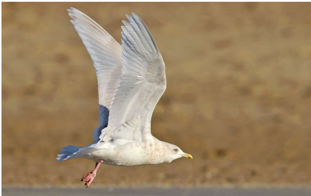
65 Kumlien's Gull / Kumliens Meeuw Larus glaucooides kumlieni , Zeebrugge, West-Vlaanderen, Belgium, 16 January 2012 ( Filip De Ruwe )