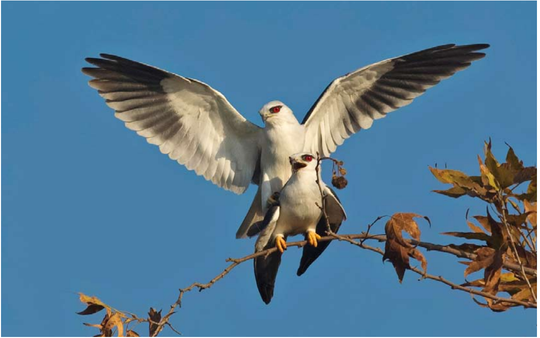
52 Black-winged Kites / Grijze Wouwen Elanus caeruleus , Agmon lake, Israel, 27 November 2011 ( Rony Livne ) cf Dutch Birding 33: 398, 2011 53 Greater Yellowlegs / Grote Geelpootruiter Tringa melanoleuca , first-year, Hauxley, Northumberland, England, 18 November 2011 ( James A Hanlon ) 54 Gyr Falcon / Giervalk Falco rusticolus , first-year, Oostburg, Zeeland, Netherlands, 7 January 2012 ( Pieter Dhaluin )