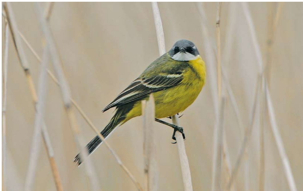
37-38 Witkeelkwikstaart / White-throated Wagtail Motacilla cinereocapilla , mannetje, Makkum, Friesland, 5 mei 2004 ( Bas van den Boogaard )