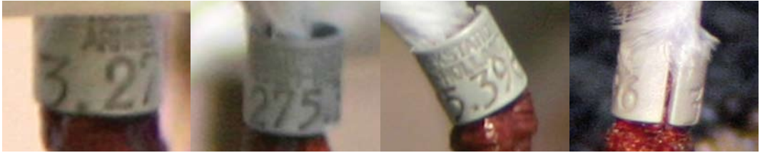
FIGURE 2 Aluminium ring Arnhem 3.275.396 on tibia of world's oldest Black-headed Gull Chroicocephalus ridibundus, Zoetermeer, Zuid-Holland, Netherlands, 16 March 2010 (far left) and 21 March 2011 (other three). Note almost absence of wear after more than 32½ years.