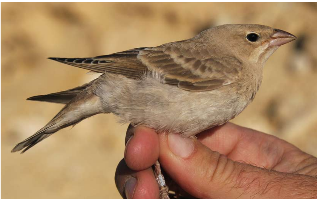
16 Pale Rockfinch / Bleke Rotsmus Carpospiza brachydactyla , juvenile, Negev, Israel, 9 June 2010 (Yoav Perlman)