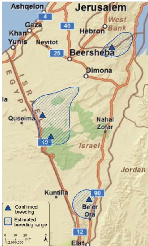
FIGURE 3 Breeding range of Pale Rockfinch Carpopsiza brachydactyla in Israel in spring 2010

Post-breeding birds concentrated at drinking spots in the high Negev mountains, where 100s were noted in June-July 2010. Ringing efforts here produced 73 ringed birds (60 juveniles and 13 adults). All adults showed a similar pattern of arrested moult, with one to three moulted primaries, and none to two moulted secondaries (plate 17).