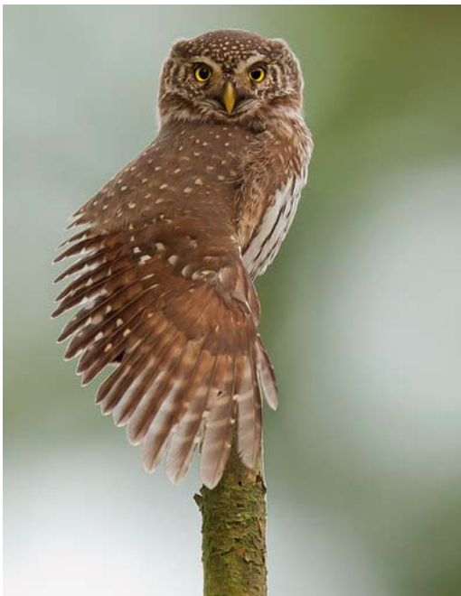
69 Eurasian Pygmy Owl / Dwerguil Glaucidium passerinum , Ullerup Skov, Nordsjælland, Denmark, December 2011

year). In Spain, an adult was photographed at Lires, Fisterra, A Coruña, on 28 December. The first and second Kumlien's Gulls L glaucooides kumlieni for Denmark, if accepted, were an adult at Blåvands Huk, Syddanmark, and a fourth calendar-year at Hanstholm, Thisted, Nordjylland, both found on 8 January. The second for Belgium was photographed at Zeebrugge, West-Vlaanderen, from 16 January. The adult Forster's Tern Sterna forsteri in Galway, Ireland, remained into January. On 28 December, eight African Skimmers Rynchops flavirostris were seen just south of Kom Ombo, Egypt.