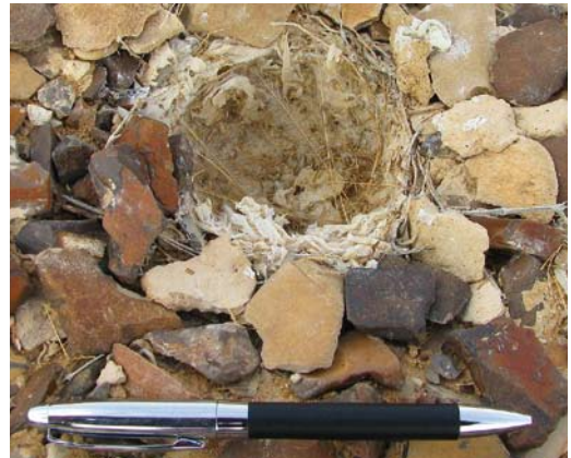
2 Thick-billed Larks / Diksnavelleeuweriken Ramphocoris clotbey , male and female in courtship display, Negev, Israel, 31 March 2010 (Thomas Krumenacker) 3 Thick-billed Lark / Diksnavelleeuwerik Ramphocoris clotbey , male with food for nestlings, Arava valley, Israel, 18 April 2010 (Yoav Perlman) 4 Nest of Thick-billed Lark / Diksnavelleeuwerik Ramphocoris clotbey after breeding, Arava valley, Israel, 10 May 2010 (Yoav Perlman)

Alterman & Barak Granit pers comm; plate 1). Such tight flocks of males have not been documented before. Another impressive concentration during this period occurred at Hameyshar plains with up to 250 birds in February 2011. This site had received large amounts of rain during the previous winter, and as a result large amounts of seeds remained on the ground and probably helped to support this large population.