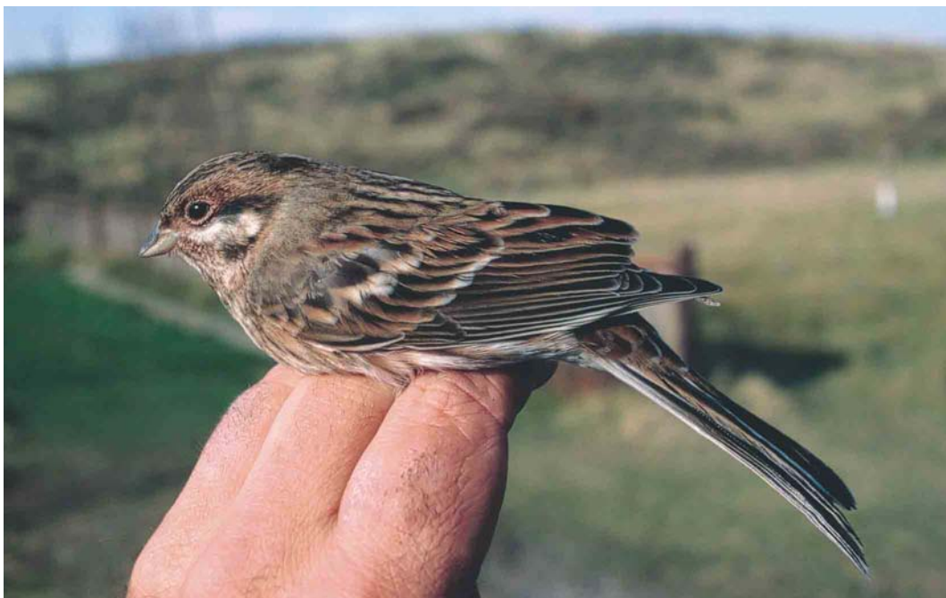
14 Pine Bunting / Witkopgors Emberiza leucocephalos , first-winter male, Kennemerduinen, Bloemendaal, Noord-Holland, Netherlands, 4 November 1987