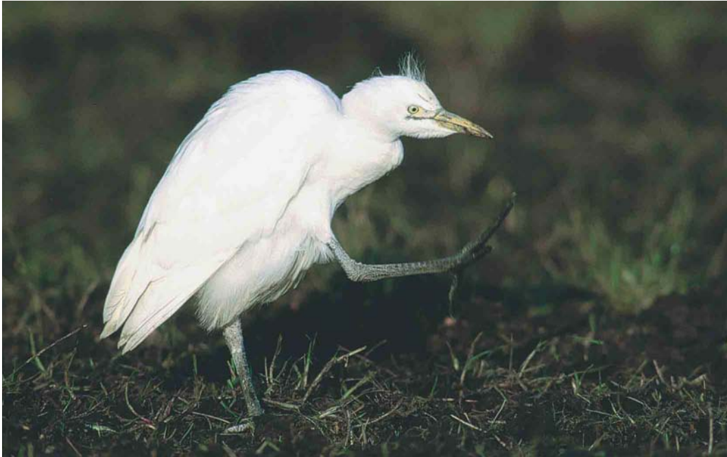
46 Koereiger / Cattle Egret Bubulcus ibis , Vlagtwedde, Groningen, 24 november 2002 (Eric Koops)