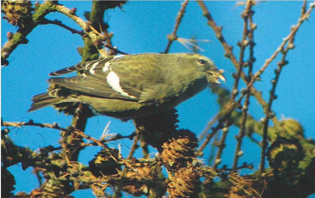
55 Witbandkruisbek / Two-barred Crossbill Loxia leucoptera bifasciata , vrouwtje, Zeven Linden, Baarn, Utrecht, 23 november 2002