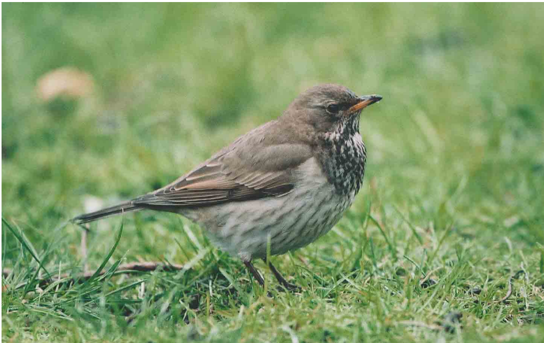
56 Zwartkeellijster / Black-throated Thrush Turdus ruficollis atrogularis , Harlingen, Friesland, 25 december 2002