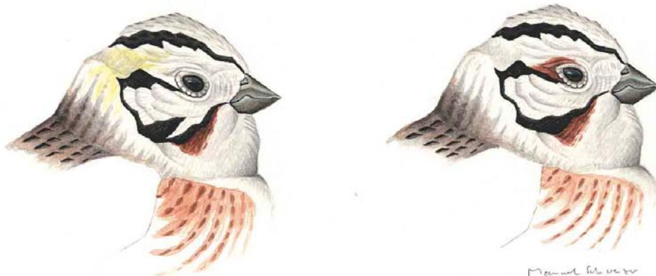
FIGURE 1 Hybrids Pine Bunting x Yellowhammer / Witkopgors x Geelgors Emberiza leucocephalos x citrinella , Fereydoon Kenar, Mazandaran province, Iran, 27 February 2001 (Manuel Schweizer)

lesser underwing-coverts; the median underwing-coverts were pale greyish, the greater underwing-coverts whitish and the axillaries white. Apart from this, no conclusive hybrid feature could be detected. The outermost pair of rectrices did not show a very large amount of white as would be typical for Pine Bunting. On the inner web, the blackish colour reached to c 2 cm from the tip (no exact measurement available). However, there is much variation in this feature and the differences are often useless on a single bird (Byers et al 1995).