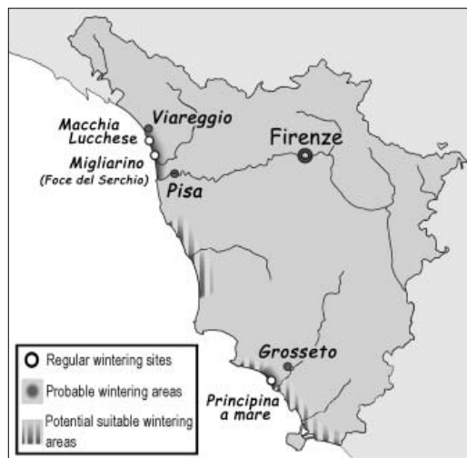
FIGURE 2 Distribution of Pine Bunting / Witkopgors Emberiza leucocephalos in Toscana, Italy. Dark areas show coastal tracts where Pine Bunting probably winters while small white circles show known regular wintering sites. Areas with pale-dark bands show potentially suitable wintering areas.

Camargue, Bouches-du-Rhône, France, it is likely to occur sporadically during migration and in winter.