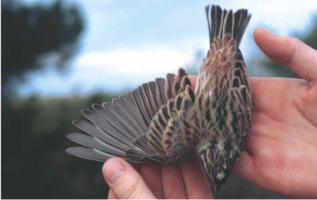
11 Pine Bunting / Witkopgors Emberiza leucocephalos , adult-winter male, Duna di Migliarino, Toscana, Italy, 17 December 1995. Note white crown and especially white forehead, with blackish-grey stripes.