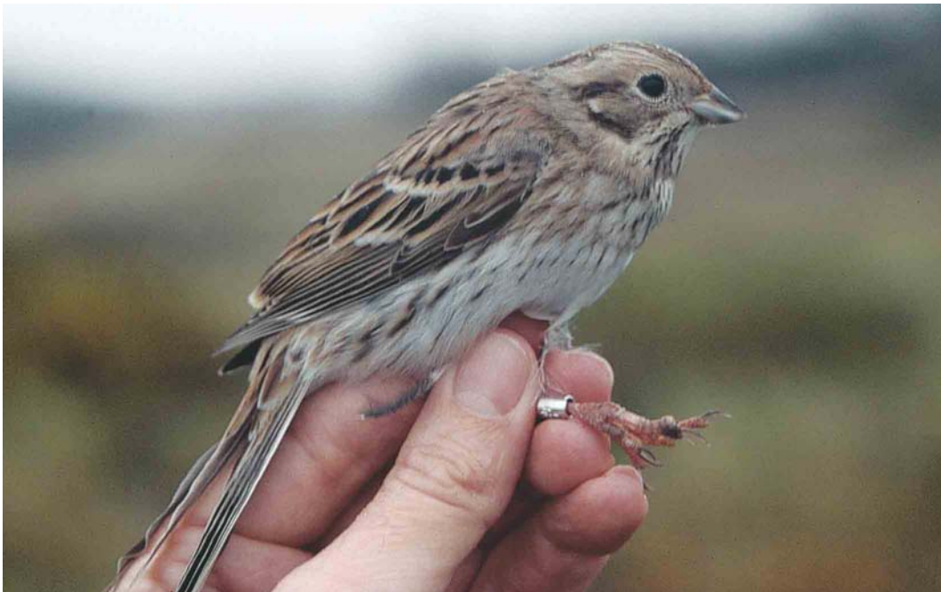
12 Pine Bunting / Witkopgors Emberiza leucocephalos , first-winter female, Castricum, Noord-Holland, Netherlands, 8 November 1999 ( Guido O Keijl )