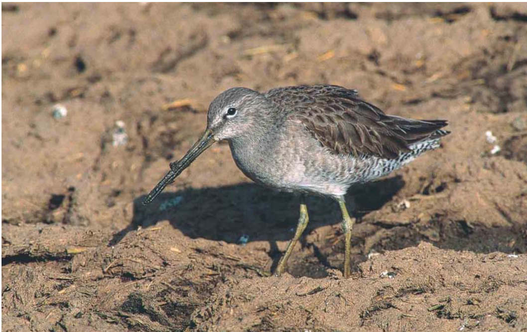
33 Long-billed Dowitcher / Grote Grijze Snip Limnodromus scolopaceus , adult, Sohar, Oman, 10 December 2002 (Ray Tipper)