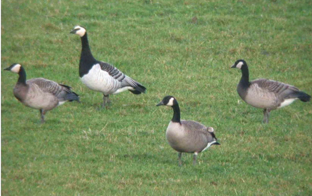
32 Intermediate Canada Goose / Middelste Canadese Gans Branta canadensis parvipes , with Barnacle Goose / Brandgans B leucopsis and hybrids Intermediate Canada x Barnacle Goose, Islay, Argyll, Scotland, November 2002