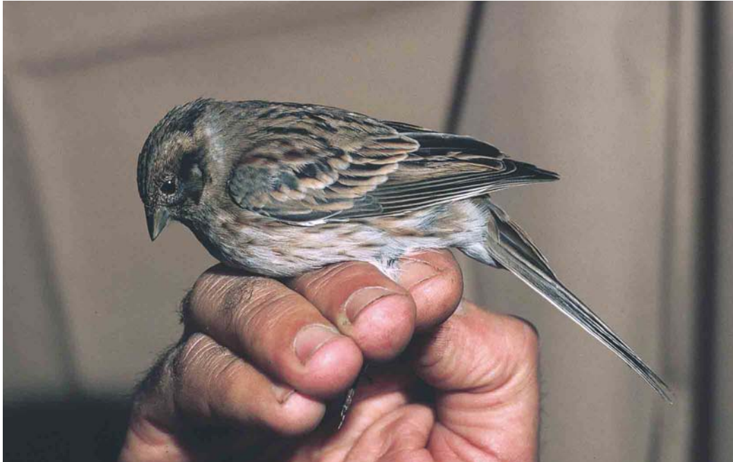
13 Pine Bunting / Witkopgors Emberiza leucocephalos , first-winter male, Westenschouwen, Zeeland, Netherlands (trapped on 19 October 1987), 29 October 1987