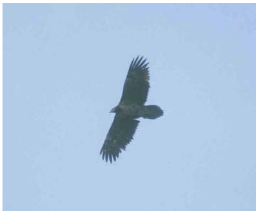
169 Lammergier / Lammergeier Gypaetus barbatus , onvolwassen, Texel, Noord-Holland, 3 juni 2002

Eerdere gevallen van in gevangenschap geboren en