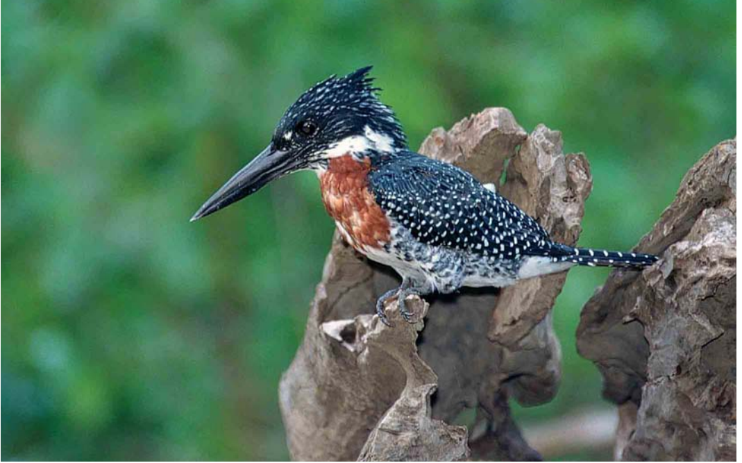
124 Giant Kingfisher / Afrikaanse Reuzenijsvogel Megaceryle maxima, Nazinga Game Ranch, Burkina Faso, 28 May 2000