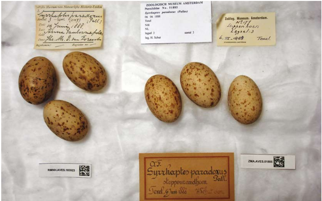
107 Legsels van Steppenhoer / Pallas's Sandgrouse Syrnhaptes paradoxus (verzameld op Texel, Noord-Holland, op 6 juni 1888 (rechts) en te Anna-Paulownapolder, Noord-Holland, op 19 juni 1888), Naturalis Biodiversity Center, Leiden, Zuid-Holland, 13 november 2013