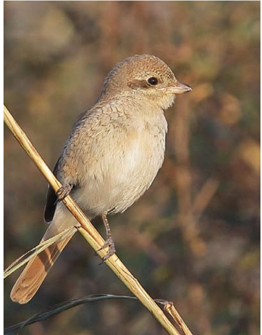
89 Afrikaanse Woestijngrasmus / African Desert Warbler Sylvia deserti , Polder Gnephoek, Alphen aan den Rijn, Zuid-Holland, 28 november 2014 90 Vermoedelijke Turkestaanse Klauwier / presumed Red-tailed Shrike Lanius phoenicuroides , eerstejaars, Noordhollands Duinreservaat, Castricum, Noord-Holland, 21 november 2014 91 Vermoedelijke Turkestaanse Klauwier / presumed Red-tailed Shrike Lanius phoenicuroides , eerstejaars, Noordhollands Duinreservaat, Castricum, Noord-Holland, 13 november 2014